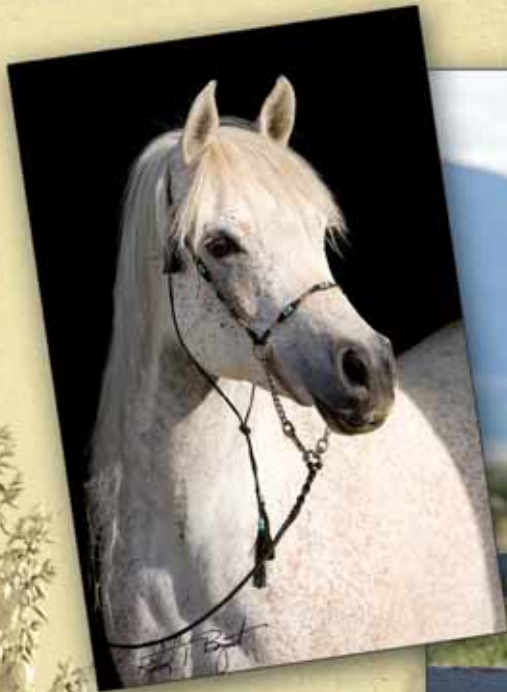
El Miladi Zuraiq (El Hadiyyah x Bint El Tareef) Hadbah Enzahiyah, Yosreia Family

"Many great breeding horses are not show horses and