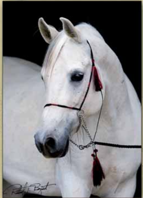
El Miladi Zaynah (Zedann x Ansata Nawarra) Dahmah Shahwaniah, Bukra Family

ever to leave the desert well deserving of preserving as