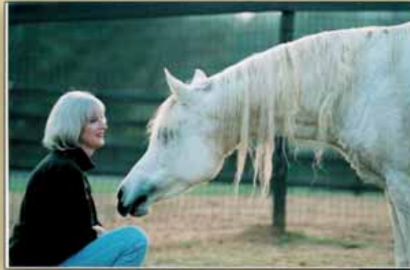
El Miladi Adeeba one of several Zedann daughters bred by El Miladi