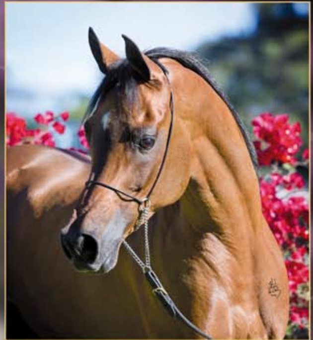
Mulayh Ibn Maareesa (Ansata Amir Zaman x Mareesa by Montasar) GERMAN IMPORTS LEASED