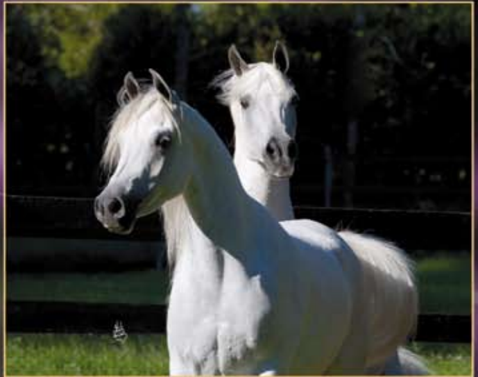
Simeon Suzannah (Asfour x Simeon Shuala by Simeon Shai)