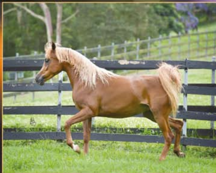
Simeon Salaeh (Asfour x Simeon Sibolet) RAMSES TINAH FAMILY