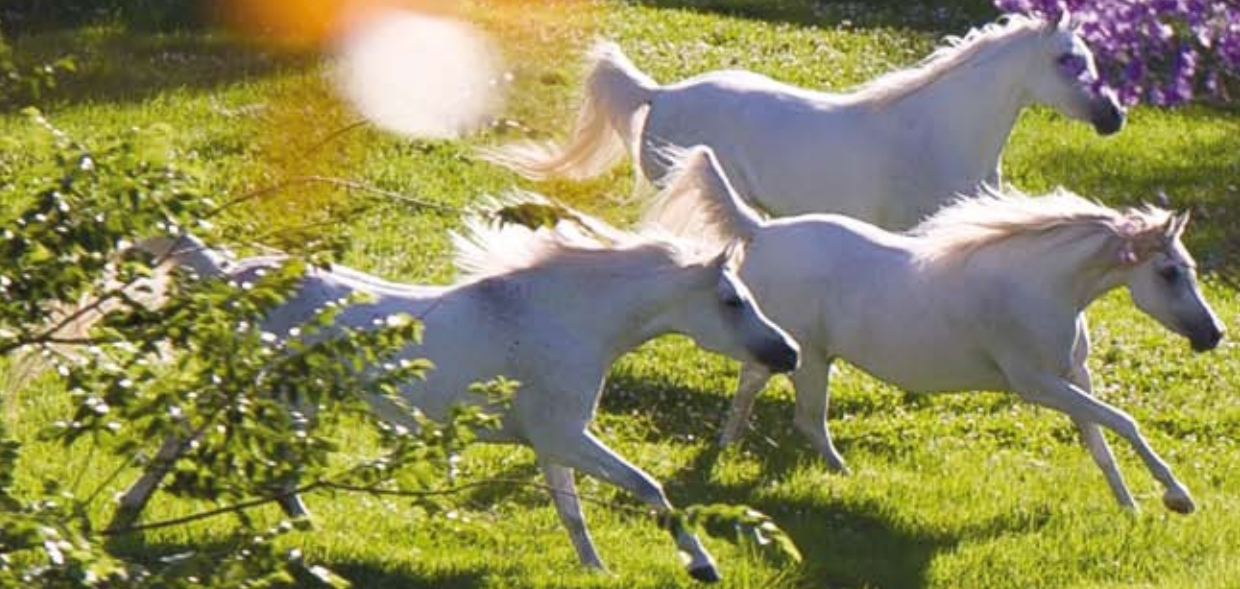
Simeon Sara (Immesmerize x Simeon Sibolet by Asfour) RAMSES TINAH FAMILY