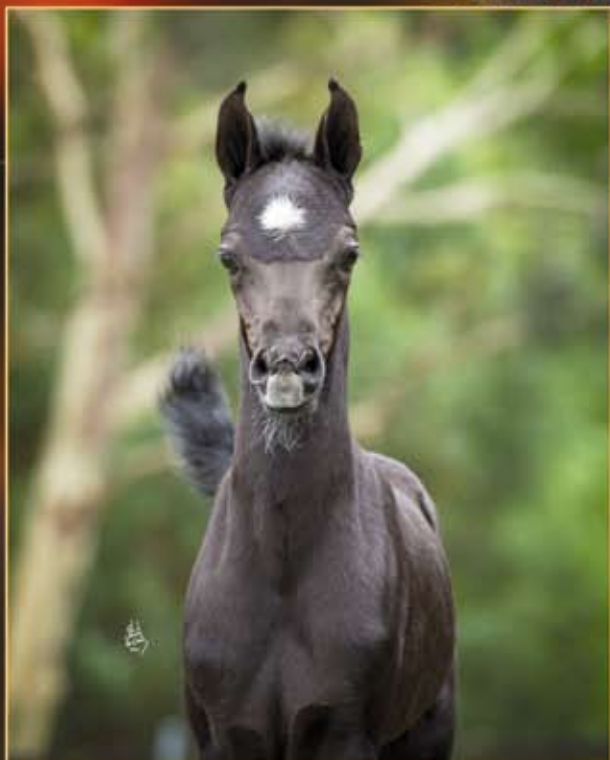
Straight Egyptian colt by Anaza Bay Shahh X Simeon Saadia (Imperial Madaar x Simeon Saada) IBN GALAL FAMILY