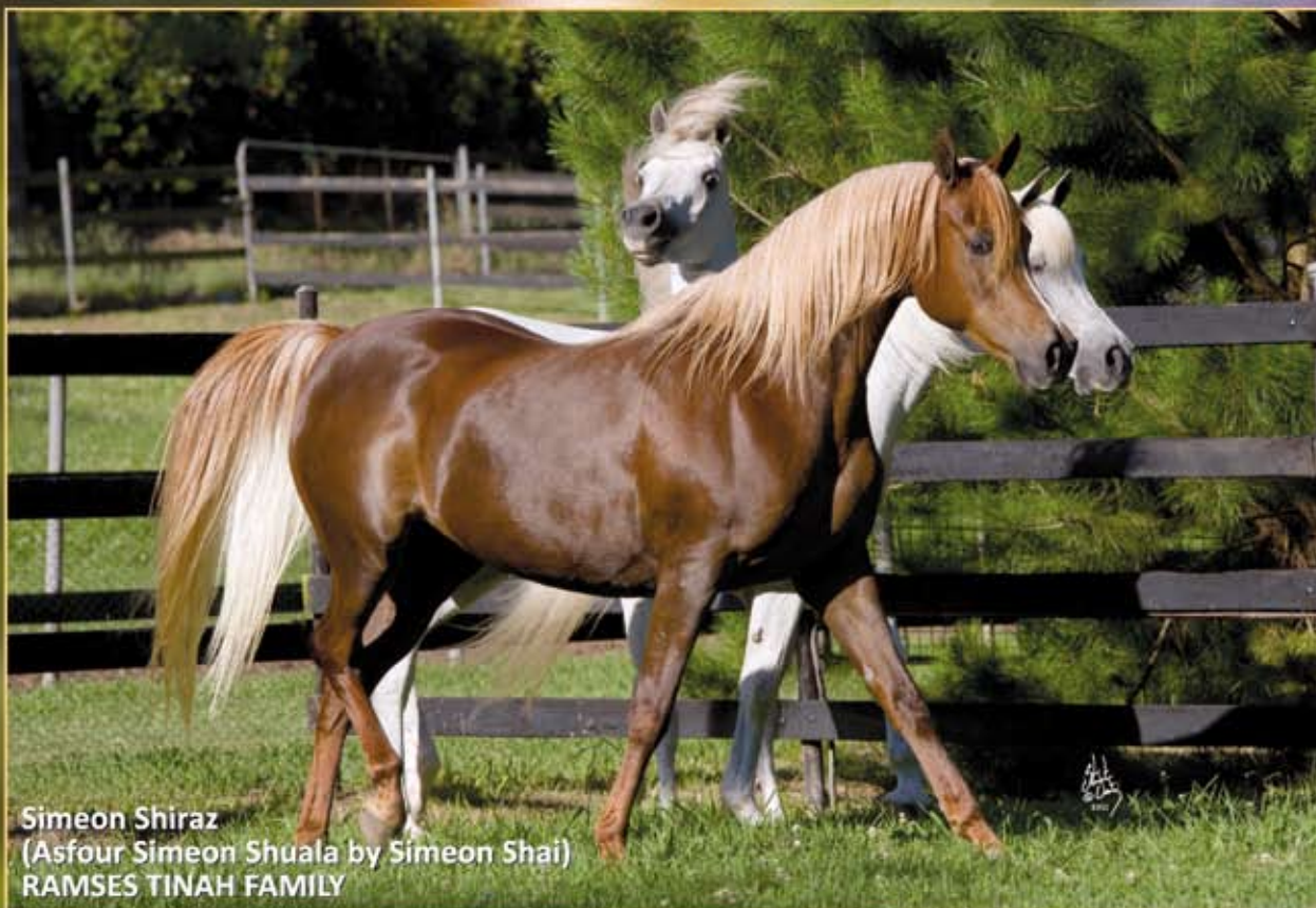
Simeon Shiraz (Asfour Simeon Shuala by Simeon Shai) RAMSES TINAH FAMILY