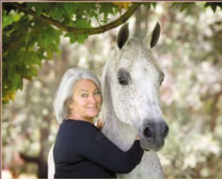
El Dahma II (Montasar x Bint Iman by Mourad) GERMAN IMPORTS