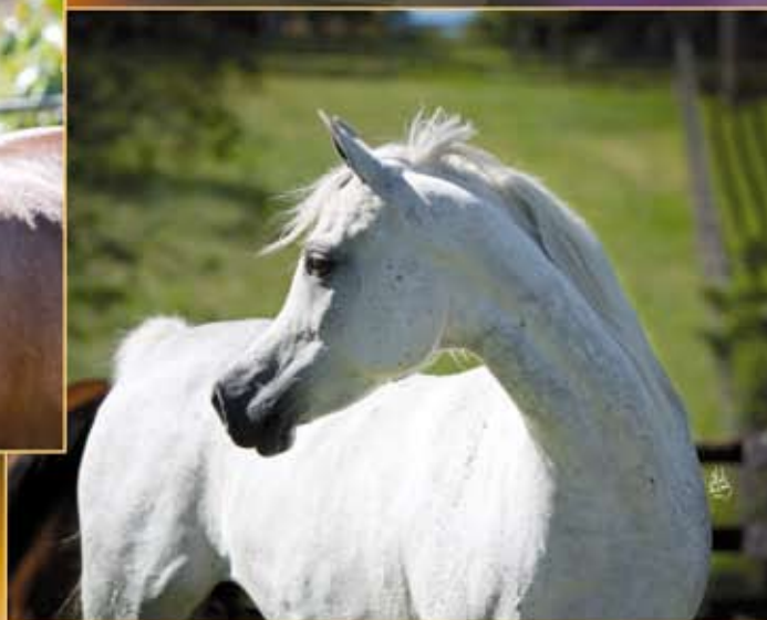
Simeon Seis (Imperial Madaar x Simeon Se by Asfour) RAFFAALAA FAMILY