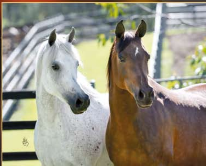
Simeon Salit & her dam Simeon Shavit (Anaza Bay Shahh x Simeon Safanad) 27 IBN GALAL V FAMILY