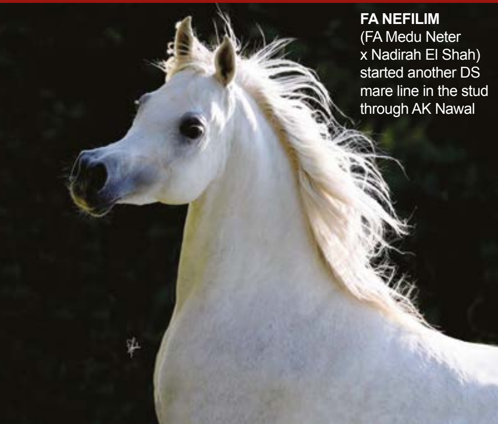
FA NEFILIM (FA Medu Neter x Nadirah El Shah) started another DS mare line in the stud through AK Nawal