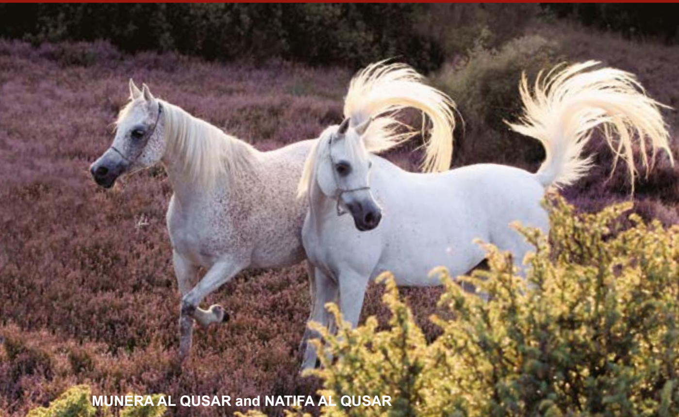
MUNERA AL QUSAR and NATIFA AL QUSAR

AL QUSAR ARABIANS is a stud of the classical horse breeding tradition. Straight Egyptian purebred Arabians have been bred there for almost 30 years. Some of the offspring have found a home in the largest stud farms in Europe and the Middle East and have had a positive influence on international breeding. Al Qusar Stud is located not far from Bremen, embedded in the green world of horse breeding in Lower Saxony, in the north-west of Germany.