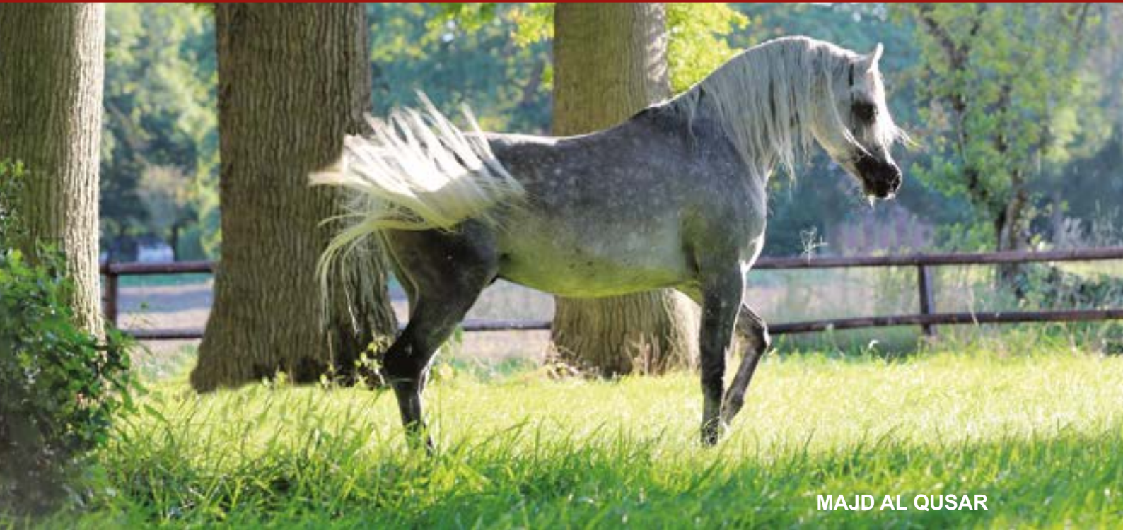
MAJD AL QUSAR

And so it happened that he remained at the stud and now one can see his very beautiful offspring with their inherited good characteristics.