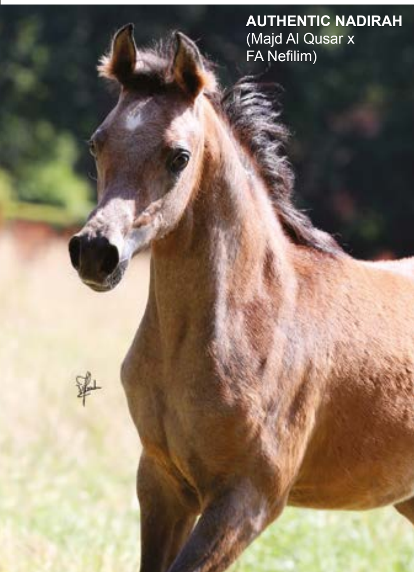
AUTHENTIC NADIRAH (Majd Al Qusar x FA Nefilim)