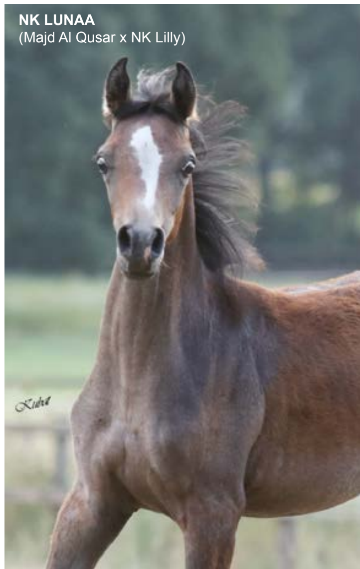
NK LUNAA (Majd Al Qusar x NK Lilly)