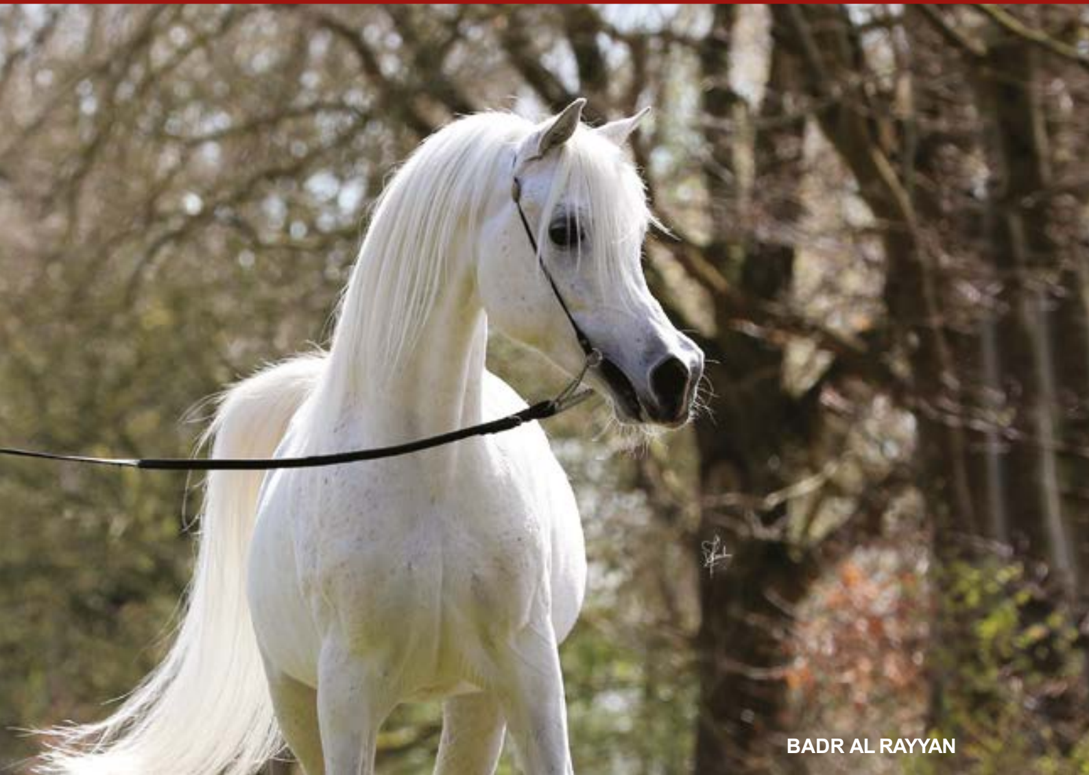
BADR AL RAYYAN