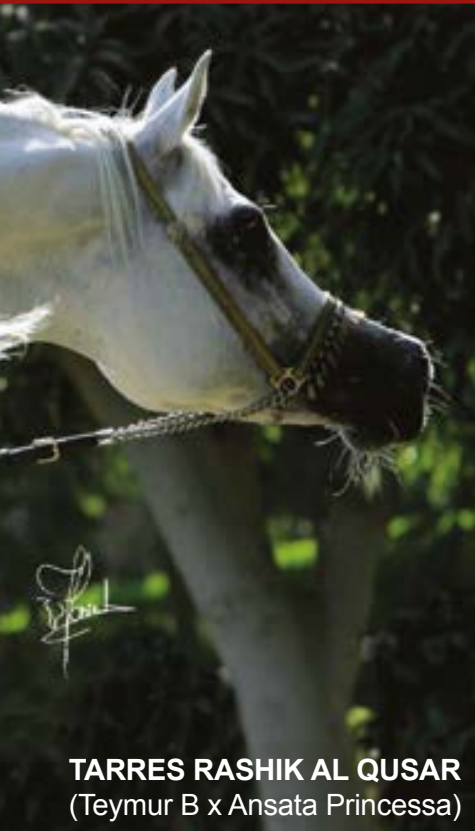
TARRES RASHIK AL QUSAR (Teymur B x Ansata Princessa)