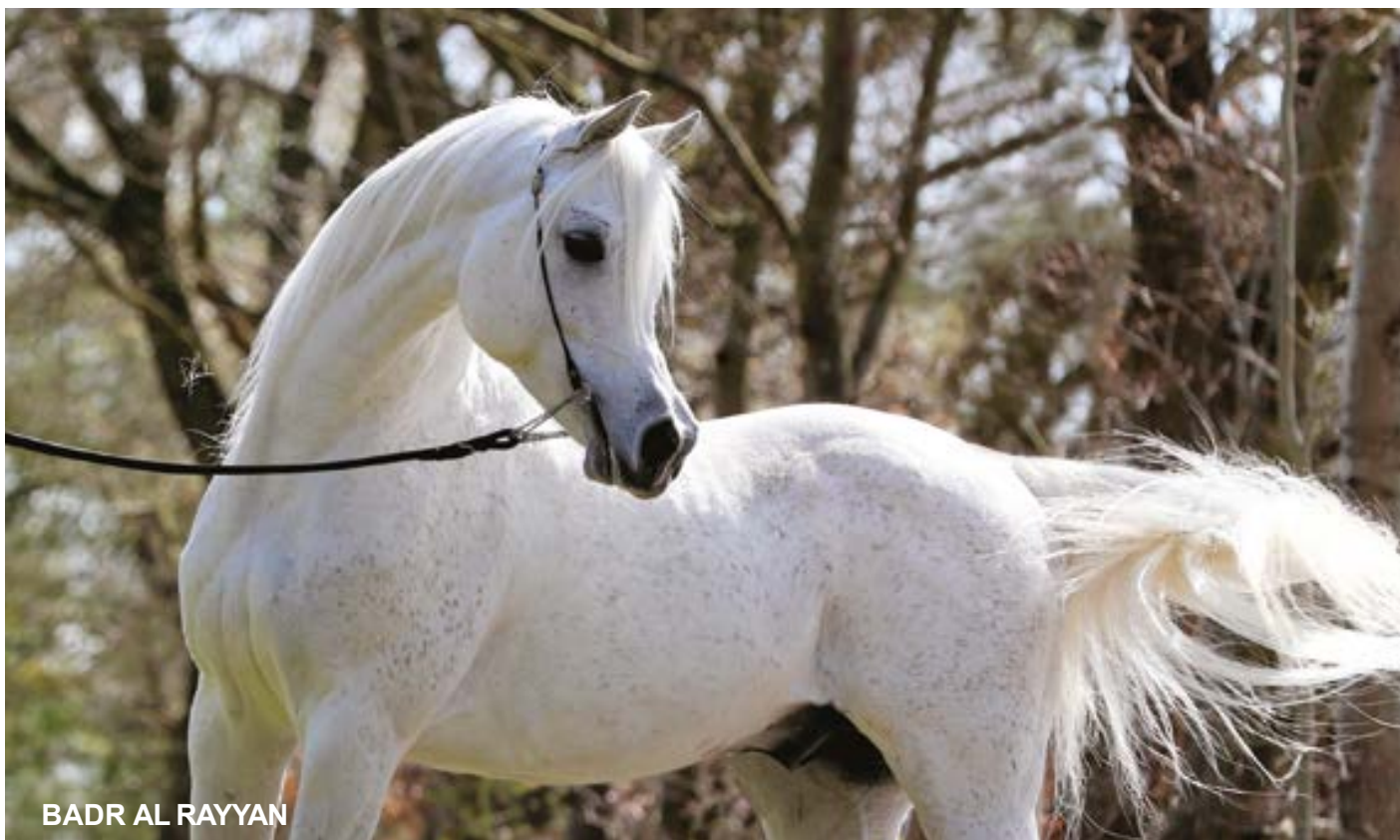
BADR AL RAYYAN