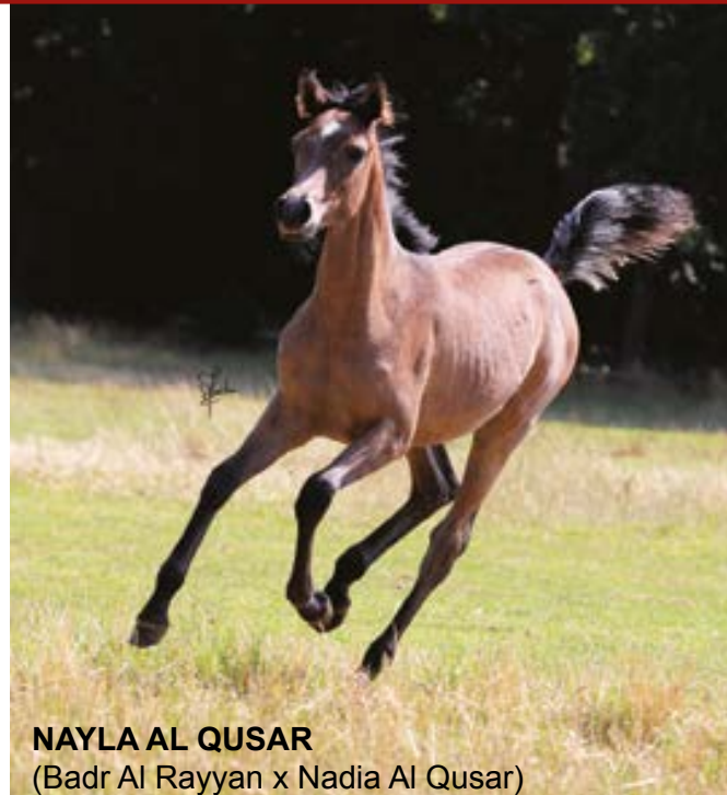
NAYLA AL QUSAR (Badr Al Rayyan x Nadia Al Qusar)