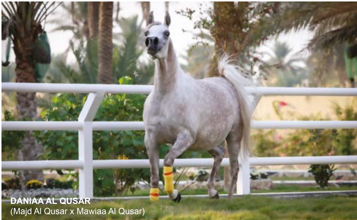
DANIAA AL QUSAR (Majd Al Qusar x Mawiaa Al Qusar)

Majd Al Qusar has an excellent character, just like his grandfather Teymur B. He is honest and gentle and loves to show off his good movement and charisma.