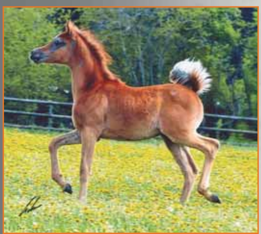
GR Lahari (Al Lahab x GR Marianah)

night blooming jasmine: all blooms with haunting essence that can take your mind on wonderful journeys. It is a time when you can find another world in the shadows before you.