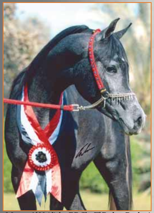
Morgan Al Najdiah – RB (Ibn El Basha x Bardeya)