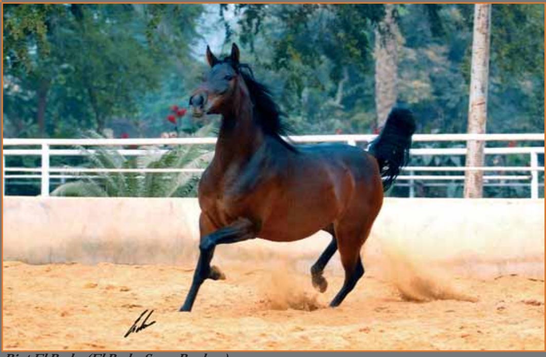
Bint El Basha (El Basha Sqr. x Bardeya)