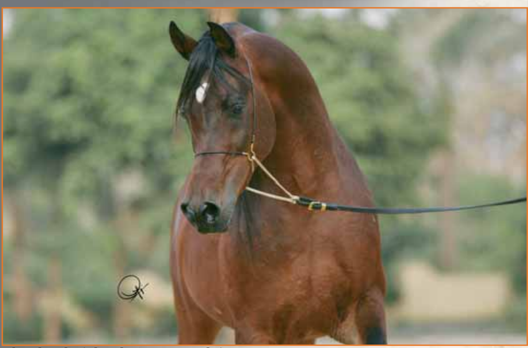
Ibn El Basha (El Basha Sqr. x Nawader)