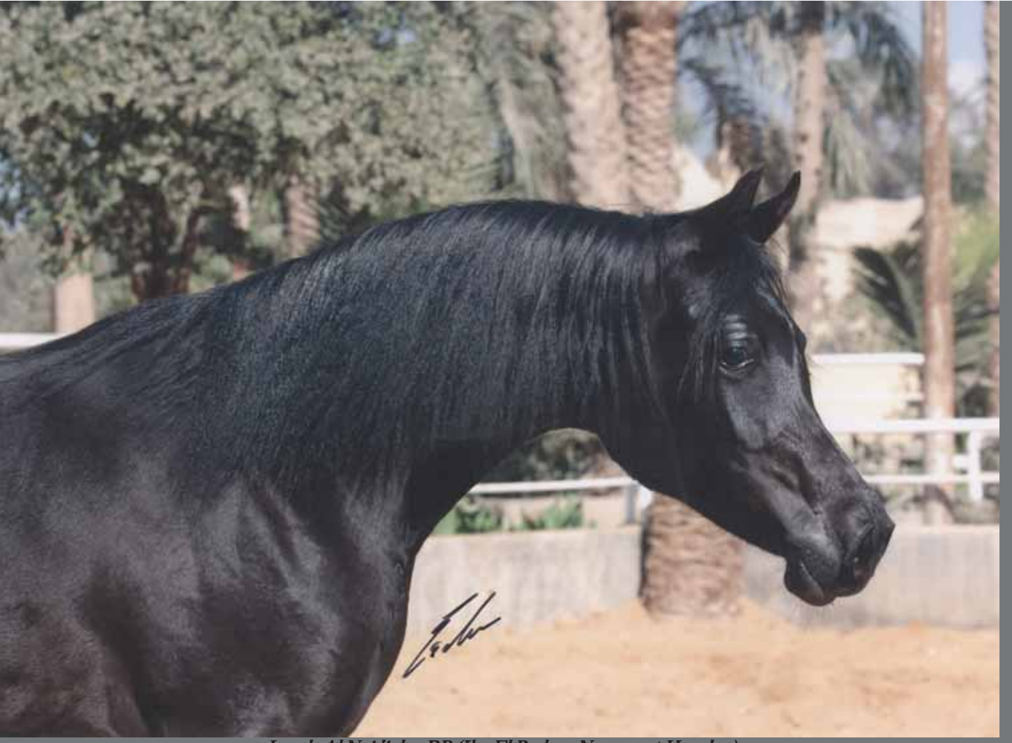
Layaly Al Najdiah – RB (Ibn El Basha x Nawwaret Hamdan)