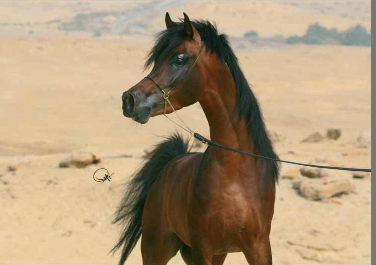
Mozahem (Shaikh Al Shamal x Nermein El Sheruk)