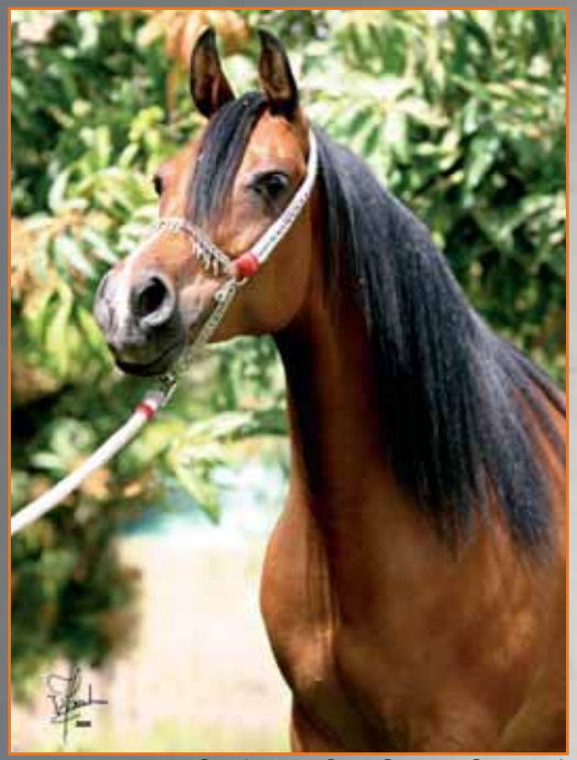
Nawwaret Hamdan (Imperial Madori x Dahimaara)