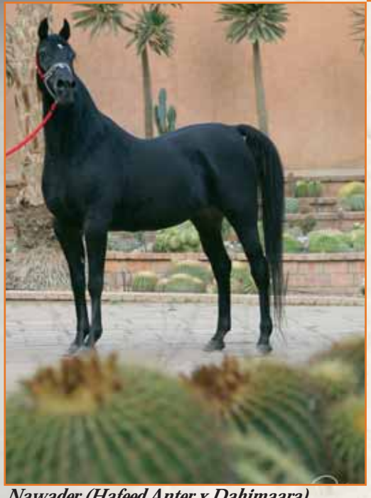
Nawader (Hafeed Anter x Dahimaara)

other bloodlines that shape the rest of the program. The original star mares are still strongly represented in today's horses. Kout El Kouloub was bred to Ibn Adaweya and together they produced Afrah, National Supreme Champion mare and the dam of Ghozlan '95 who is carrying on their special tradition. In 2002, the same pair produced Yakout RB, who even as a young stallion very clearly shows the same fine features of both his parents.