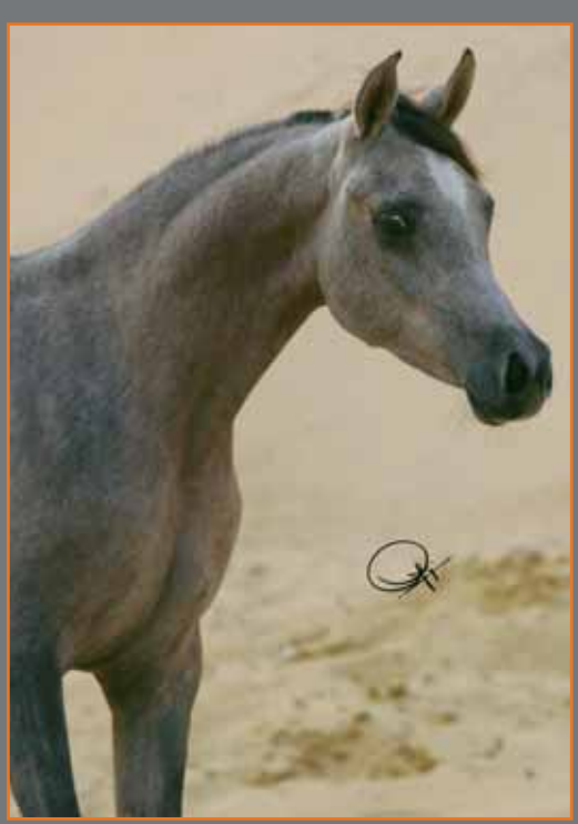
Anbar Noor (Ibn Arabia Sqr. x Hams El Kouloub)