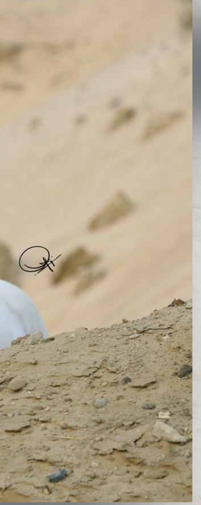
already putting his stamp on some of the younger horses on the farm. One of his fillies, Naderat Al Najdiah-RB out of Nawwaret Hamdan intensifies the Madori blood in the line.