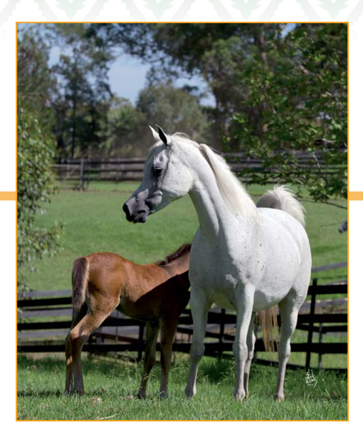
Simeon Salit (Asfour x Simeon Shavit)