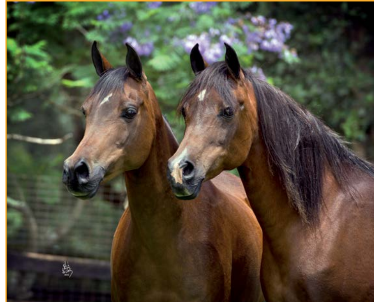
Simeon Shavit (Anaza Bay Shahh) Simeon Salome (Asfour)