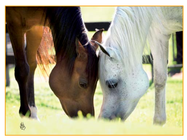
Simeon Shavit (Anaza Bay Shahh x Simeon Safanad) Simeon Salit (Asfour)