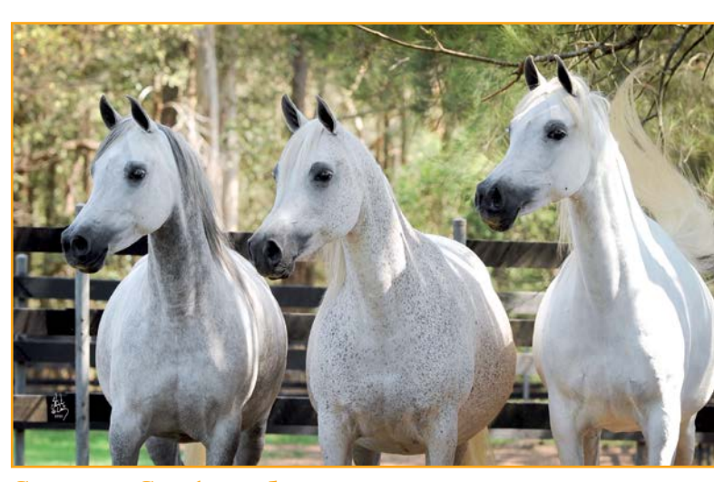
Simeon Sepharad (Asfour x Simeon Saada) Simeon Saada (Asfour x Simeon Safanad) Simeon Saadia (Imperial Madaar x Simeon Saada)