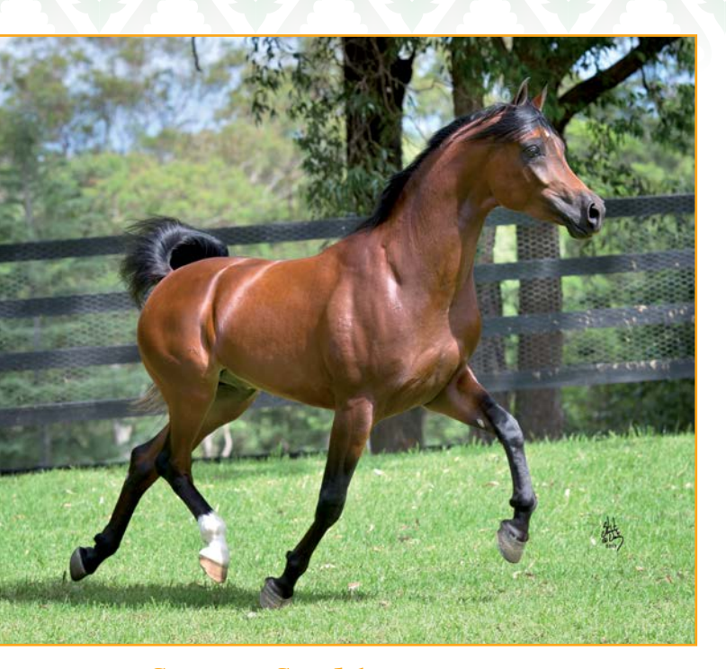
Simeon Sadik (Simeon Sadik x MB Sahammena)