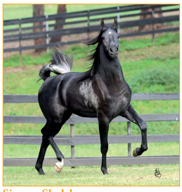
Simeon Shulchan (Anaza Bay Shahh x Simeon Saadia)