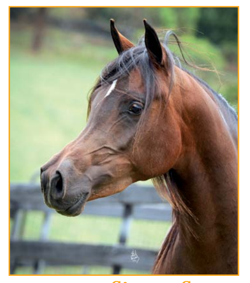
Simeon Succot (Imperial Madaar x Simeon Samra)