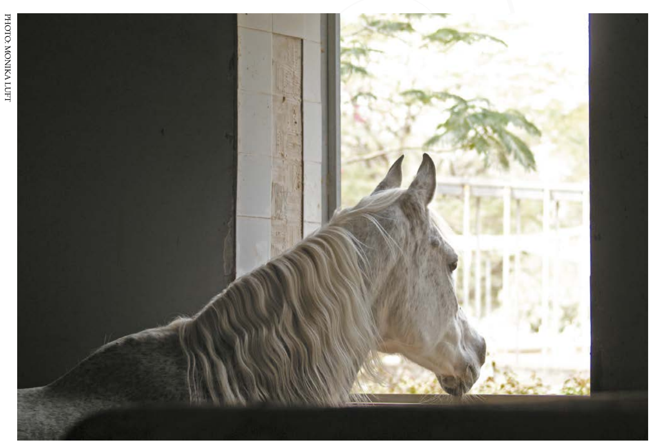
SAFI R AL RAYYAN (ASHHAL AL RAYYAN - RN FARIDA), AL RAYYAN FARM 2015