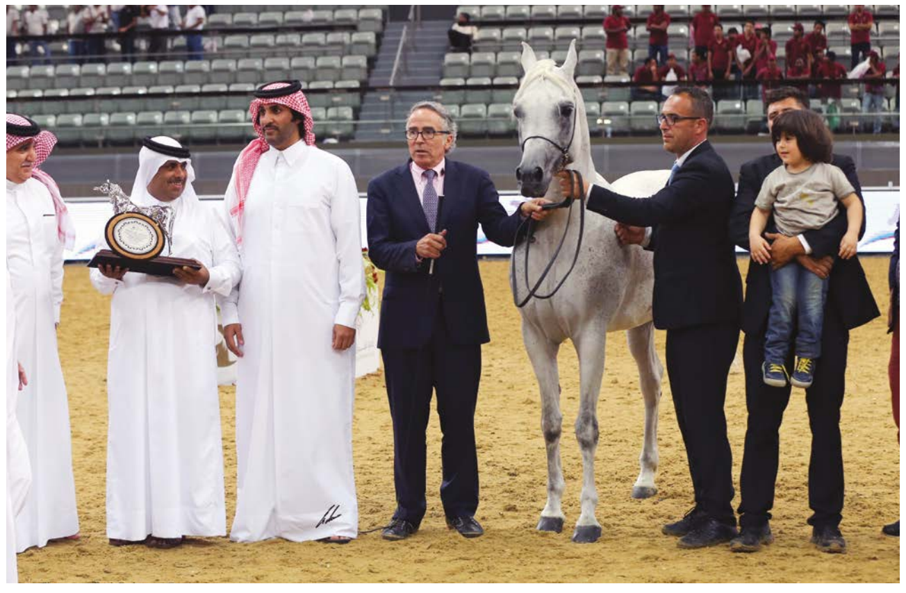
SAFIR AL RAYYAN (ASHHAL AL RAYYAN X RN FARIDA) SILVER MEDAL STALLIONS