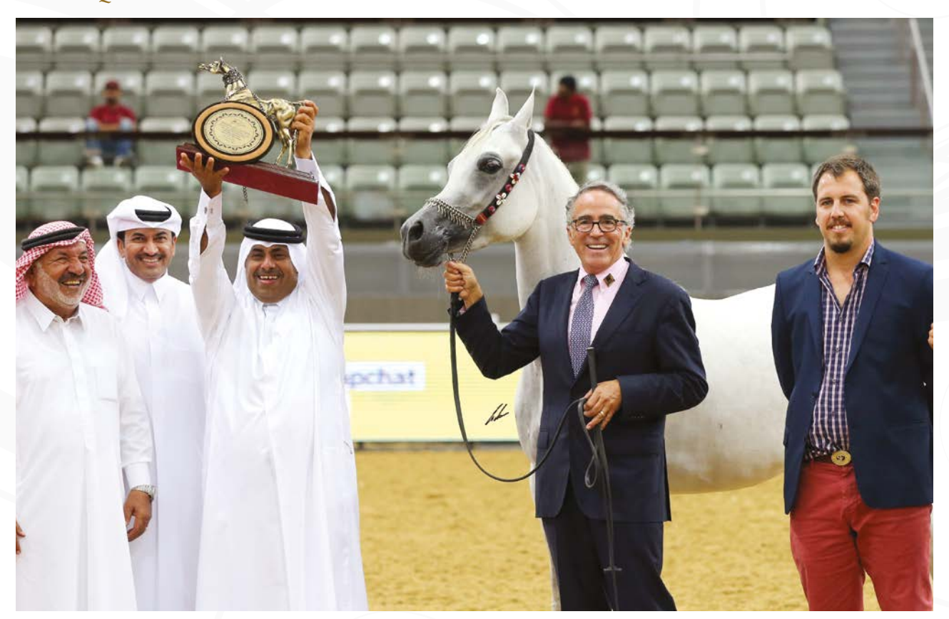
NAWAAL AL RAYYAN (ANSATA SOKAR X NADRAH AL RAYYAN) BRONZE MEDAL FILLIES