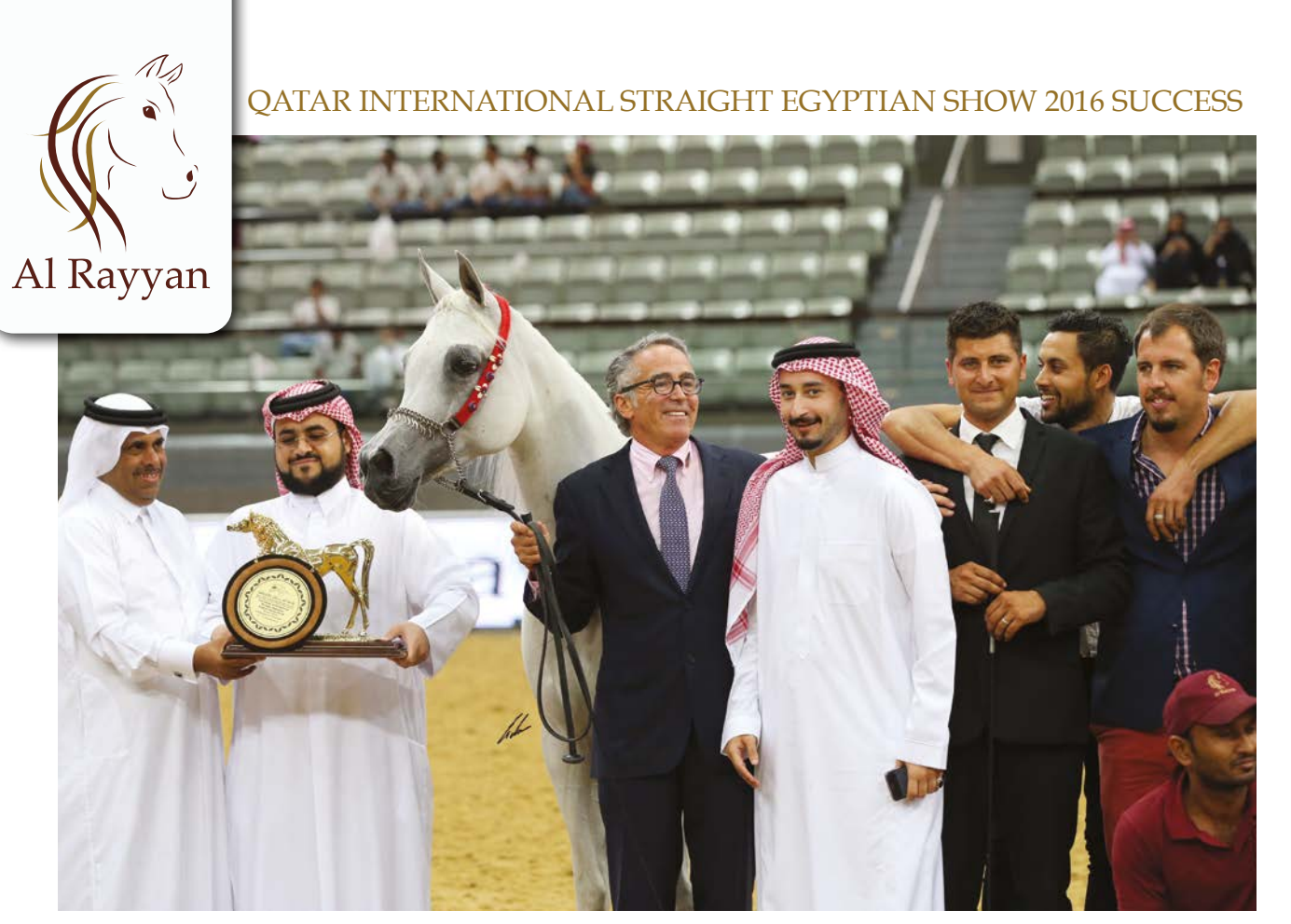
RAYYANA AL ALIYA (ASHHAL AL RAYYAN X ASRAR AL RAYYAN GOLD MEDAL MARES