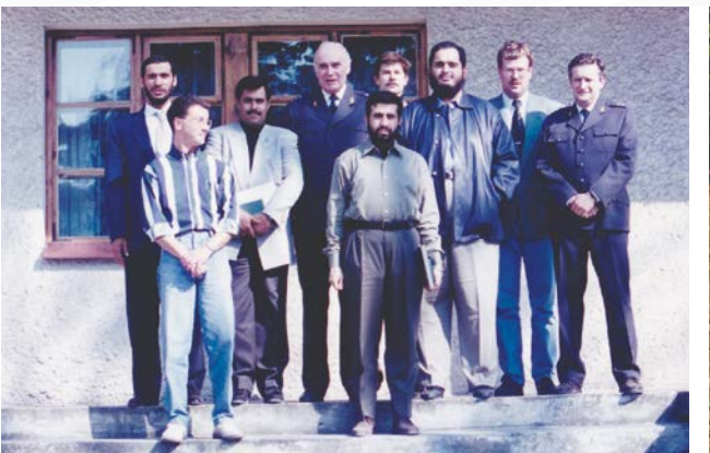
MICHAŁÓW STATE STUD, POLAND, 1994