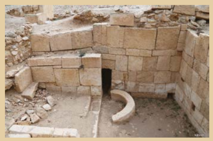
The Barbar Temple is an archaeological site, considered to be part of the Dilmun culture, dating back to 3000 BC. Al Shakhoura farm is in his neighborhood.