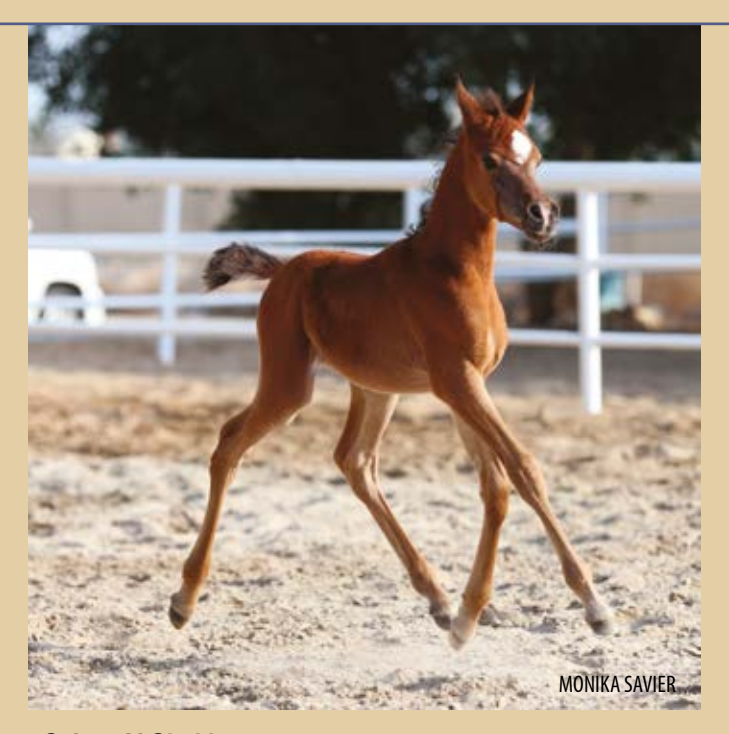
Salem Al Shakhoura Najdi Al Shakhoura x Salama Al Shakhoura by Naif Al Rayyan, Saglawi Jedran strain.