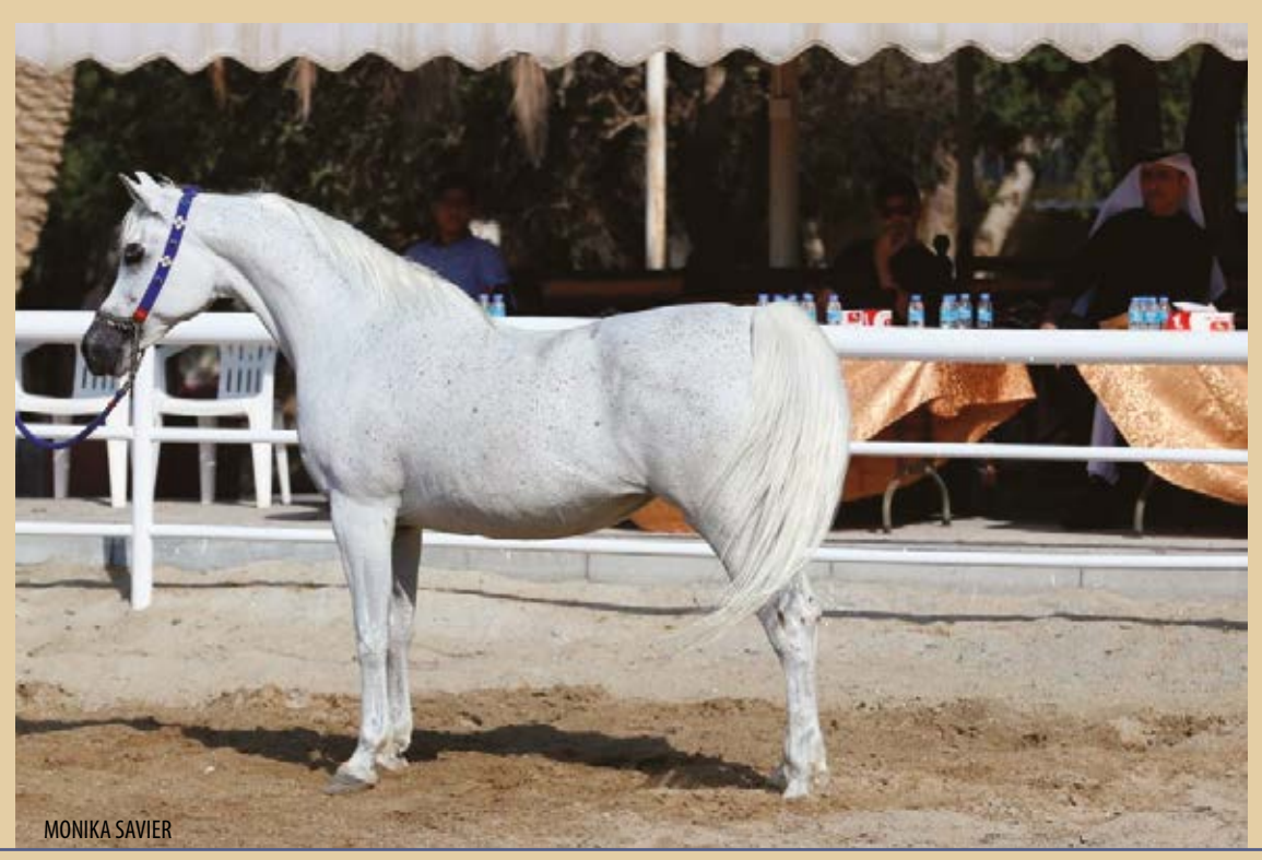
Dana Al Shaqab (Safir by Salaa El Dine x Kamasayyah by Imperial Al Kamar), Hadban Enzahi strain, foundation mare of Al Shakhoura Farm.