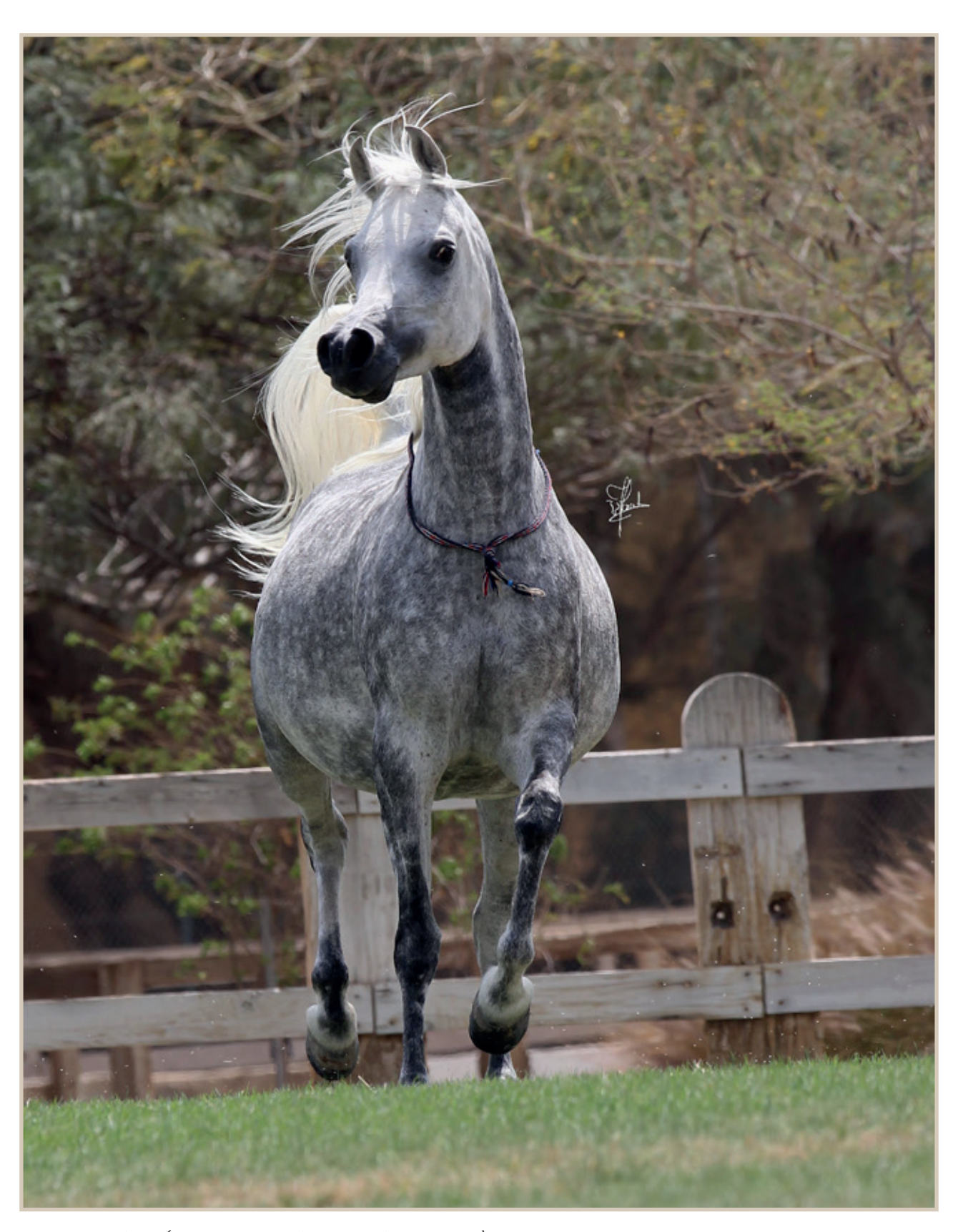
Badra Eladiyat (NK Hafid Jamil x NK Bint Nashua)