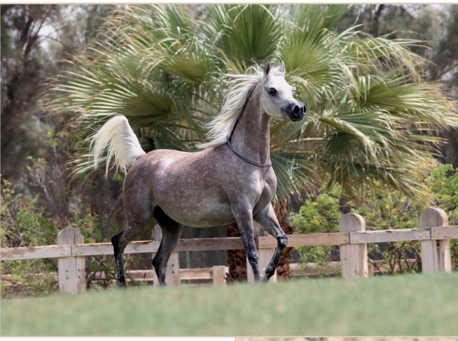
NK Aya (NK Nadeer x NK Aziza)