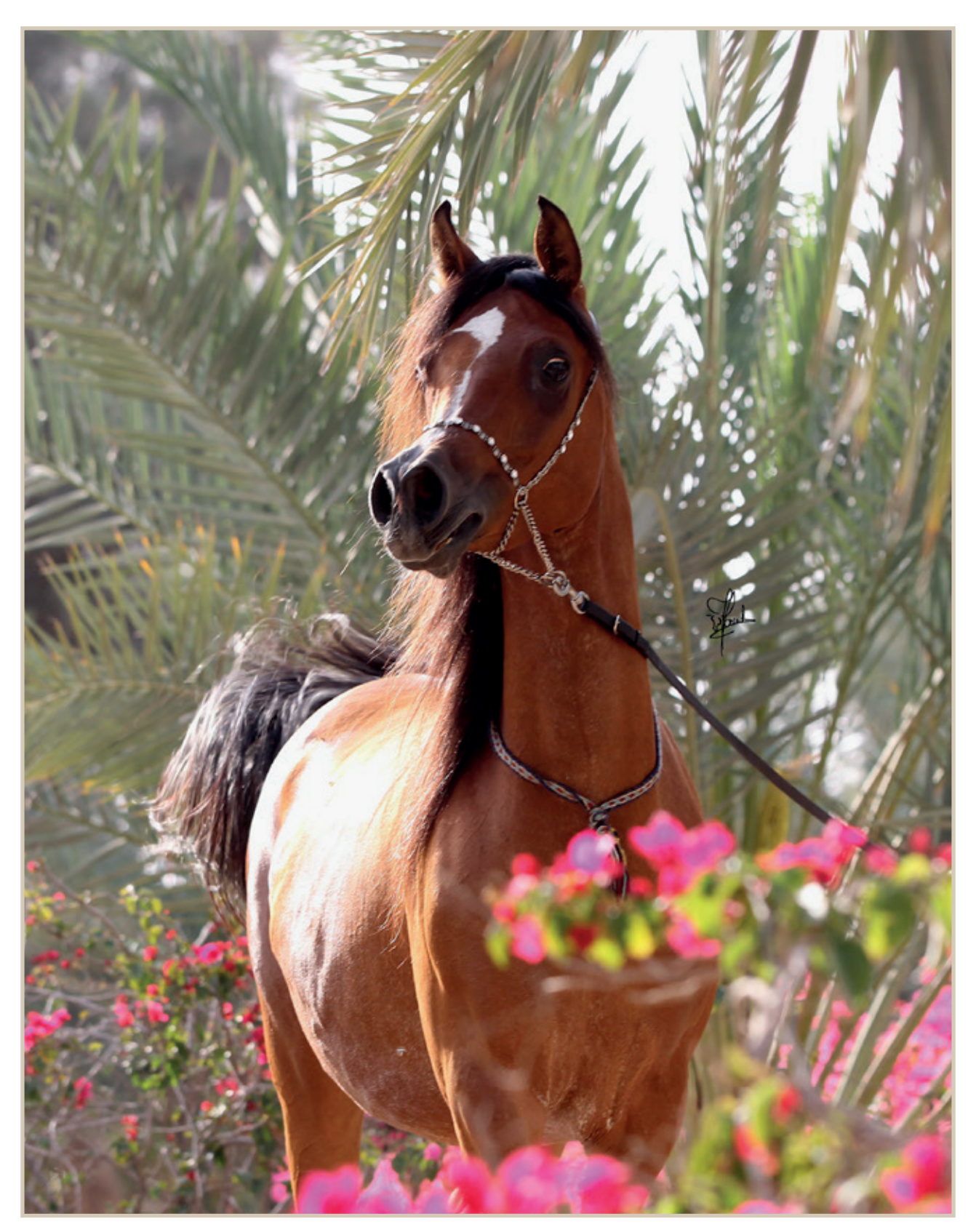
NK Lamees (NK Kamar El Dine x Munira Al Arabiya)