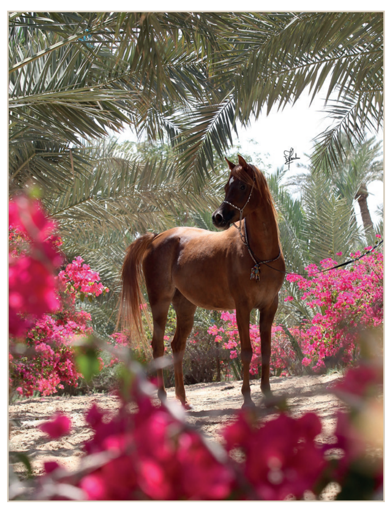
NK Laymounah (NK Nadeer x NK Leena)