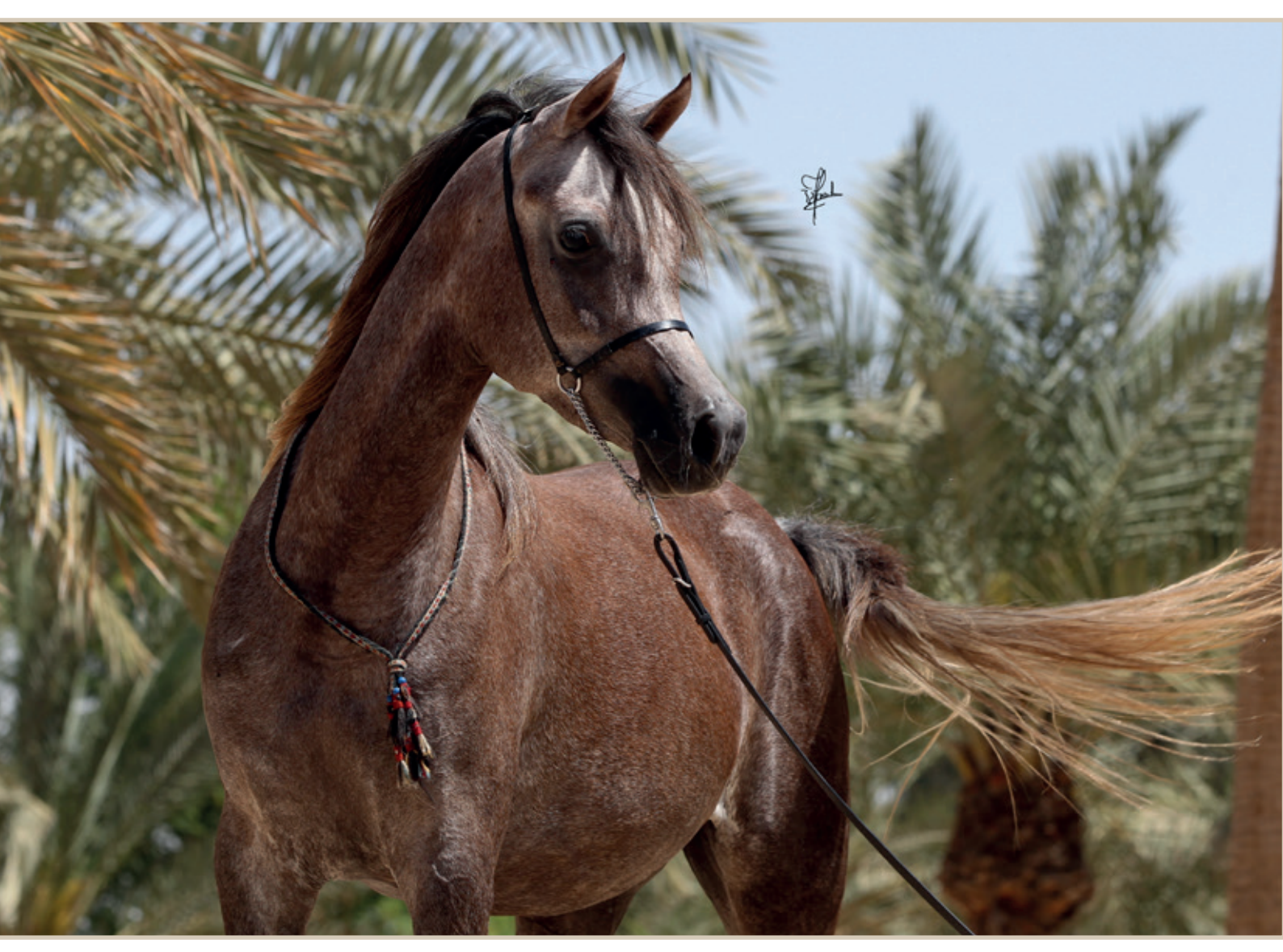
NK Luza (NK Nadeer x NK Lubna)

of Ansata Arabians – the most important five persons for the fact that the Egyptian Arabians had such a great acceptance in Qatar first and later on in Kuwait. In the course of time it became evident which type and kind of Arabian was chosen for further breeding by the major breeders. Most of them kept Ansata Arabians and their offspring. A few of them were breeding their Ansata Arabians and crossing them with horses which were coming from Katharinenhof. Some other breeders imported other Egyptians from