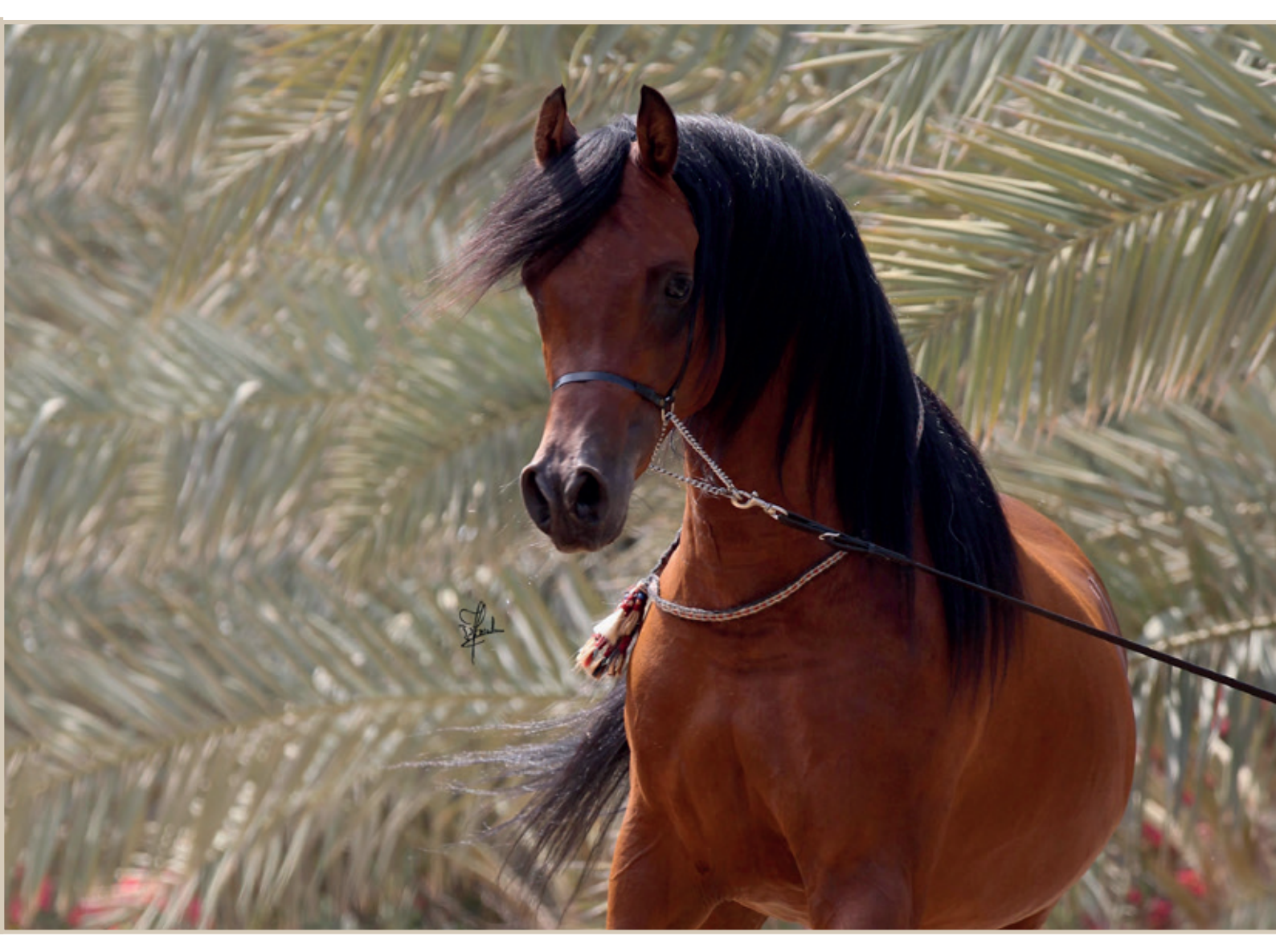
NK Nabhan (NK Nadeer x NK Nerham)

This cooperation also gives a clear answer to the often discussed question: If the environment as such is changing the Arabian type. In fact, it is not the weather, the rain and the sun, the cold and the heat which have a lasting effect on the type of horses in general. Definitely it was like this when for hundreds of years Arabian horses lived in the desert exposed to poor conditions for survival. Today this "environment" is replaced by management, a combination of feed quantity and feed quality, of housing, of limited freedom