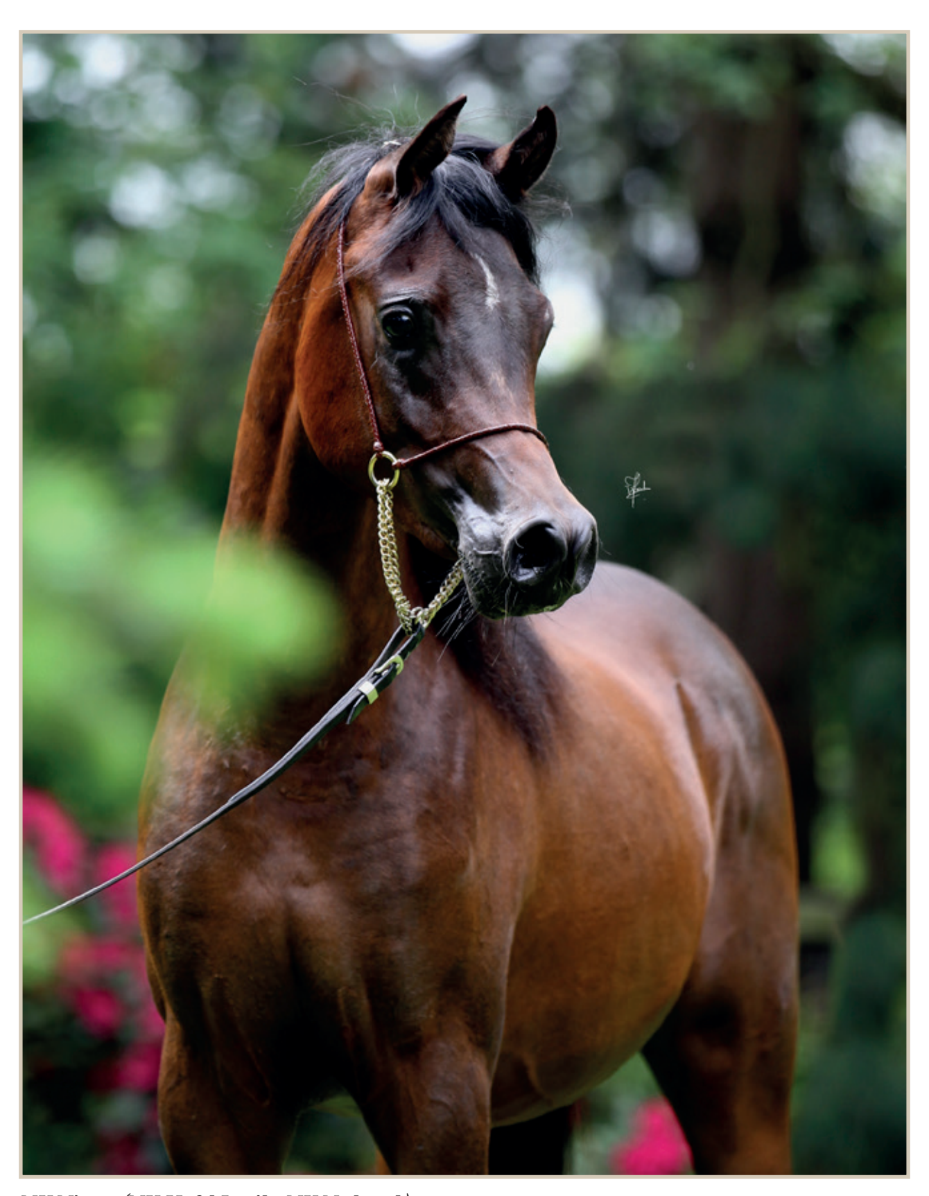
NK Nizam (NK Hafid Jamil x NK Nadeerah)