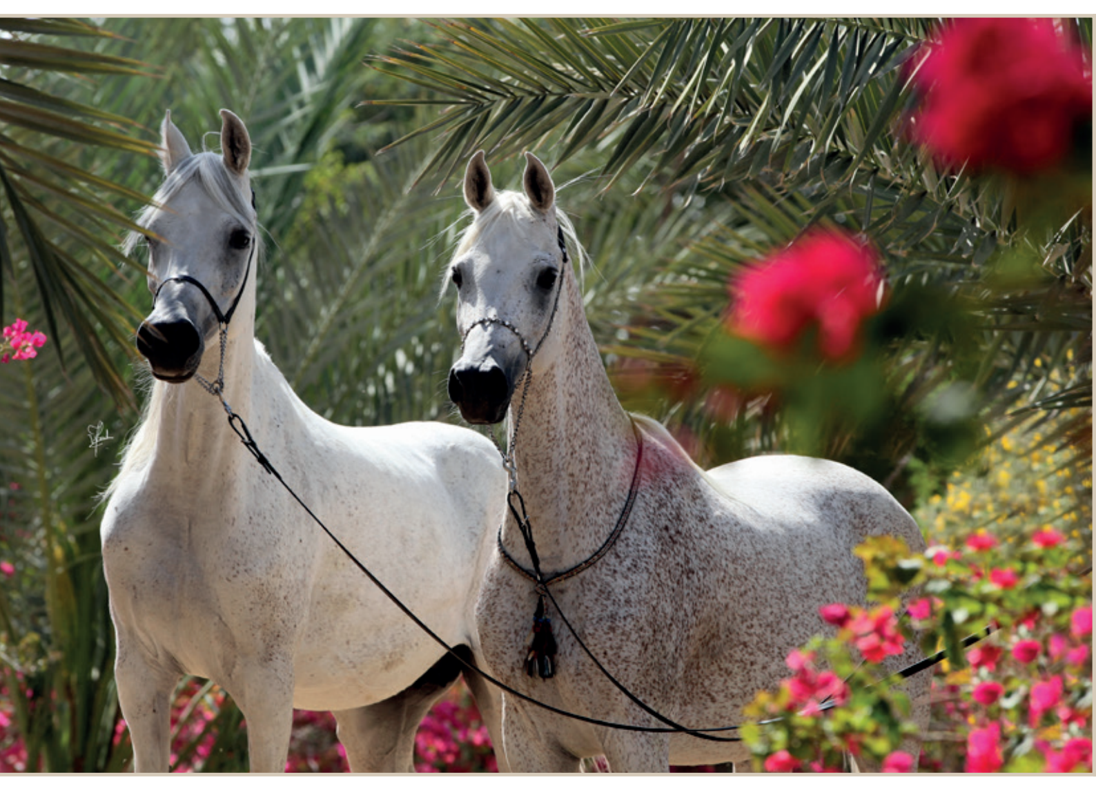
Zahia Eladiyat (NK Jamal El Dine x Zubaida Eladiyat) Amal Eladiyat (NK Jamal El Dine x NK Ahlam)

under construction and one of the most impressive community of Arabian horse studs cropped up in this area of Kuwait in a relatively short time.