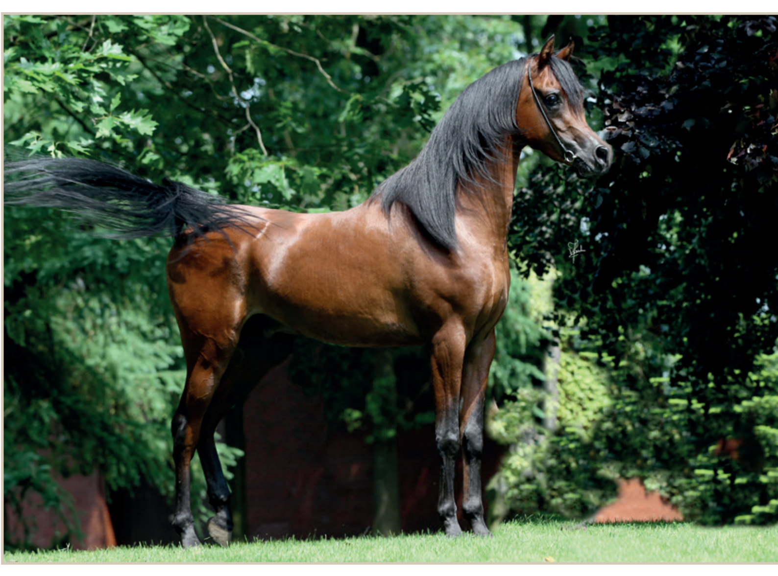
NK Nabhan (NK Nadeer x NK Nerham)

only exist in one place, but is backed up by another population in another place. Otherwise major accidents and mishaps could not destroy all these many efforts made in previous years.