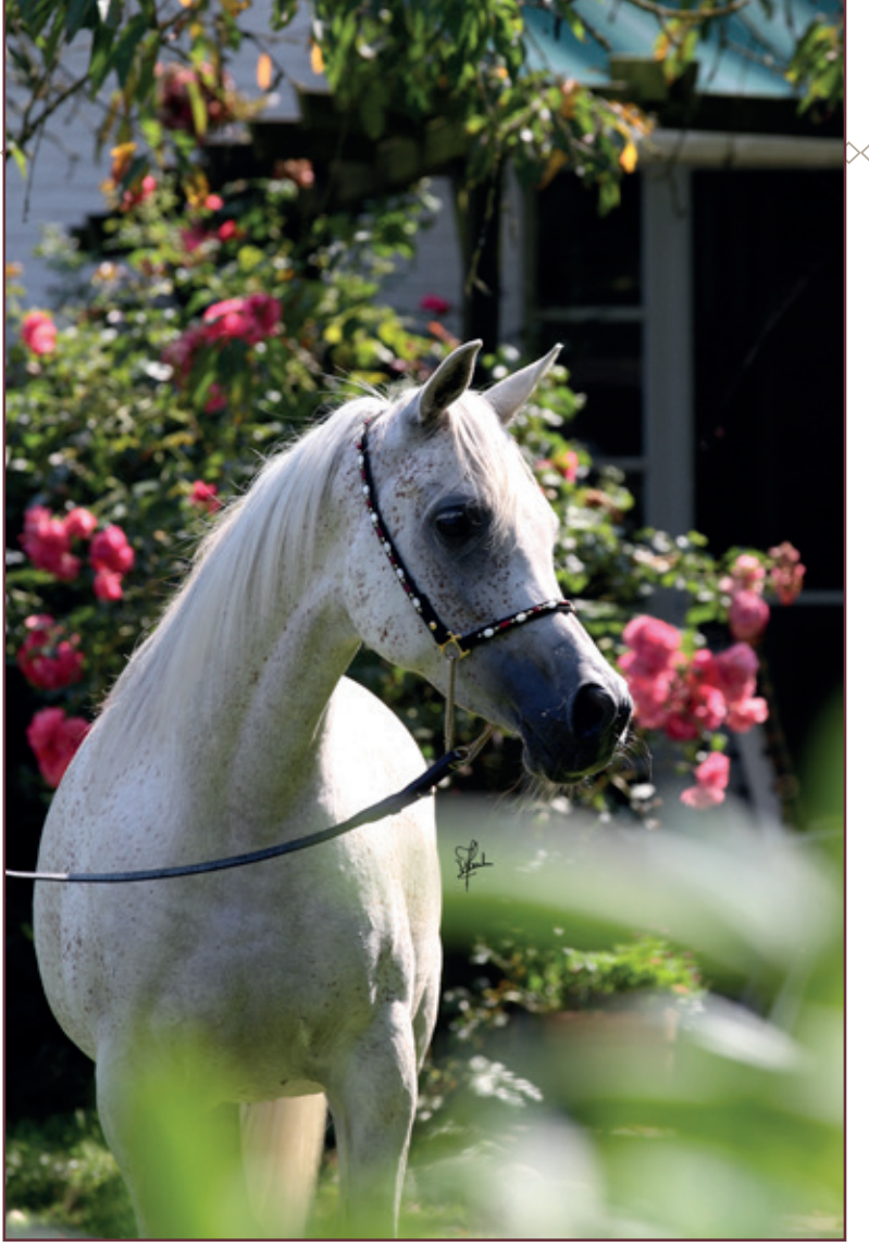
El Thay Kamria (Ansata Selman x Kamla II by Ansata Halim Shah and Mona III)

see those famous horses, of the ancient bloodlines, in their country of origin.