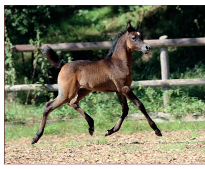
El Thay Kamala (NK Nabhan x El Thay Konouz by El Thay Mahfouz and El Thay Kamla)