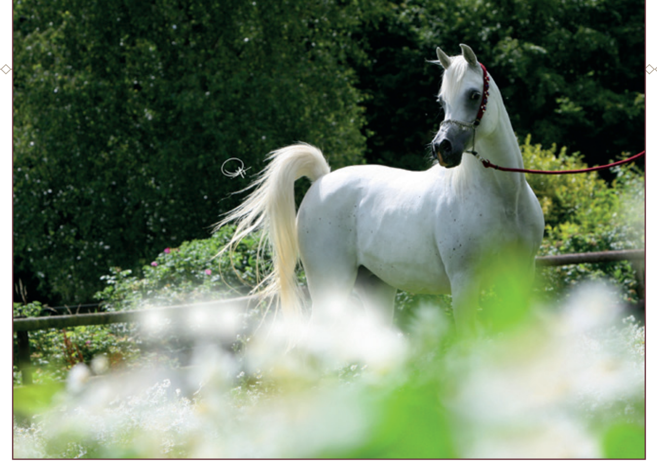
El Thay Kamla (El Thay Mashour x Kamla II by Ansata Halim Shah and Mona III) owned by Al Waab Farm, Qatar

produced good offspring already. There are not so many horse people around anymore. Some never cared for a horse themselves, they don't know anything about foal births, or about the fact that a stallion can do a natural mating, or how that is done.