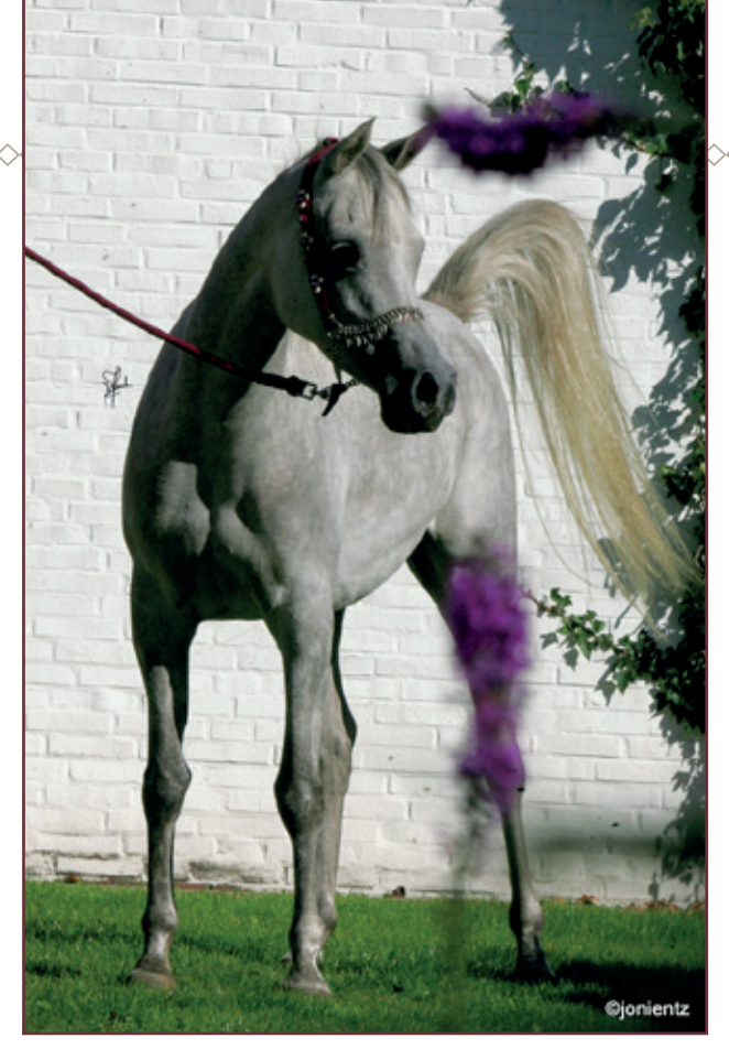
El Thay Kenana (Ajmal Tameen x El Thay Konouz by El Thay Mahfouz and El Thay Kamla)

people during the shows, and many of them were new to the field. They asked questions, and they really wanted to acquire information. There was nothing like a VIP area. Everybody was on equal standing with everybody else.