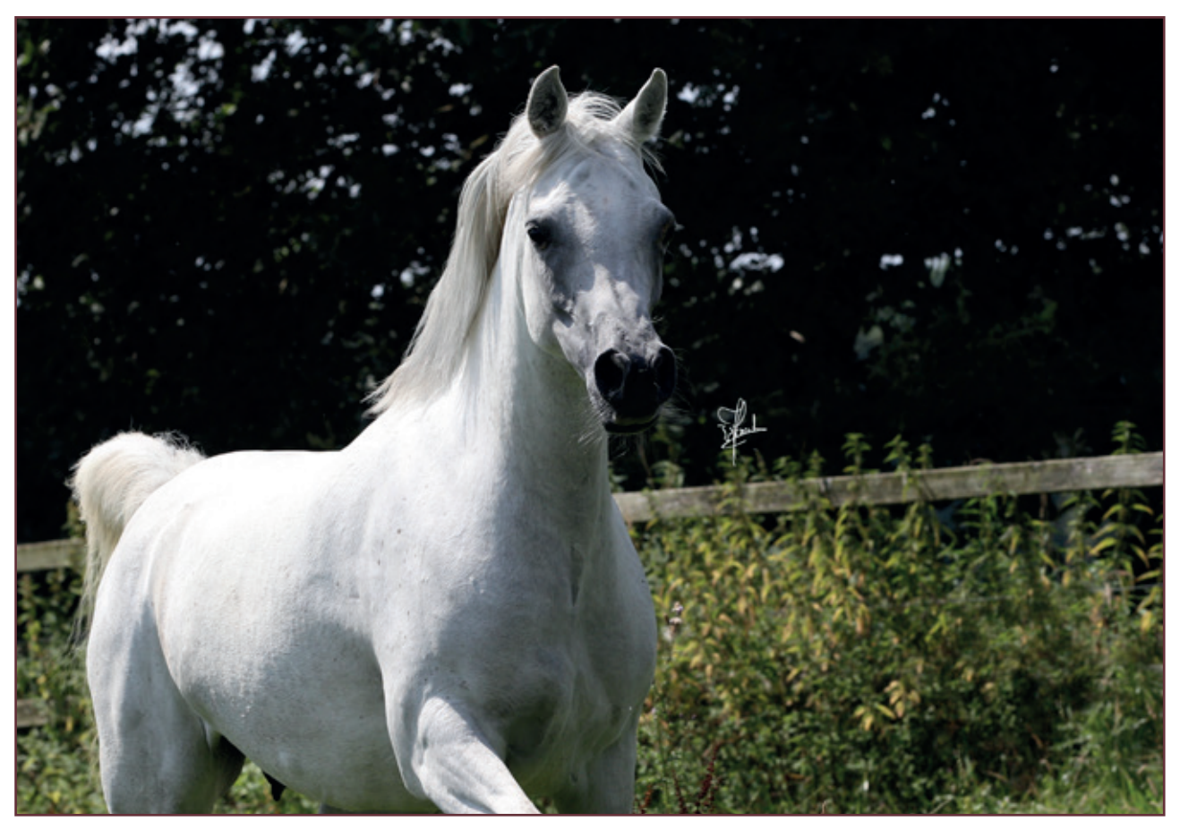
El Thay Konouz (El Thay Mahfouz x El Thay Kamla by El Thay Mashour and Kamla II)