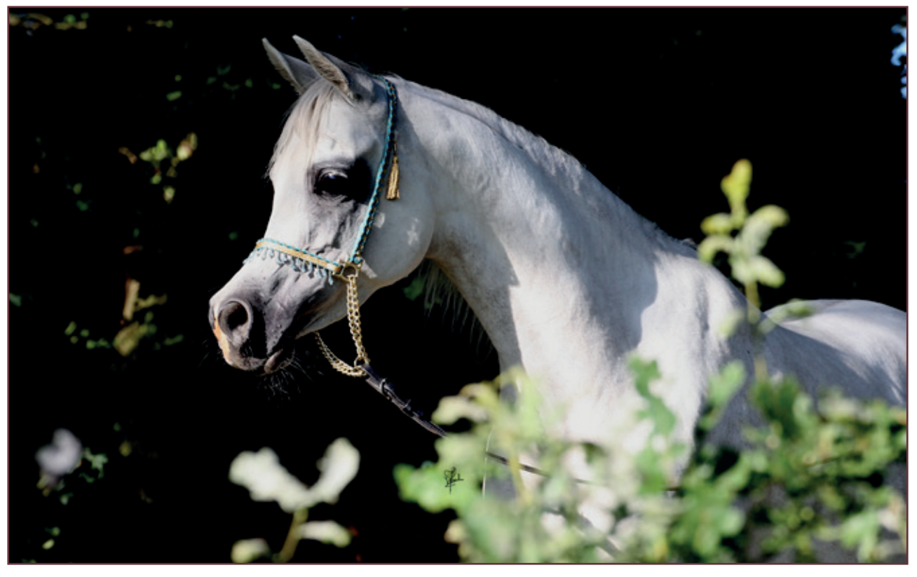
El Thay Toya (El Thay Mahfouz x El Thay Taqiyah by Ansata Selman and El Thay Tiffany)

The visitors that came to see the shows were actually interested in the horses, and we used to be addressed by