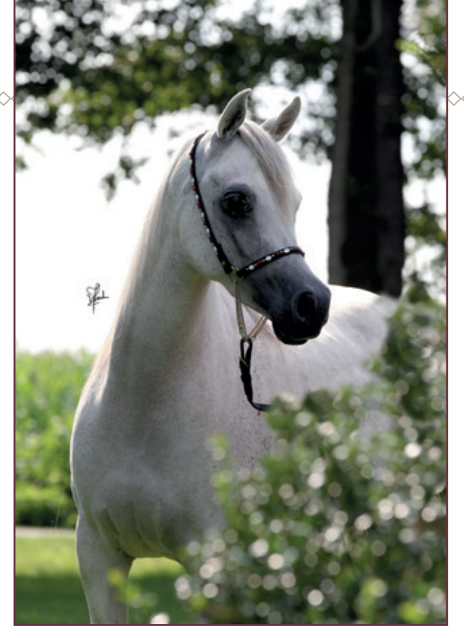
El Thay Kateefa Al Sabah (El Thay Mahfouz x El Thay Khadija by El Thay Mashour and Kamla II)