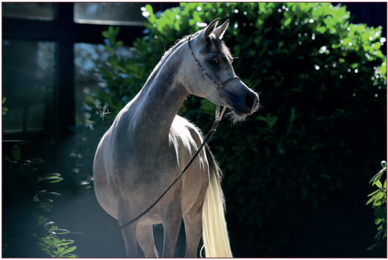
El Thay Minouha (Nader Halim x El Thay Mazyouna by El Thay Mahfouz and El Thay Malikah)