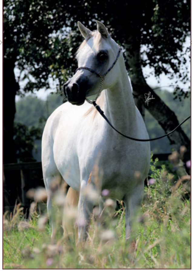
El Thay Kahila (El Thay Mahfouz x El Thay Kamla by El Thay Mashour and Kamla II)