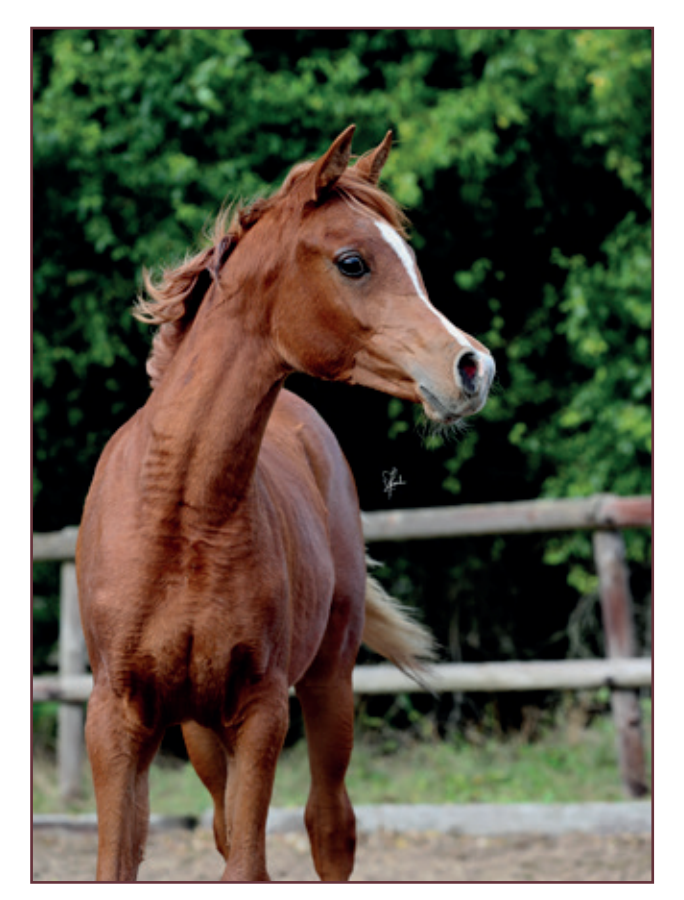
El Thay Mouna Al Ryah (Nader Halim x El Thay Mayassa by El Thay Mahfouz and El Thay Magidaa)