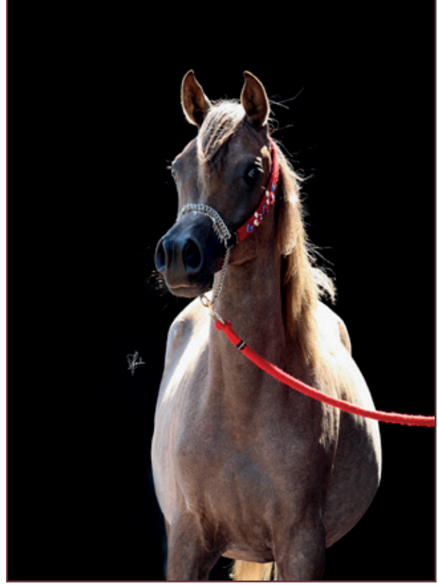
El Thay Kameelah (Nader Halim x El Thay Kareema by Ansata Selman and El Thay Kamla)

a new good home. Basically, however, everybody needs to decide for herself or himself how they will treat the animals they accepted responsibility for.