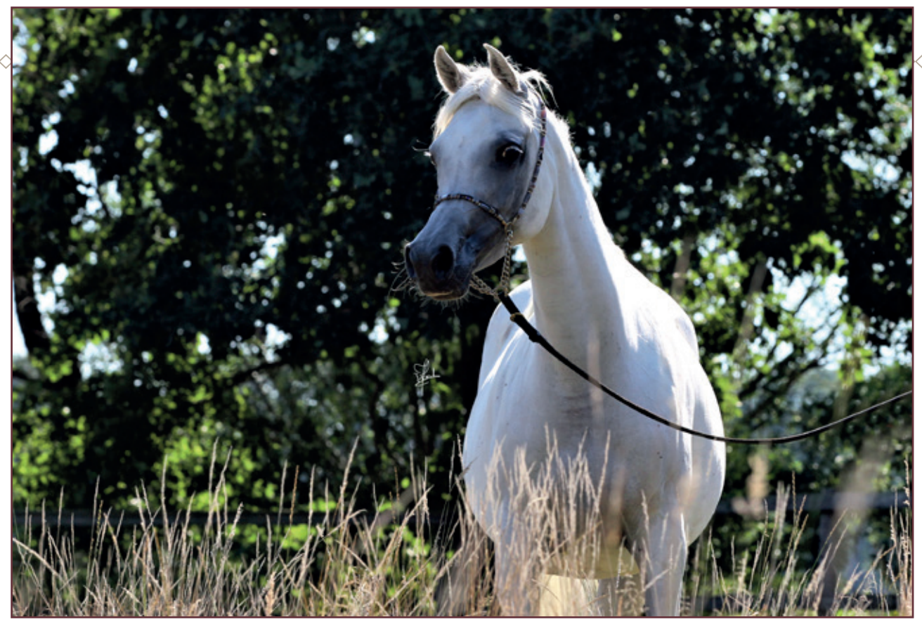
El Thay Mazyouna (El Thay Mahfouz x El Thay Malikah by Ansata Selman and El Thay Mashoura)