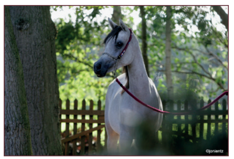
El Thay Marwa (El Thay Karim Shah x El Thay Malikah by Ansata Selman and El Thay Mashoura)

It would be better for Egyptian breeders to be really interested in maintaining the variety of bloodlines, and the variations of type within them.