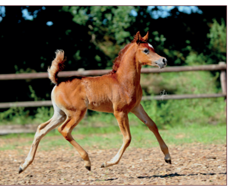
El Thay Komeira Al Sabah (NK Nabhan x El Thay Kateefa by El Thay Mahfouz and El Thay El Thay Khadija)