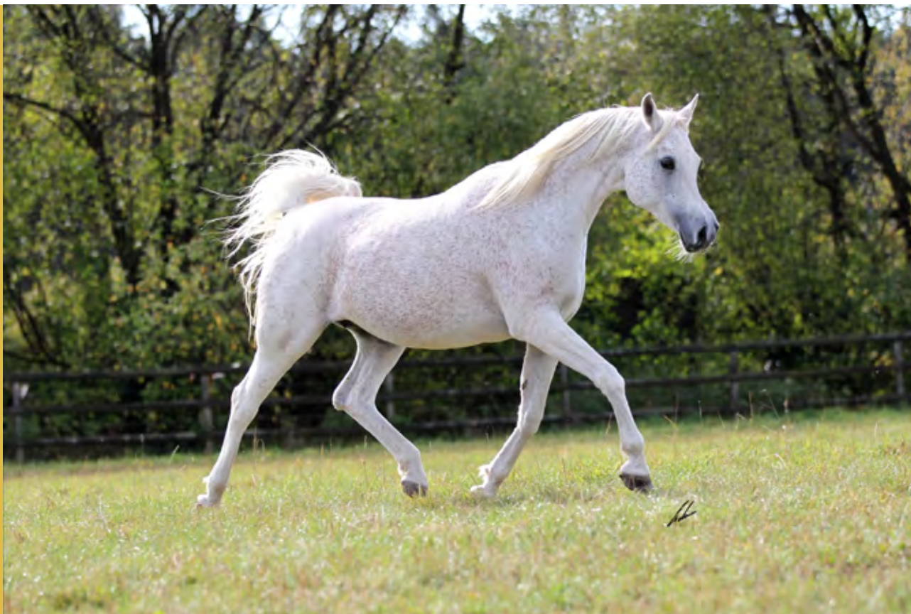
Dalima Shah Multi Champion mare by Ansata Halim Shah - one of our foundation mares