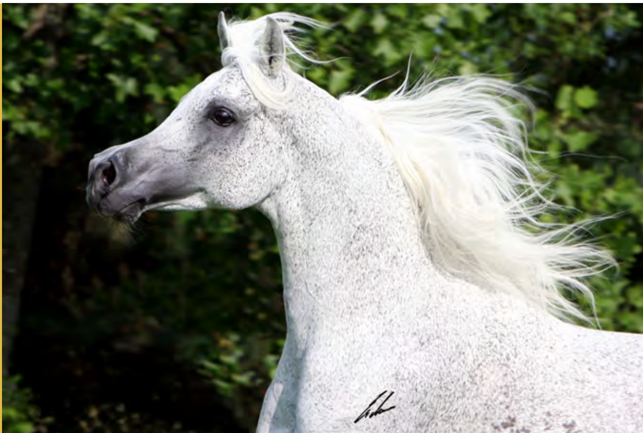
Classic Shadwan (Alidaar x Shagia Bint Shadwan) - Multi-Champion, foundation stallion