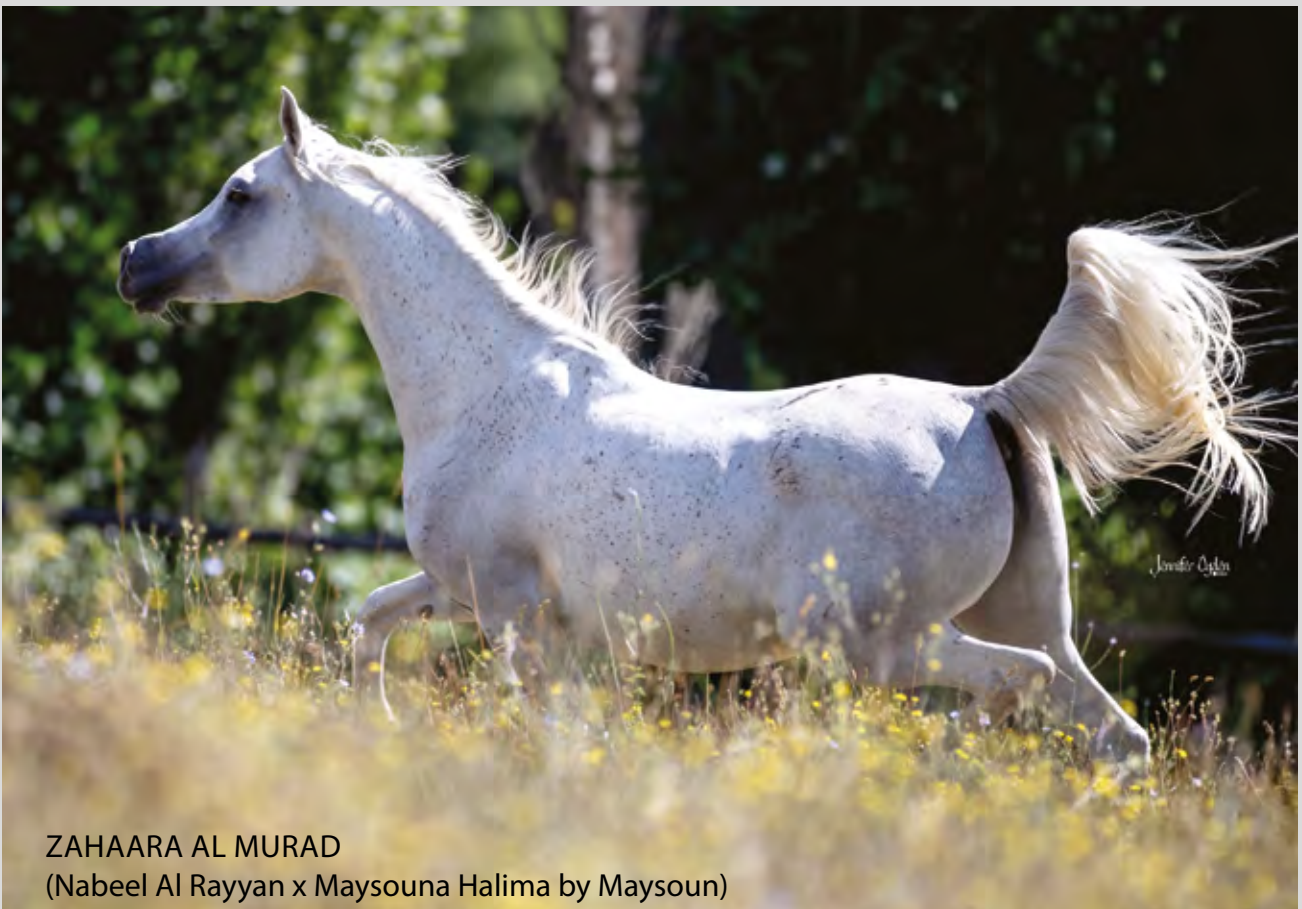
ZAHAARA AL MURAD (Nabeel Al Rayyan x Maysouna Halima by Maysoun)