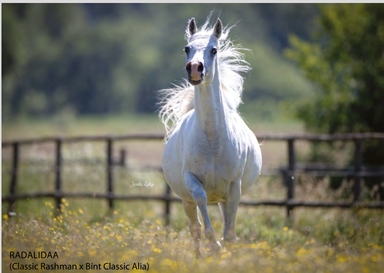
RADALIDAA (Classic Rashman x Bint Classic Alia)