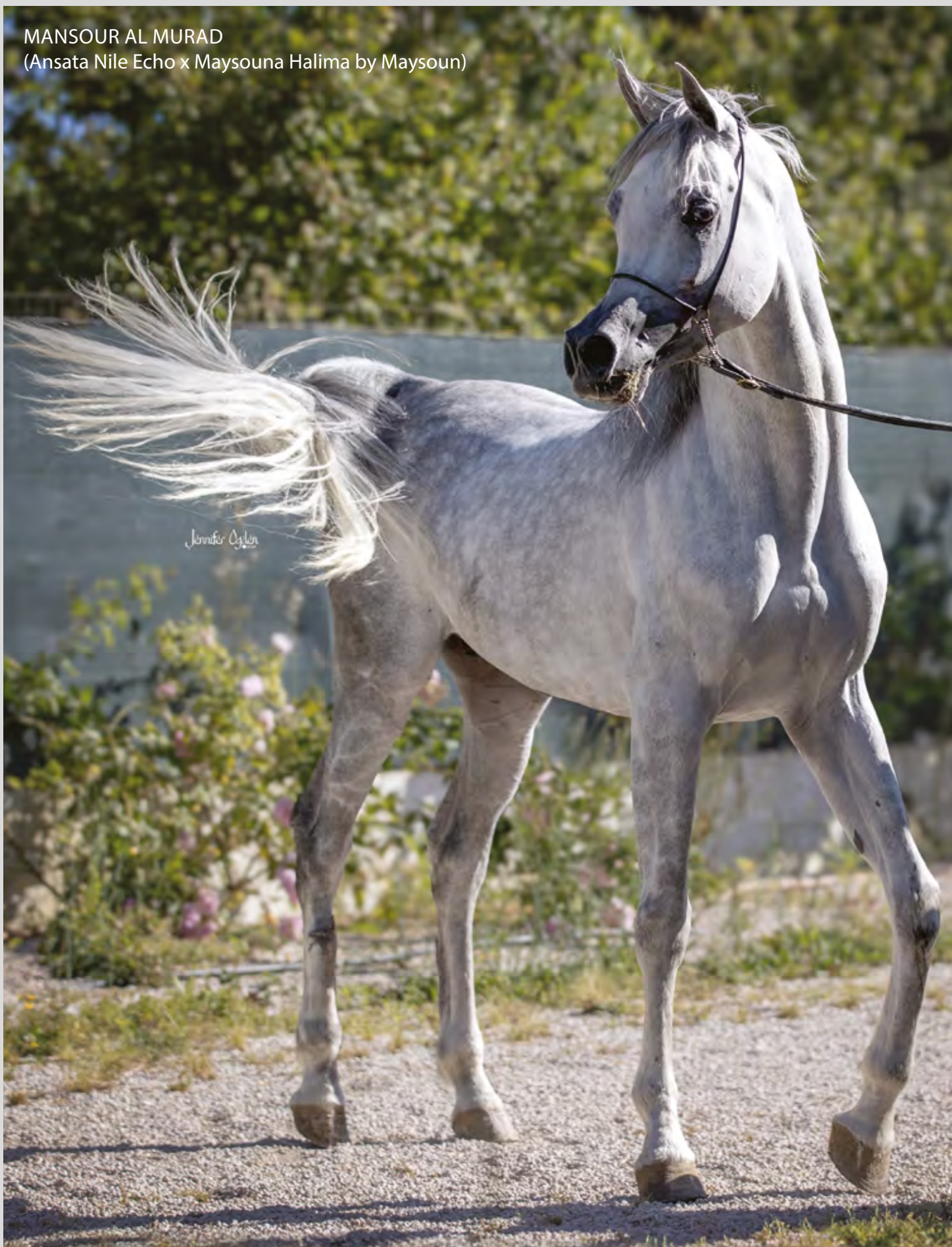
MANSOUR AL MURAD (Ansata Nile Echo x Maysouna Halima by Maysoun)