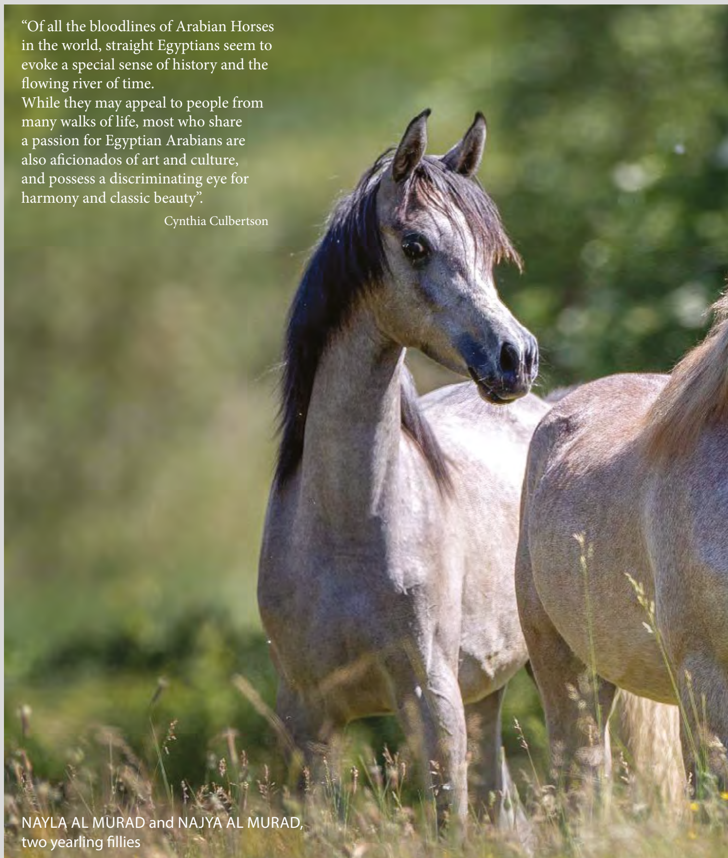
NAYLA AL MURAD and NAJYA AL MURAD, two yearling fillies