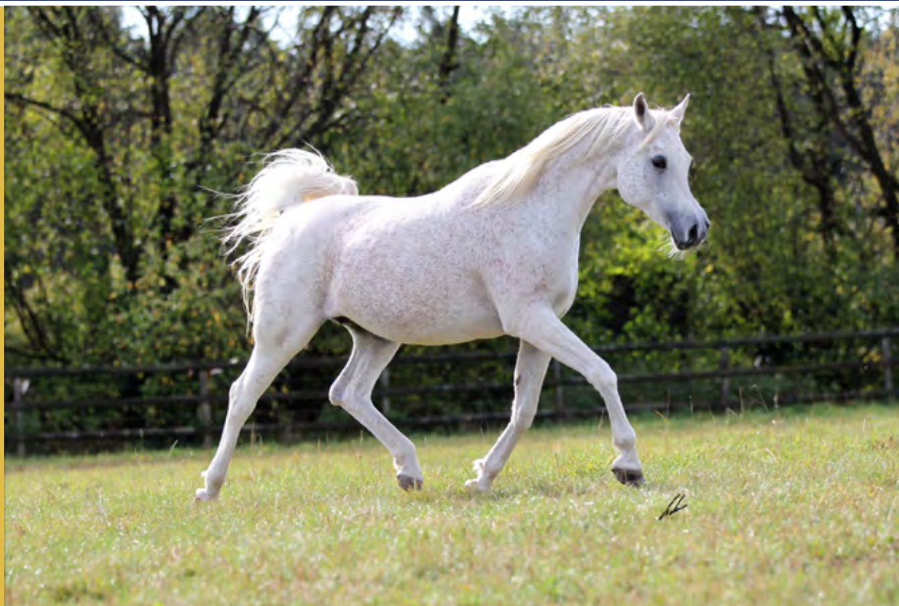
Dalima Shah Multi - & European Champion Straight Egyptian by Ansata Halim Shah - one of our foundation mares