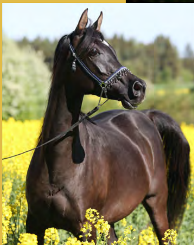
GR Faleeh (Madallan-Madheen x Fasinah) & Annette, the day before GR Faleeh left to Kuwait