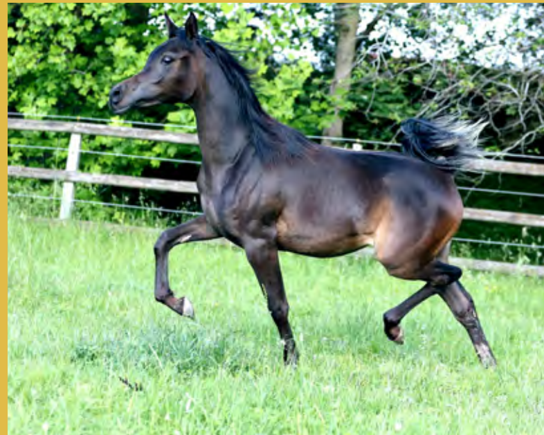
GR Nasirah black-bay mare 2022, by GR Fasin out of GR Nashidah (Classic Shadwan x Nejdschah). GR Nasirah was the first foal of our young homozygous black gold premium stallion GR Fasin! In foal to GR Layad