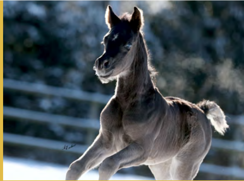
First foal 2026: GR Fadishah Black filly, GR Ishad x GR Farasha (full-sister to GR Fasin)

GR Nashidah (Classic Shadwan x Nejdschah) mother of our homebred stallions GR Nashad (gold premium stallion; father of GR Ishad) and GR Lahab. Black-bay filly GR Nasinah 2023 (by GR Fasin) beside