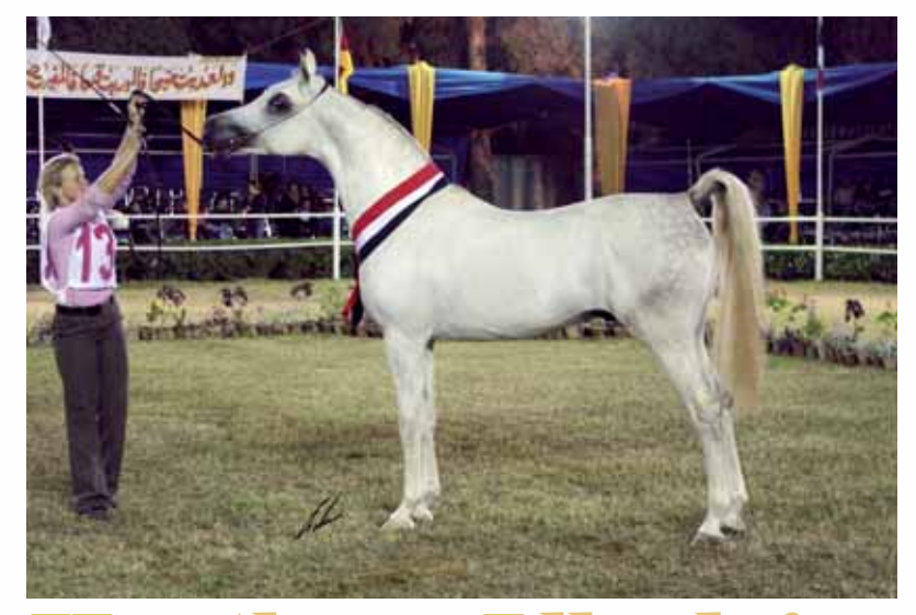
Haytham Albadeia Reserve Colt