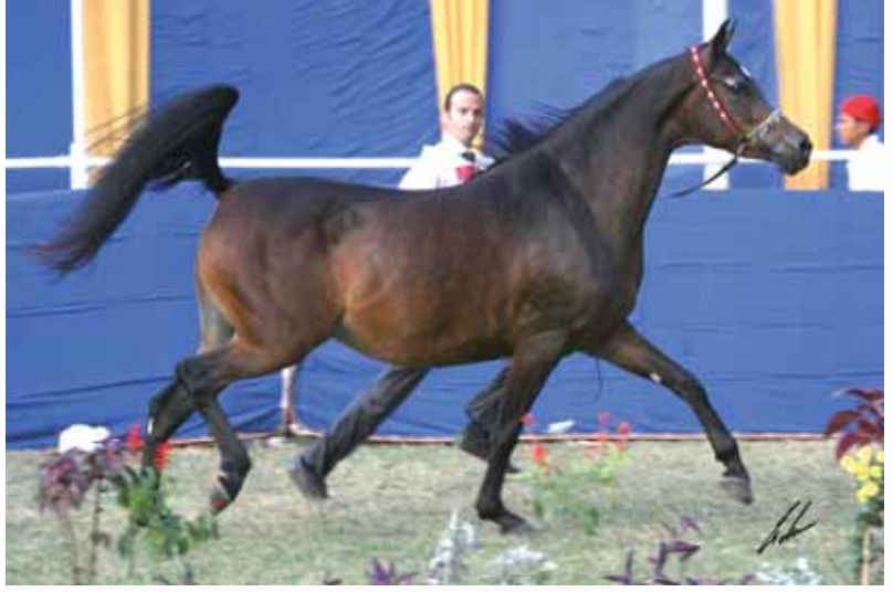
Ghazalah El Gabry Reserve Mare