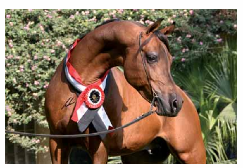
Borhan Saqr Reserve Stallion

The last class of the day had some truly lovely older mares all born prior to 30/9/1998. The three top placements were all within 1/3 point of each other. The winner of the class was the beautiful Dalloua, an El Zahraa bred mare now