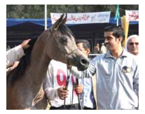
Romh Al Masaeed 1° Pl. Foals born 2005

The second colt class for those born 1/10/2004 - 30/9/2005 was the largest of the day with nineteen lively participants. The winner was Noor El Din Al Yasser (Gamil Saqr x Ahlam Al Fadaly) He is owned and bred by Al Yasser Stud, one of the younger farms to enter the competition and with some good results. Montaser Granata (Gamal Saqr x