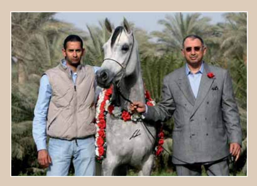
MAHALA CHAMPION MARE

which is under ECAHO affiliation unlike the EAO show held in November that was non-affiliated. This has been the case for a number of years and seems to be the status quo for the situation here.