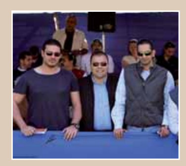
Left: Prince Saud, Tarek, Salem Bin Laden