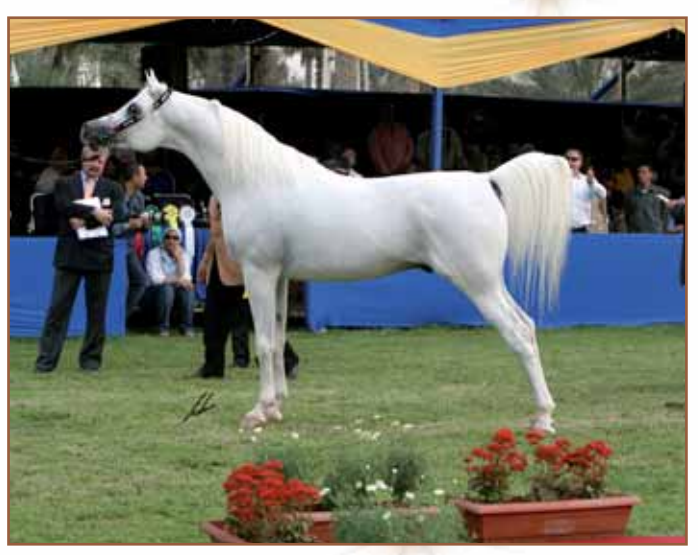
HAMRA ALIGANCE RES. CHAMPION STALLION