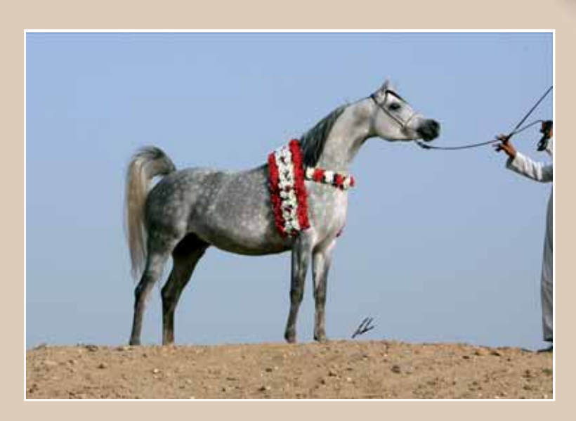
MAHALA MOST CLASSIC HEAD