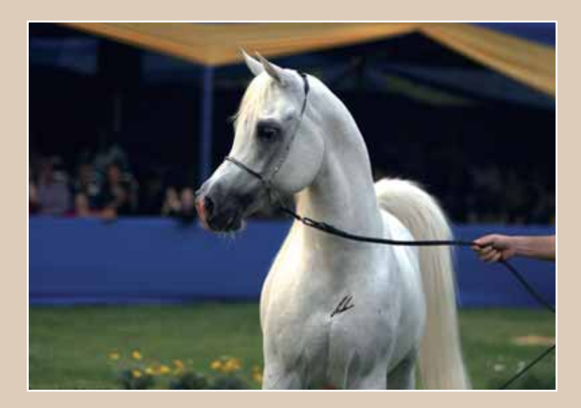
SHEIKH MAHBOUB MOST CLASSIC HEAD

duced winners internationally. She is owned and bred by Al Kaherah Stud.