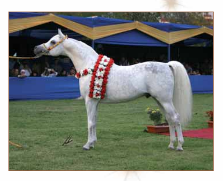
AUTHENTIC SHAMANI CHAMPION STALLION