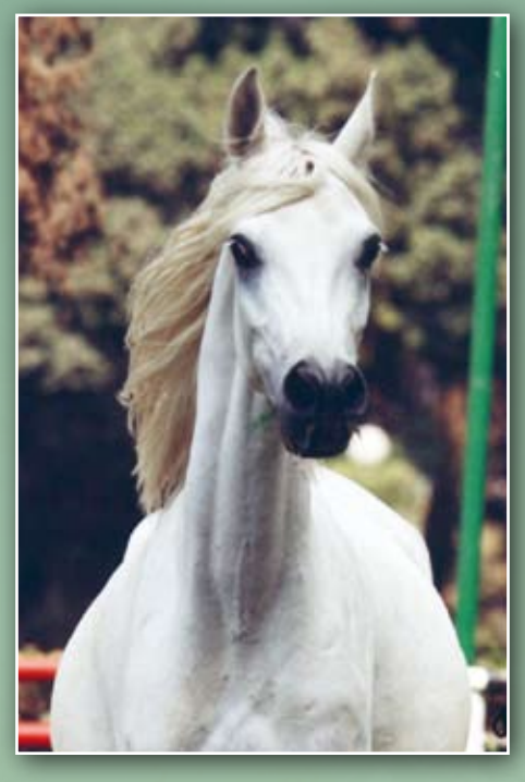
Tee (Adl x Bint Ibtisam) - mare

I have been bringing outside horses because a lot of what I want is no longer at El Zahraa. The bloodlines are there but not the individual horses. For a number of years, the breeding there was done with no knowledge of past history of the different lines, pedigrees or good conformation. They kept making the same mistakes because of either bad decisions or no decisions.