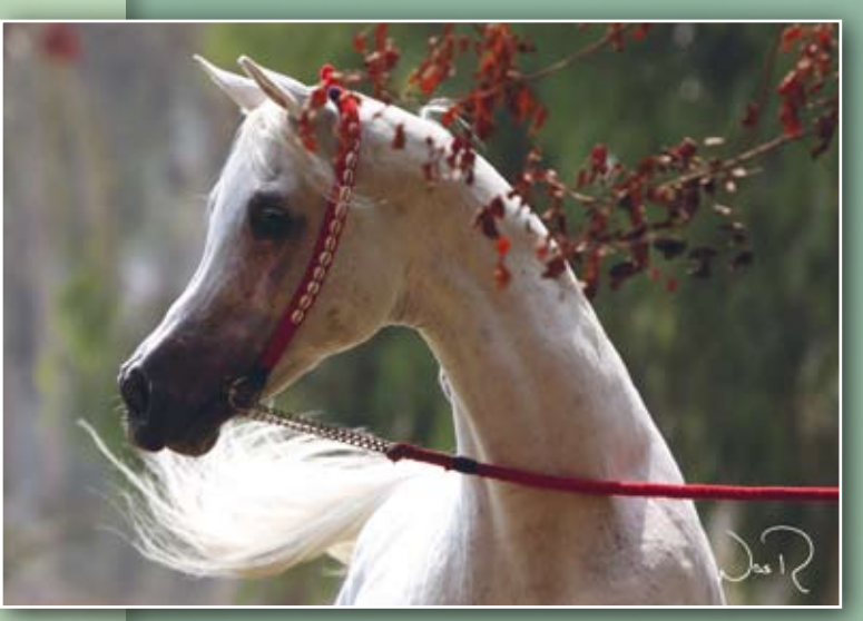
Rawwah (Rashdan x Ramiah) - stallion

have already approved of AI here in Egypt, but we lack the proper facilities for doing this at El Zahraa. I am trying to raise funding that can help with this and in the meantime we are collecting semen from the leading stallions so we will be prepared when we are correctly equipped.