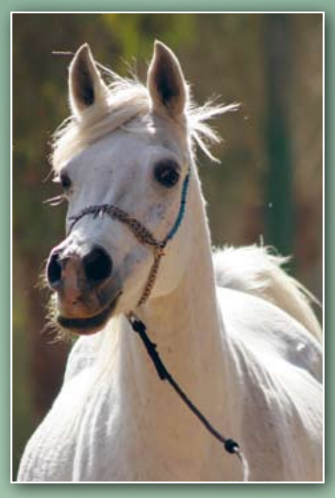
Adalat (Ameer x Adaweya) - mare

The weaknesses that come from what we have lost are obvious. Fortunately, Egyptian breeders have been able to bring back most of what was missing but we need to know whether the EAO is ready to cooperate to help in returning the rest of what was lost. There needs to be an exchange of strengths between the EAO and the local breeders so that the "Roots" of the Egyptian horse continues on his land. We also need to be aware that we need to preserve this "Virgin" or untouched horse because one day there will be a demand for them and they must be available in their own land. These horses must be kept away from shows and far from