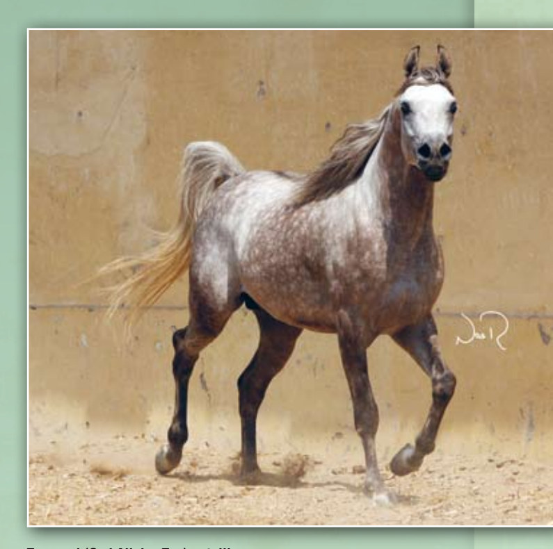
Tagweed (Gad Allah x Tee) - stallion

AH: We hold these auctions in order to sell those horses for whom we have duplications or else those for whom we have close replacements. This last auction was extremely