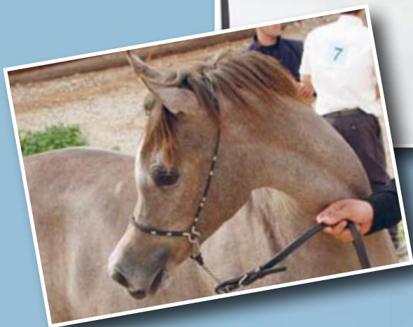
Nashwah AA Filly Foal Champion