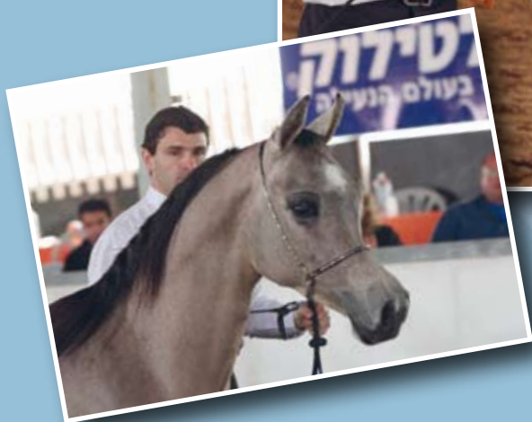
Al Ayal A Colt Foal Champion