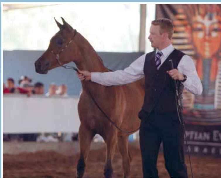
El Amir Ibn Mawardi Res. Colt Foal Champion