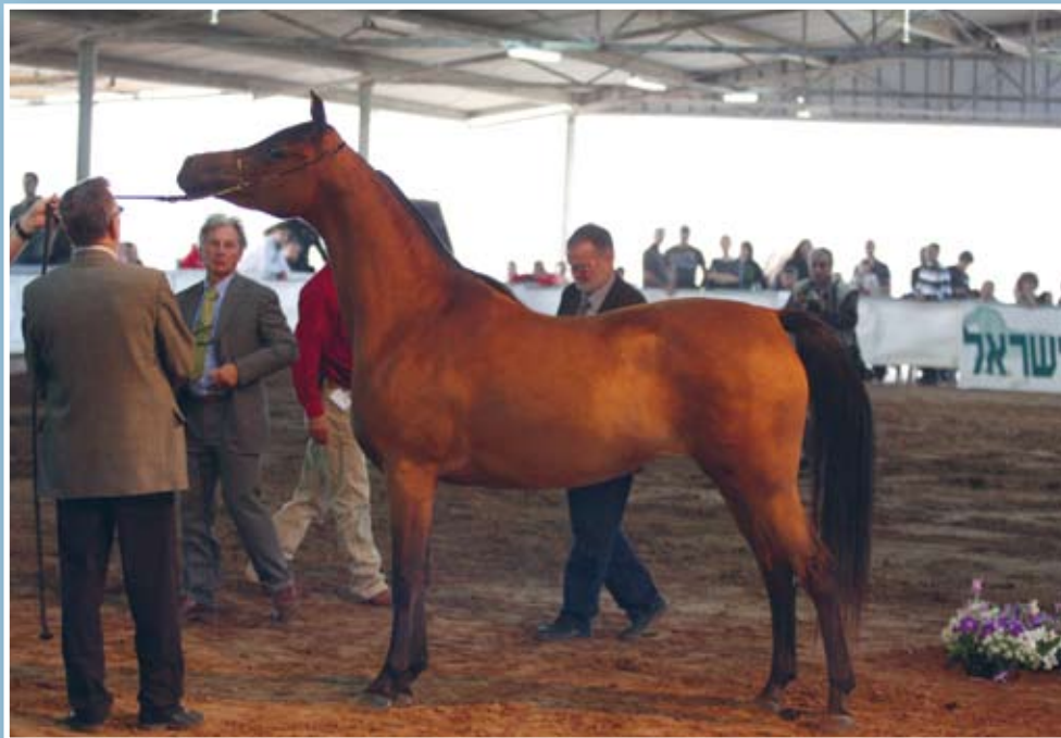
J.P.J. Talai Res. Champion Mare