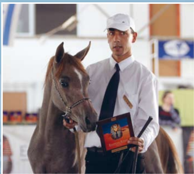
Dalaa Al Fawaz Res. Filly Foal Champion