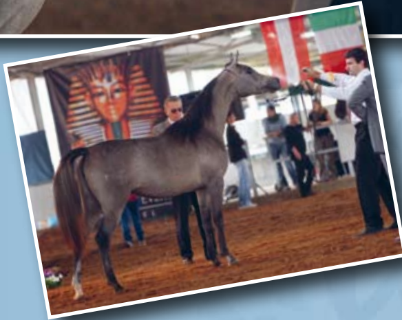
Ayat AA Champion Filly