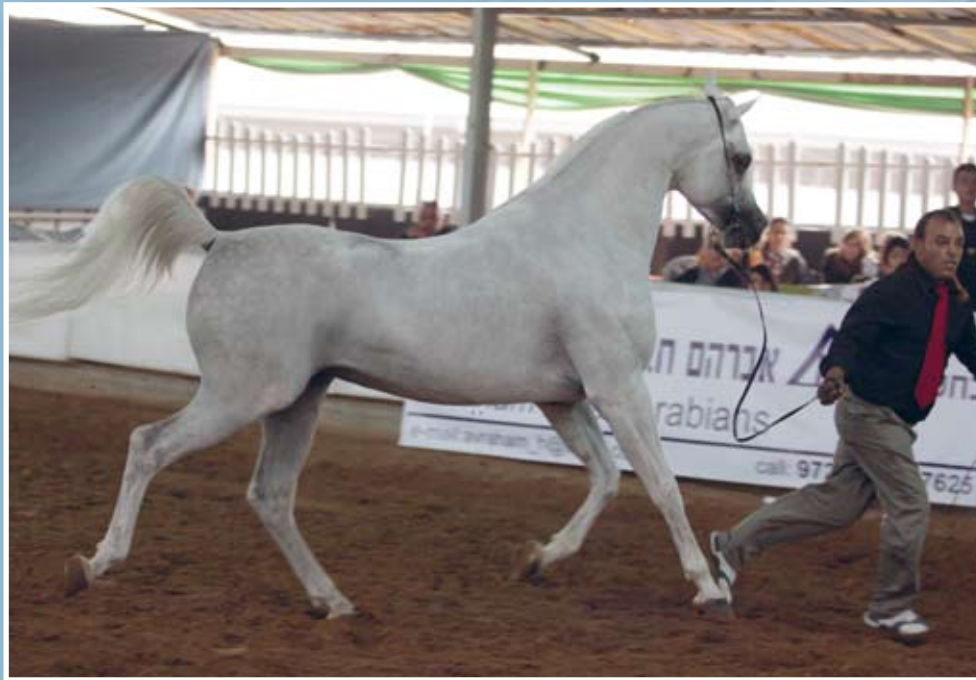
M.H. Bagder Res. Champion Stallion