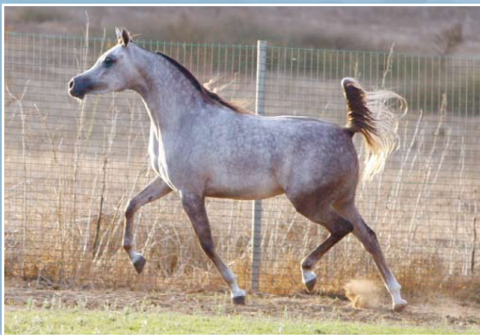
Shaj Diva Res. Champion Filly