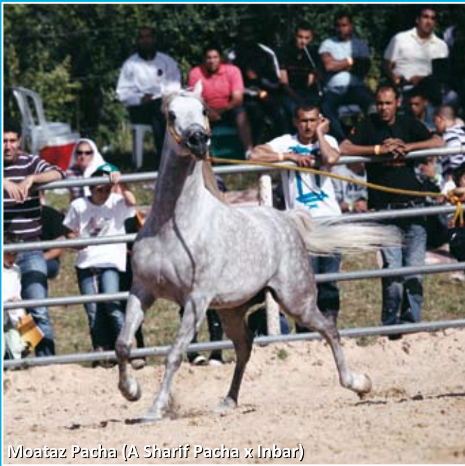
Moataz Pacha (A Sharif Pacha x Inbar)