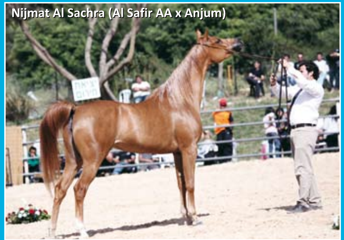
Nijmat Al Sachra (Al Safir AA x Anjum)