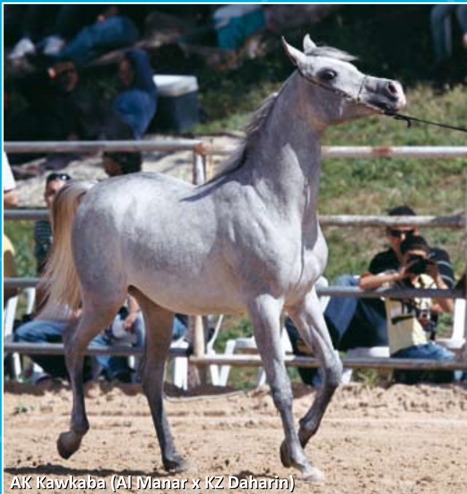
AK Kawkaba (Al Manar x KZ Daharin)