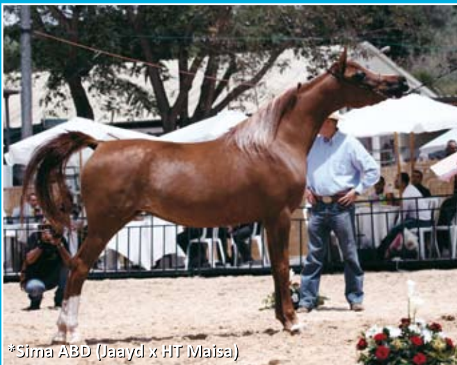
*Sima ABD (Jaayd x HT Maisa)