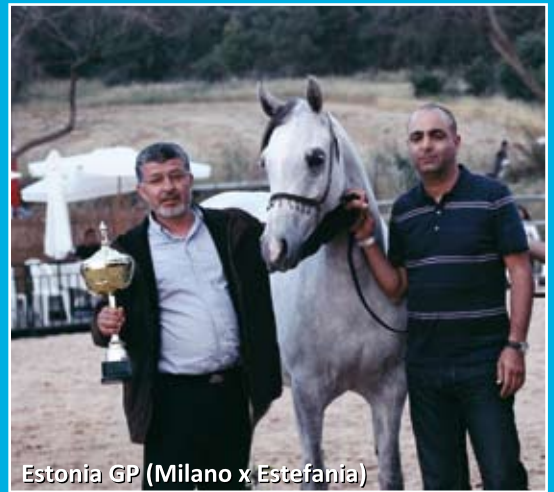
Estonia GP (Milano x Estefanía)