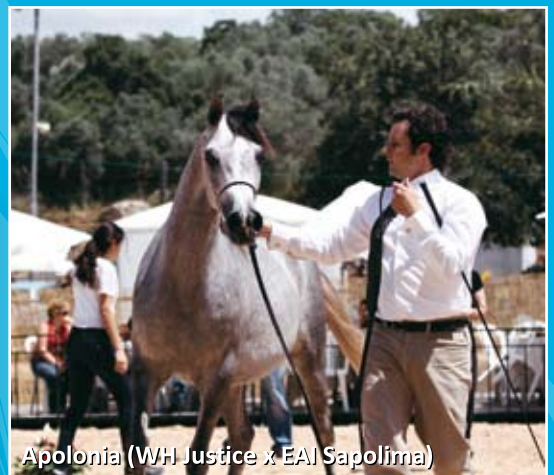
Apolonia (WH Justice x EAI Sapolima)