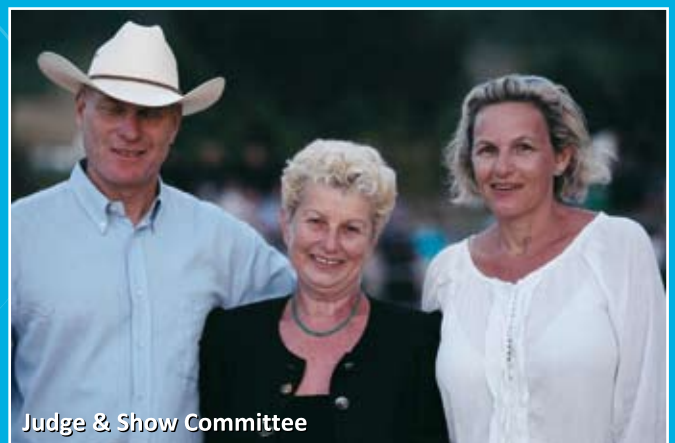
Judge & Show Committee