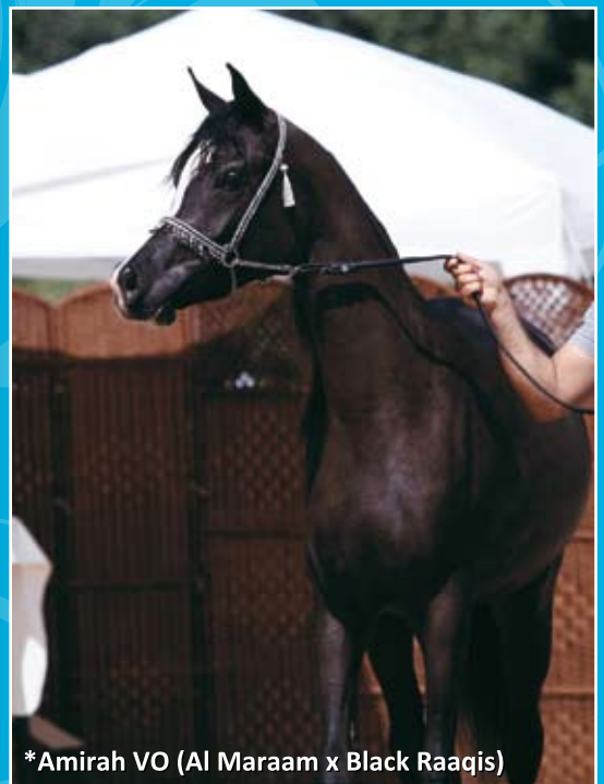
*Amirah VO (Al Maraam x Black Raaqis)

The striking liver chestnut CA Farwaz (Al Maraam x W Faiza) scored 92 points and dominated the ring to win the Seven-Year Old and Older Stallion class and the Gold Medal stallion title with 92 points. The very masculine Jo'ad (KZ Alone x Atiq Donia) scored 19s for type and movement to take Second Place with a nice score of 90 points, tying with the classic Ben Kordelas (Kordelas x Czeresnia) who stood Third.