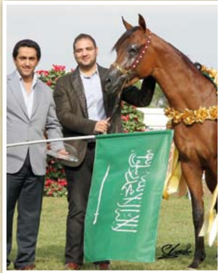
Hayab Al Nayfat RAHEB AL RAYYAN X MUHIBA EL NAARAH B&O: AL NAYFAT STUD