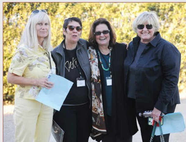
Opposite page: photos from Friday afternoon's horse presentation at Silver Maple Farm