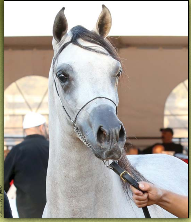
GOLD MEDAL COLT - INFINITY KA