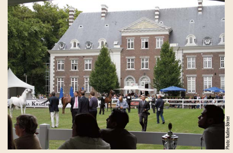
The Egyptian Event Europe at the showground in Lanaken, Belgium: www.egyptian-event-europe

Egyptian breeding, putting more emphasis on type. This standard hardly takes into account functionality, a horse's character, and the quality of life for horses, as selection criteria.