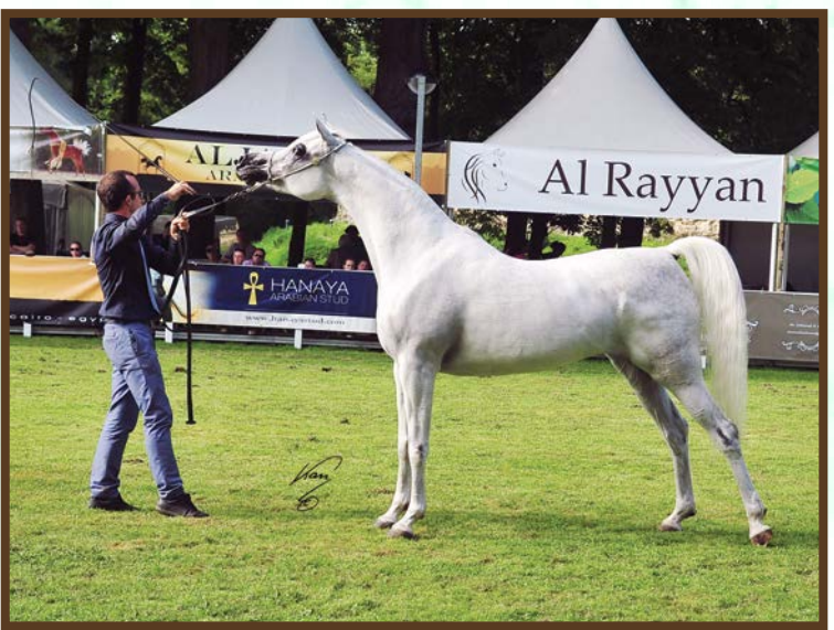
Bronze Medal Champion Senior Mares LUJYAN AA NADER AL JAMAL | LAMIS AA - B: ARIELA ARABIANS - O: RB ARABIAN STUD

Silver Medal Champion Senior Mares DARINE AL RAYYAN ASHHAL AL RAYYAN | AISHA - B&O: AL RAYYAN