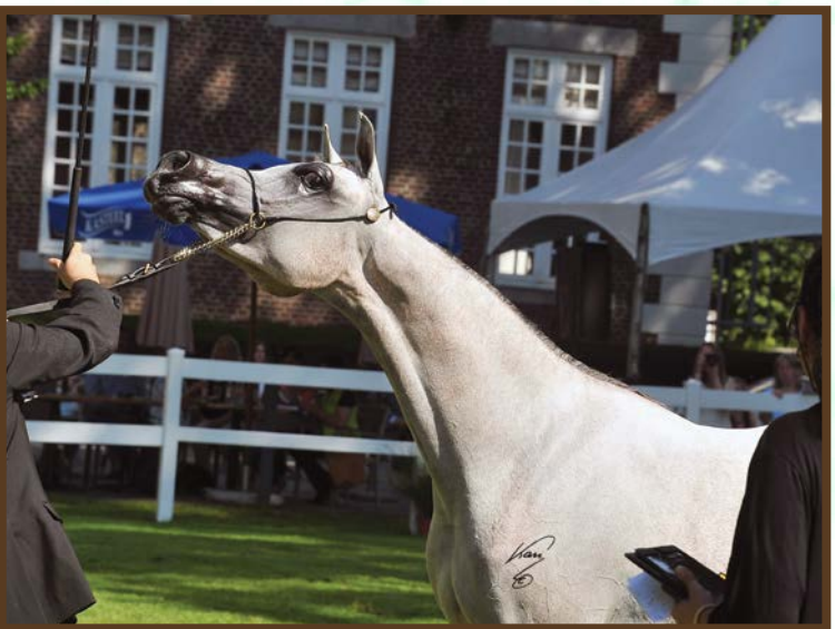
Bronze Medal Champion Yearling Fillies RAYA AL RAYYAN ANSATA SOKAR | NADRAH AL RAYYAN - B&O: AL RAYYAN

Silver Medal Champion Yearling Fillies HANAYA FARFOURA KENZ AL BAYDAA | BINT FARIHA MAGIDAA - B&O: HANAYA STUD