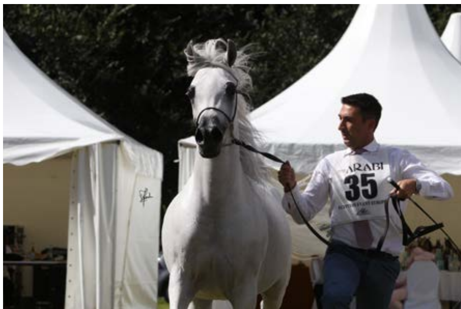
FEMALE HIKAYET HOB AA AL AYAL AA | HAMDIYAH AA B: ARIELA ARABIANS - O: ABHAA ARABIANS