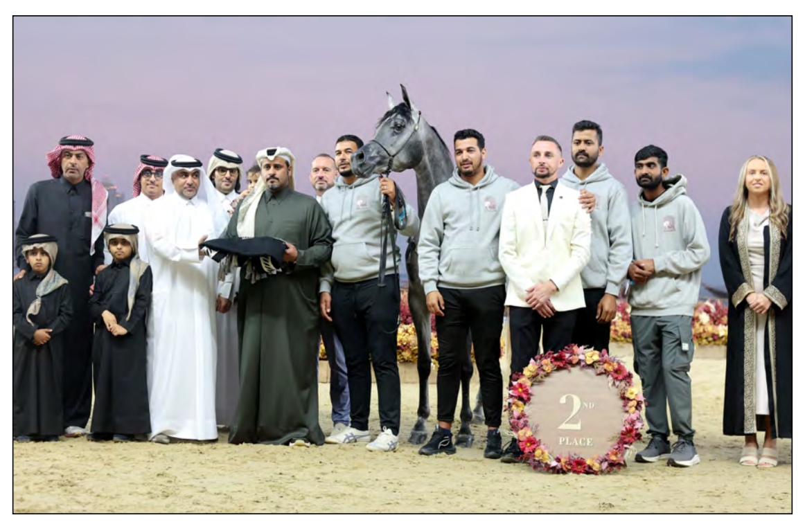
Silver Medal Junior Fillies GHAYA EL ALYA

QAMAR EL ZAMAN AL WAAB X GHEZLAN AL WAAB | B: EL ALYA STUD | O: AL HAMAMA STUD