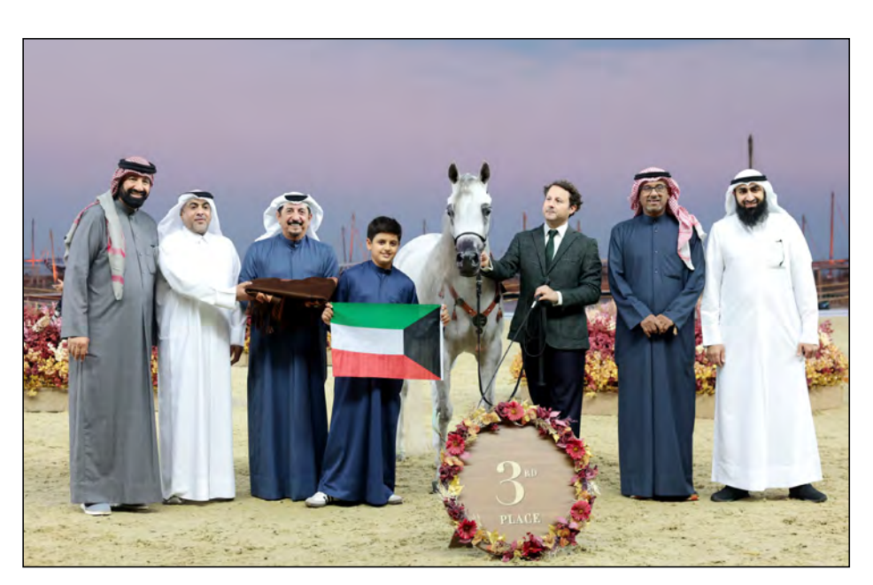
Bronze Medal Junior Fillies LATEEN AL DANAT

QAMAR EL ZAMAN AL WAAB X GHEZLAN AL WAAB | B: EL ALYA STUD | O: AL HAMAMA STUD