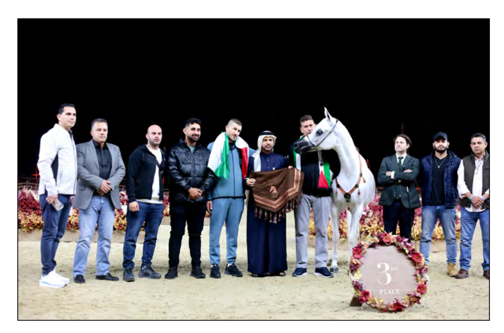
Bronze Medal Senior Mares LUJINA

ASFOOR AL WAAB X D FOLAH | B/O: DUBAI ARABIAN HORSE STUD