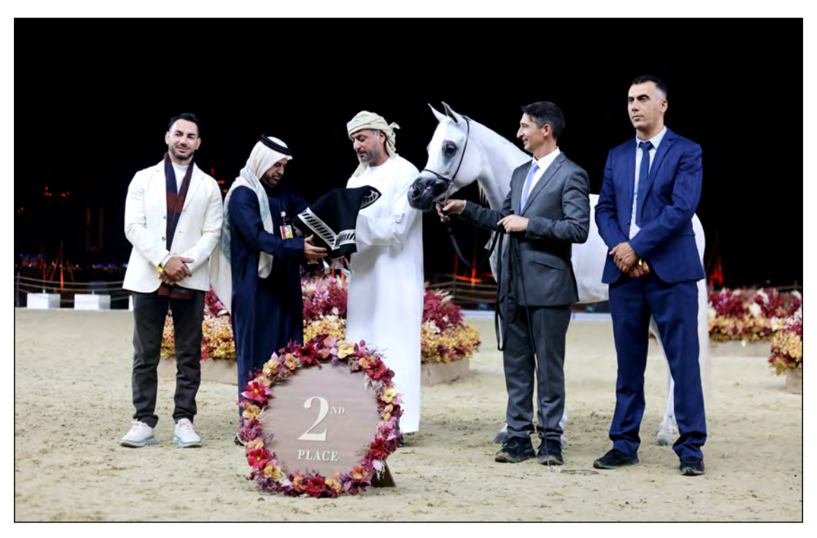
Silver Medal Senior Mares D A'NNAFEYYAH

ASFOOR AL WAAB X D FOLAH | B/O: DUBAI ARABIAN HORSE STUD