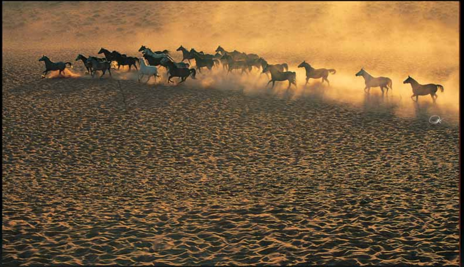
Al Janadriyah Farm