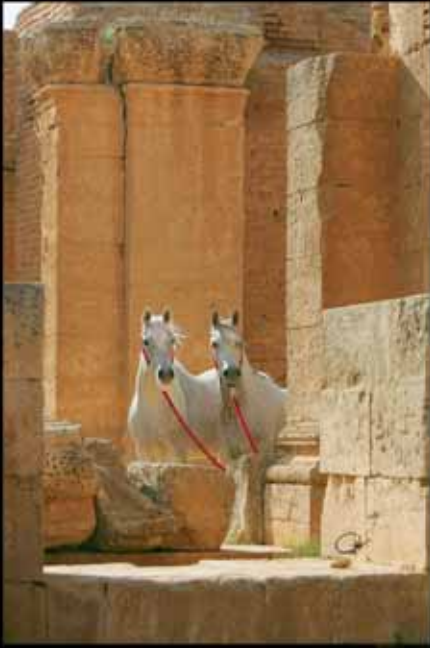
Krishana & Piccola – Royal Jaafar Stud