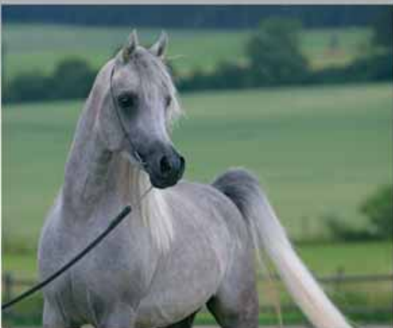
DF MalikJamil – Birkhof Stud