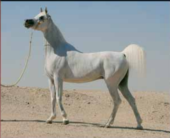
Bint Saida Al Nasser – Al Nasser Stud