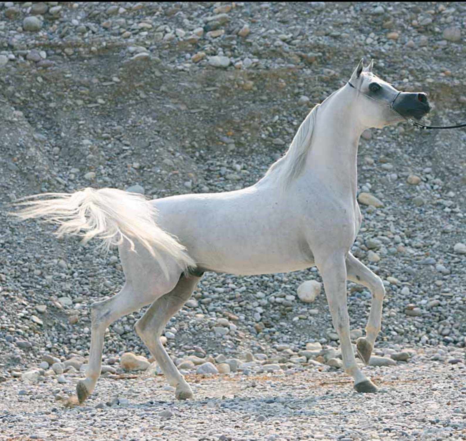
Laheeb Al Nasser - DeShazer Arabians & Alfabia Stud

For informations: www.tuttoarabi.com www.desertheritagemagazine.com www.coupdepouce.net www.arabianessence.com