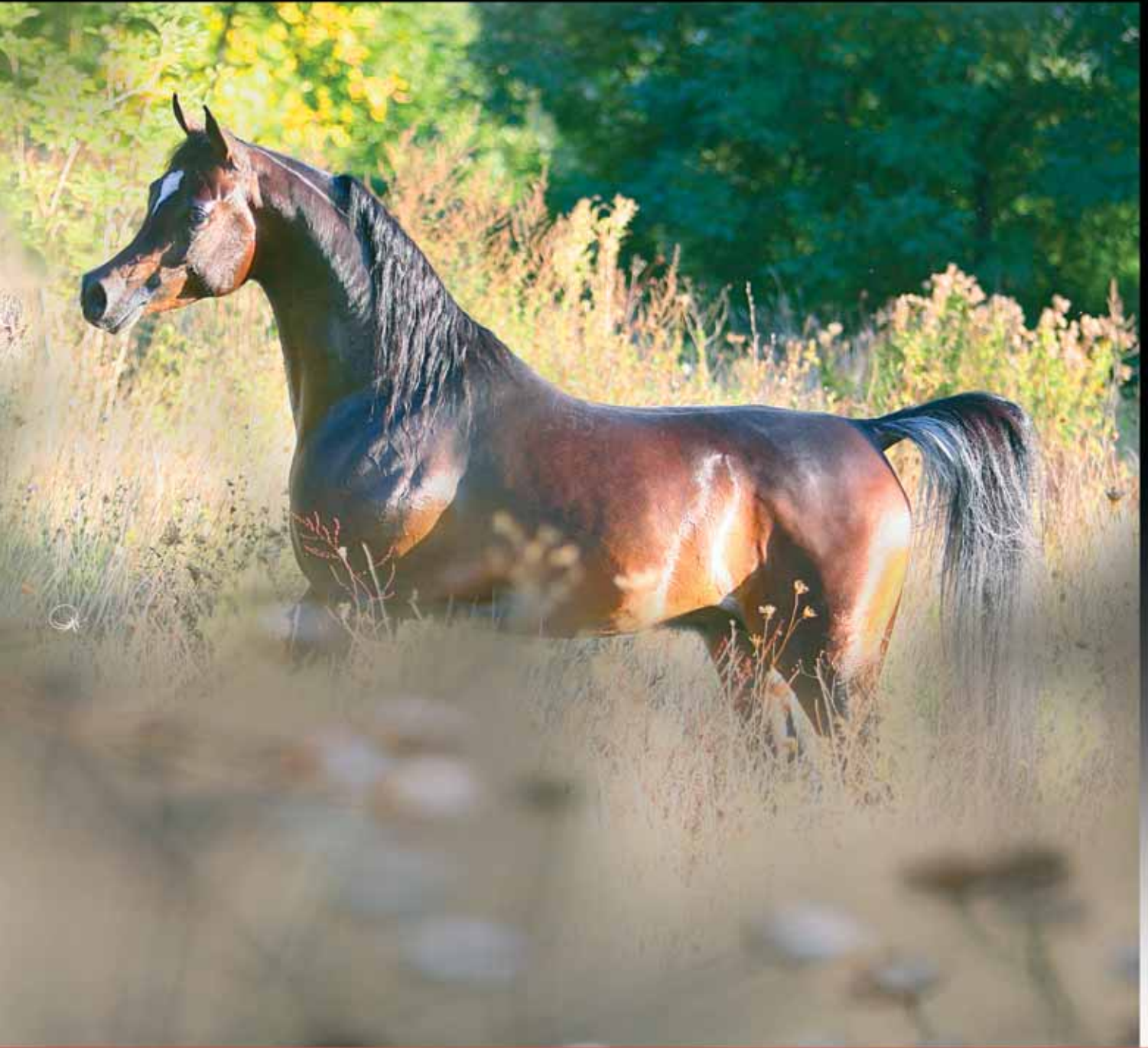
Royal Colours – Dubai Stud

organisation attends to the follow-up, education and protection in order to rehabilitate street children, boys and girls from 6 to 16 years-old through psychological follow-up and a professional education such as carpentry,