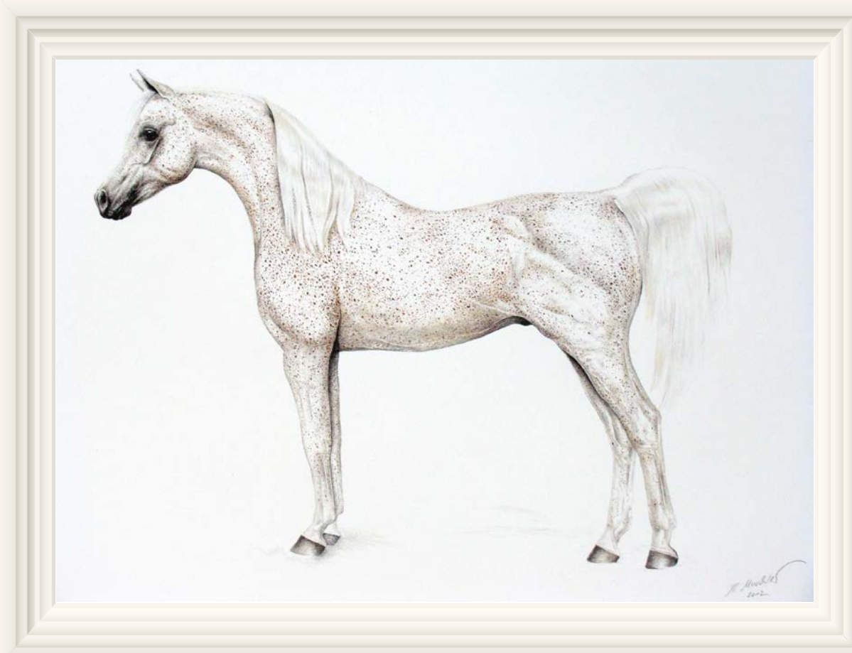
ANSATA IBN HALIMA