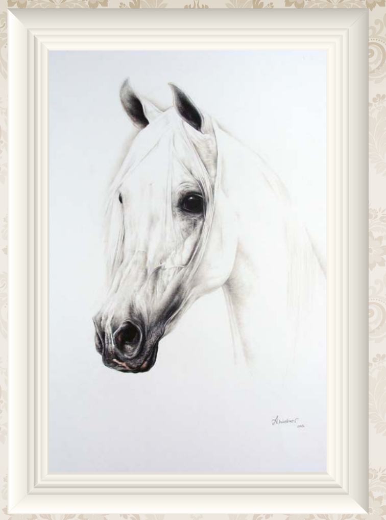
THE IMMORTAL MORAFIC