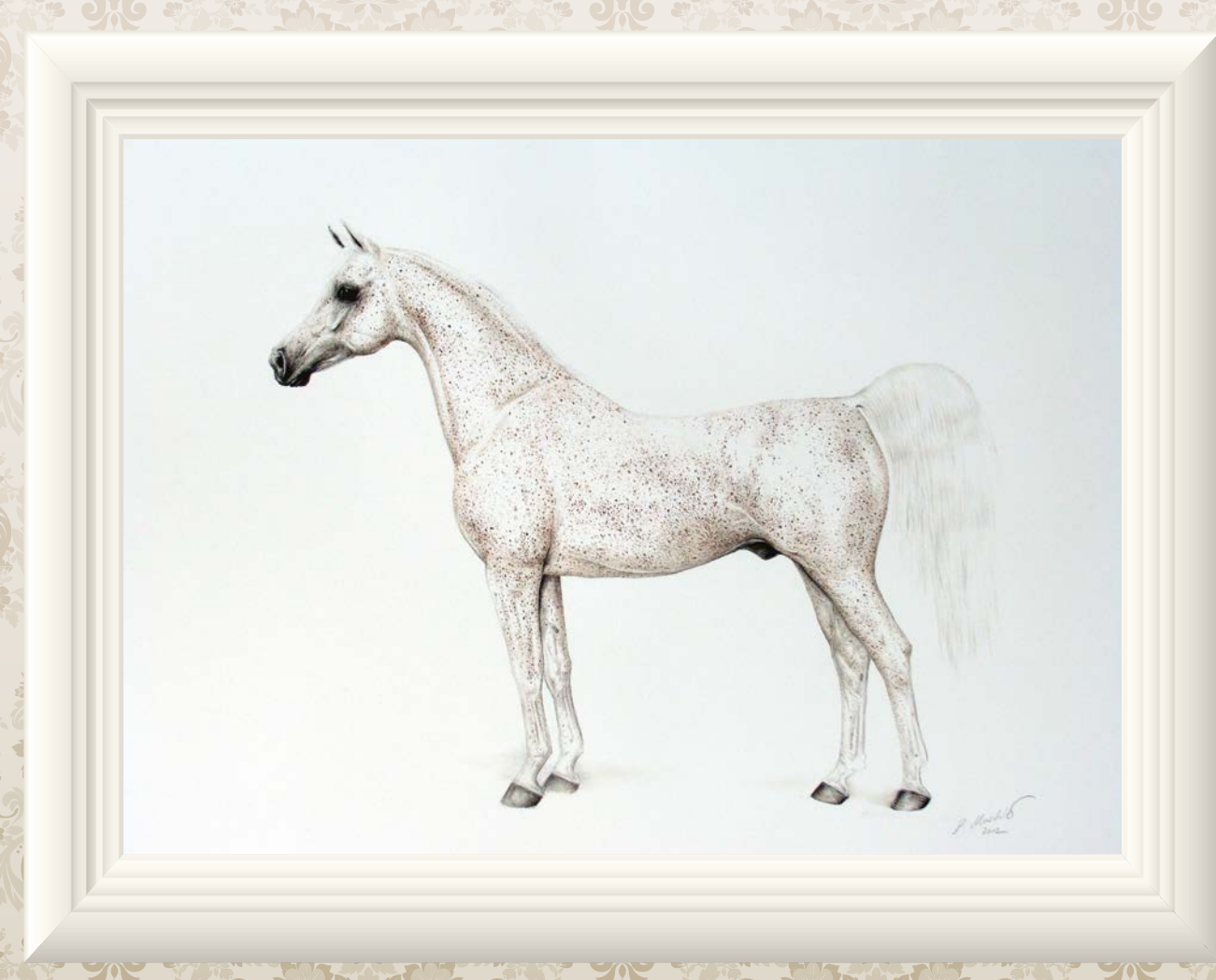
ANSATA IBN SUDAN