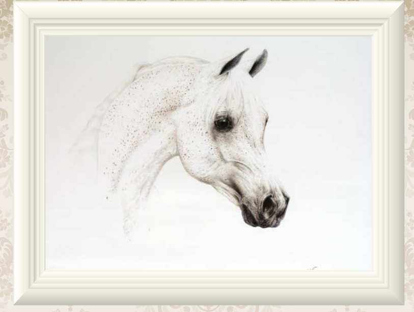
A PORTRAIT OF ANSATA IBN SUDAN