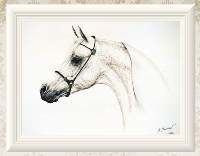
A HEAD STUDY OF ANSATA IBN HALIMA