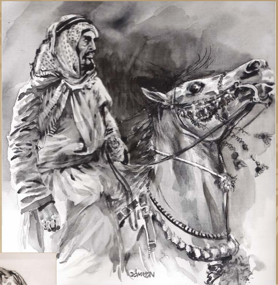
A PAINTING OF AN ARABIAN WARRIOR