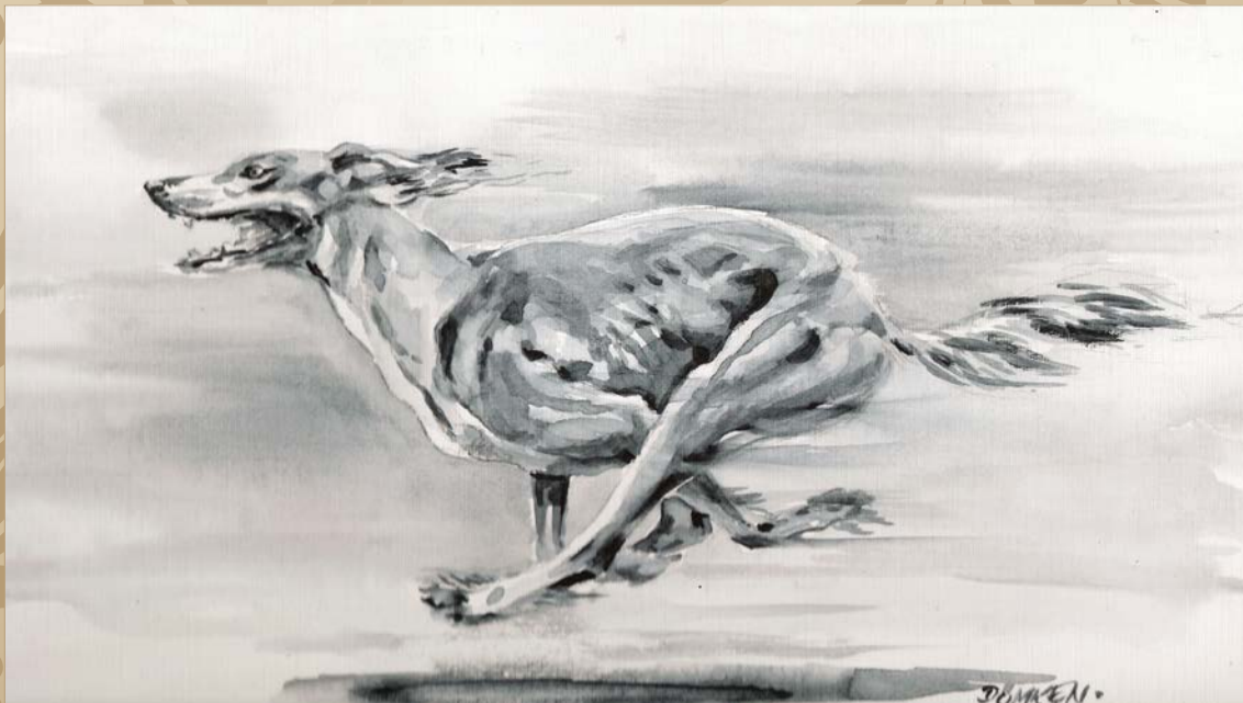
FULL OF SPEED AND DYNAMIC: PAINTING OF A SALUKI.