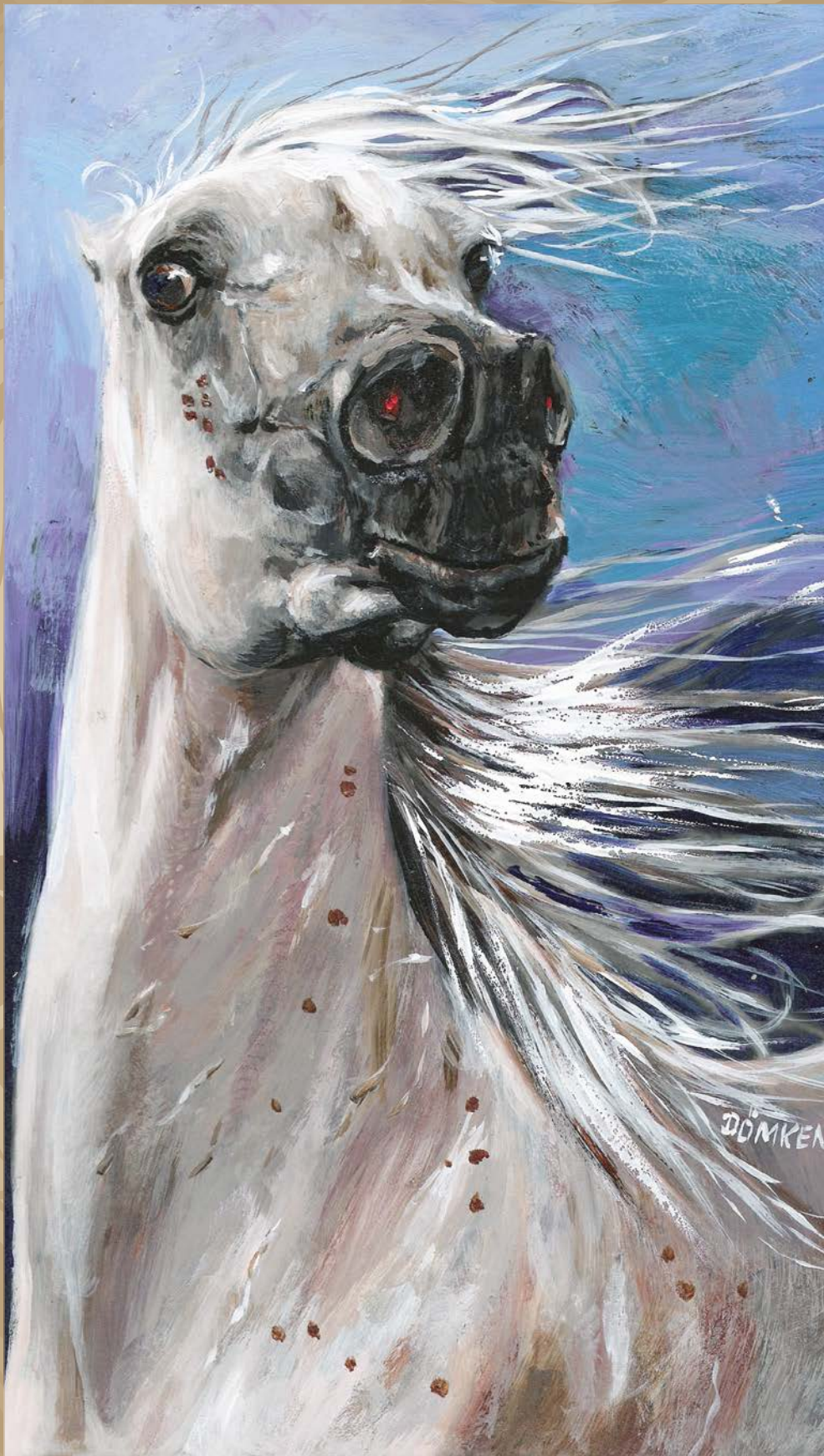
A PORTRAIT OF MAHOMED (HADBAN ENZAH I X MALIKAH BY GHAZAL)