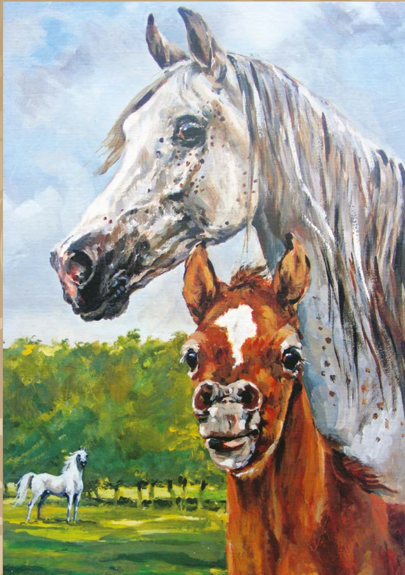
AFIFA WITH HER FILLY GHAZALAH. WHEN GHAZALAH WAS BORN, HER FATHER GHAZAL HAD ALREADY PASSED AWAY. HE IS PICTURED IN THE BACKGROUND OF THE PAINTING