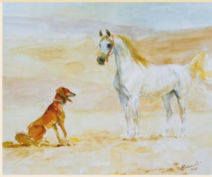
The artist's approach is verve and freedom of movement — his paintings appear to bring his subjects and models to life in a way undreamt-of.