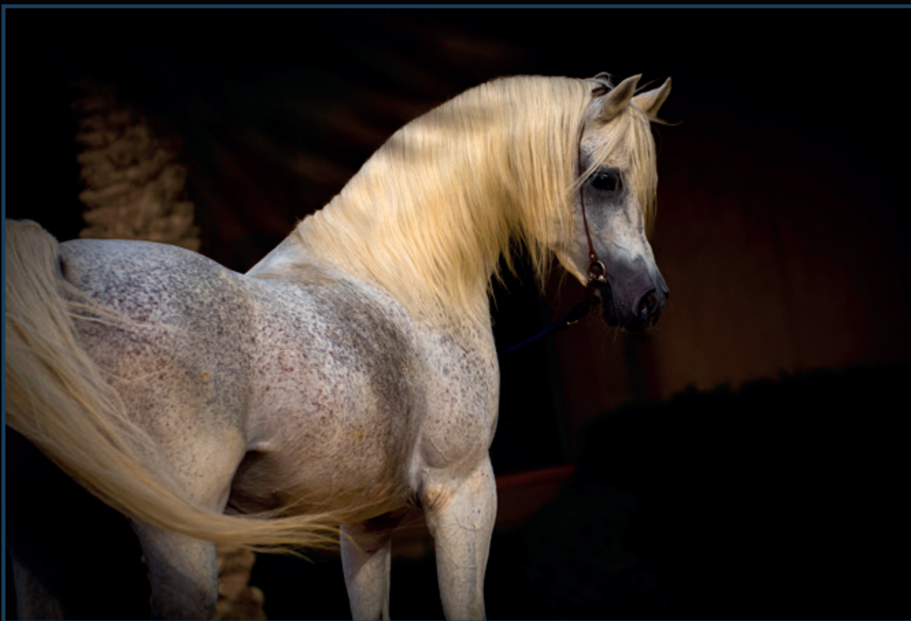
NK Qaswarah (NK Hafid Jamil x NK Nariman)