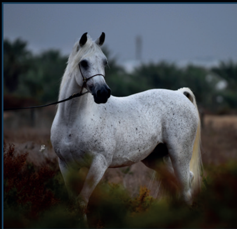
Safir Al Shakhoura (Naif Al Rayyan x Dana Al Shaqab)

Modern forms of fine art include photography, video productions, designs, etc. All of these kinds of arts meet on common grounds, which is to show the aesthetics in