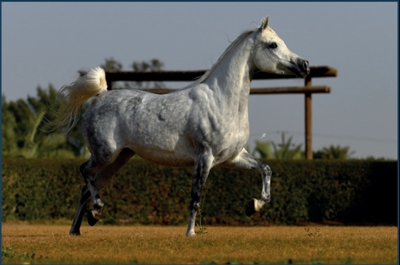
Aamrah Ezzain (NK Qaswarah x Qamar Ezzain)