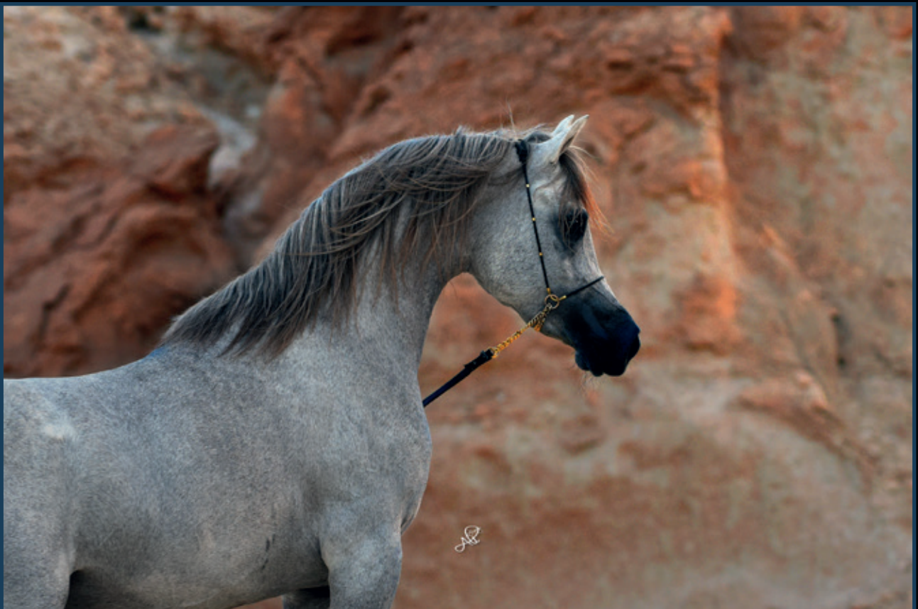
Allazzaz Ezzain (Thettwa Ezzain x Saneiah Ezzain)