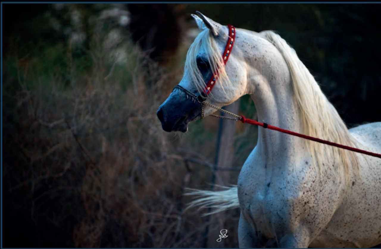
Safir Al Shakhbura (Naif Al Rayyan x Dana Al Shagab)