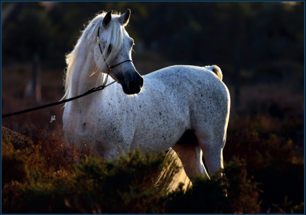
Photo presented in Sheikh Mansour bin Zayed Al Nabayan Arabian Horse Photography Contest 2019 Gallery and Book

appreciate all the tiny details presented, it's like a portrait drawing, it captures a certain moment in a single image. Moreover, as you probably noticed, even video clips mostly contain both videos and photographs in their montage. Therefore, in my opinion, videography is complementary to photography in the world of digital presentation. I would describe both of them as types of digital arts.