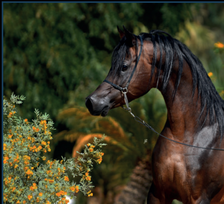
NK Nizam (NK Hafid Jamil x NK Nadirah)

AA: I don't think videography is replacing photography by any means. In my opinion, a photograph captures one (special) moment that the photographer wants to show to his audience, where he or she puts all their effort into presenting that one idea. A photograph enables us to