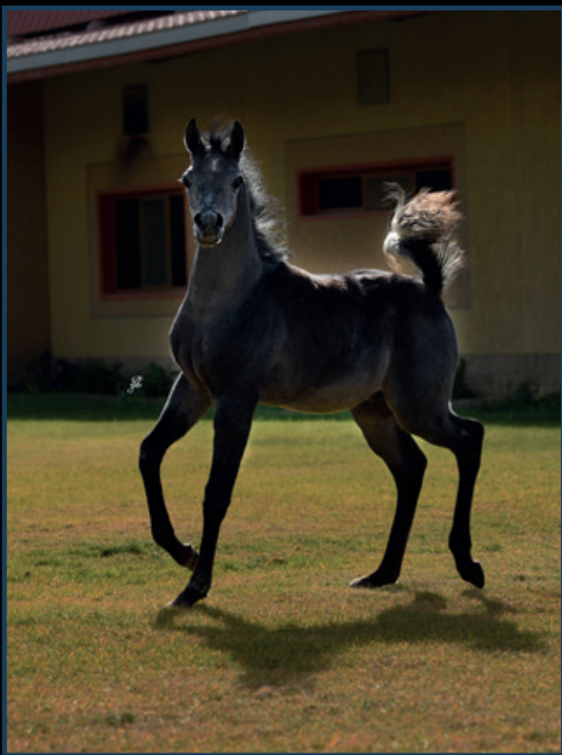
Qaswarah Ezzain (Doaabob Ezzain x Saneiah Ezzain)