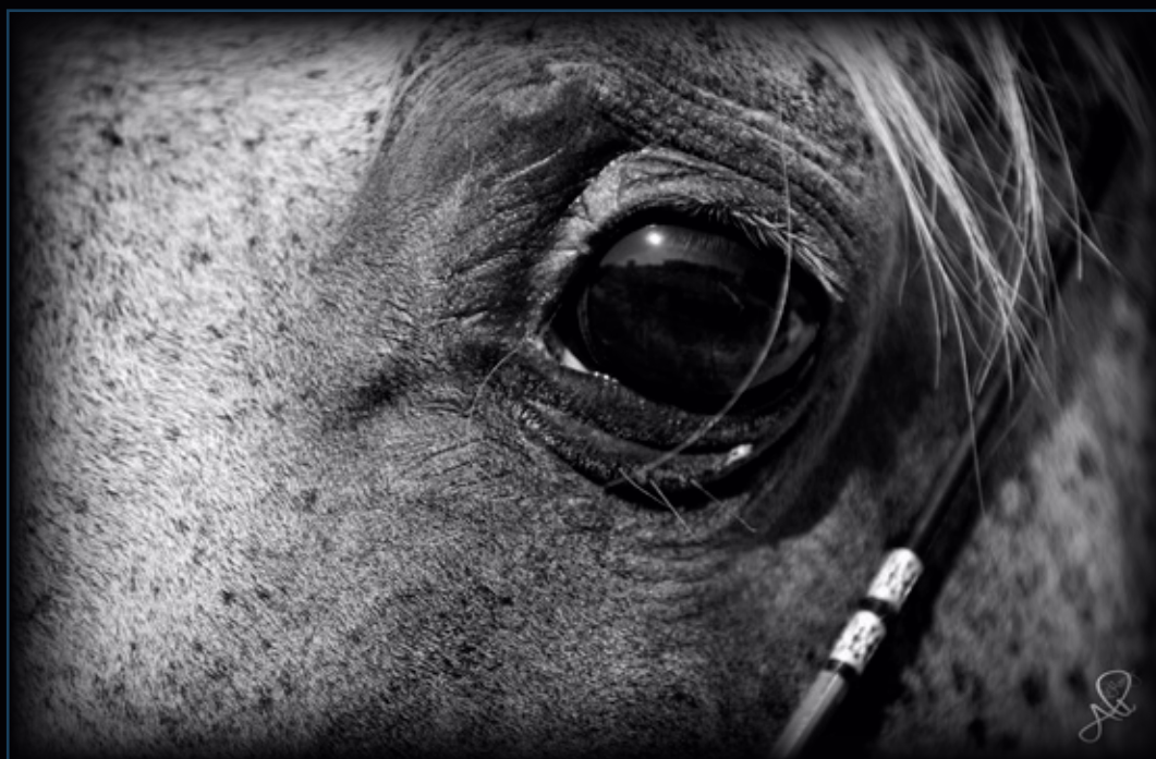
Hattim Al Nasser (Mujabid x Imperial Madanah)

of overstating adjectives in descriptive advertising texts. Pictures, however, profit from their perceived aura of being objective documents; and most breeders perceive digitalizing available information on Arabian horses, as an opportunity for growth. Intercontinental markets are based on good advertisement pictures – which often do some re-explaining of reality, however. With this backdrop in mind, it is not easy to find good photographers who will capture a real appearance of a horse's beauty, doing it without manipulative finishing processes.