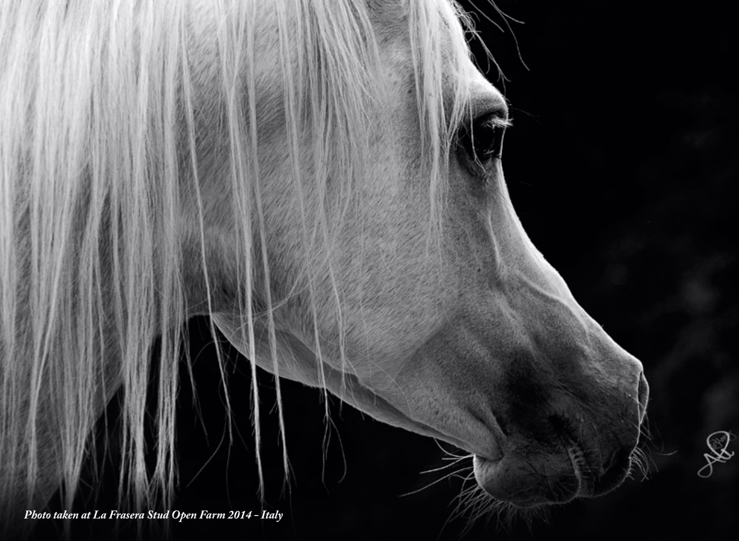
Photo taken at La Frasiera Stud Open Farm 2014 - Italy