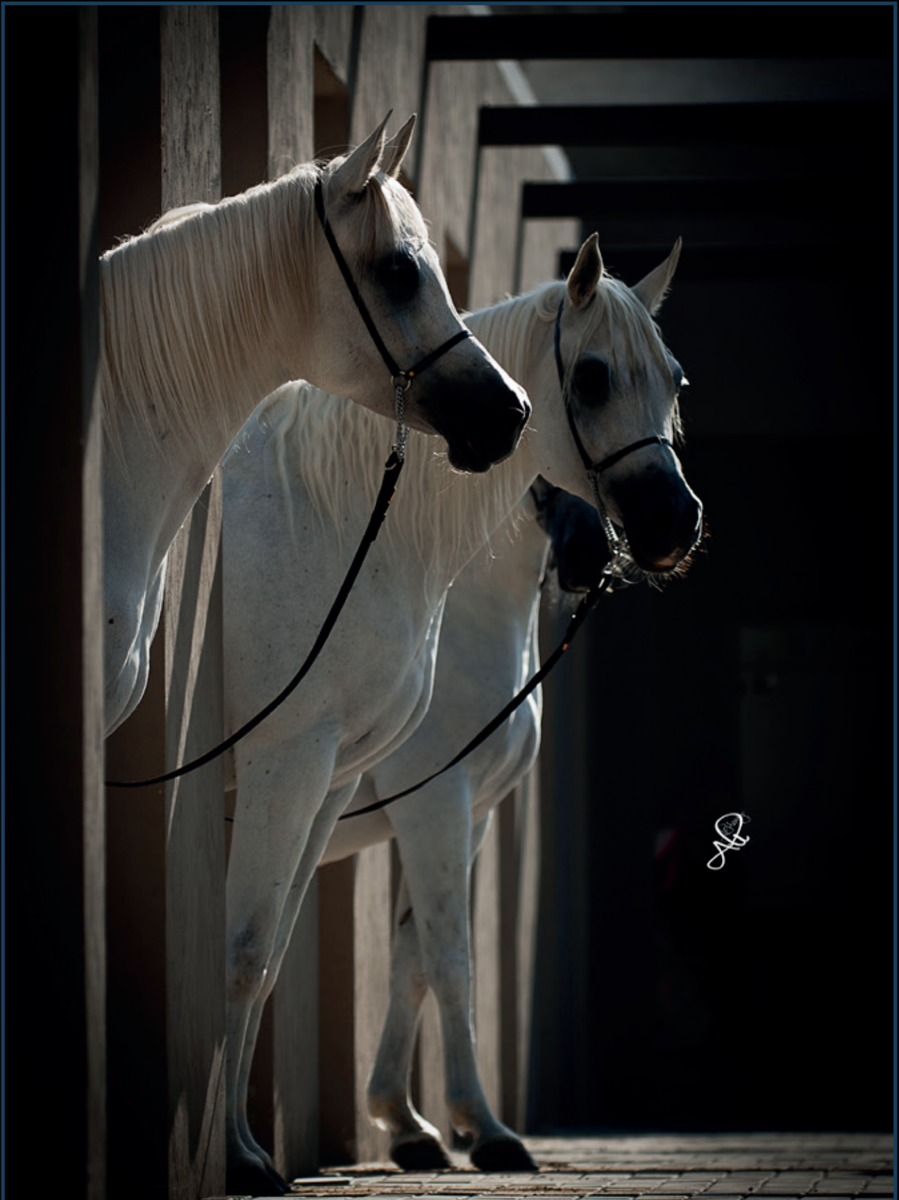
At Bait Al Arab - Kuwait