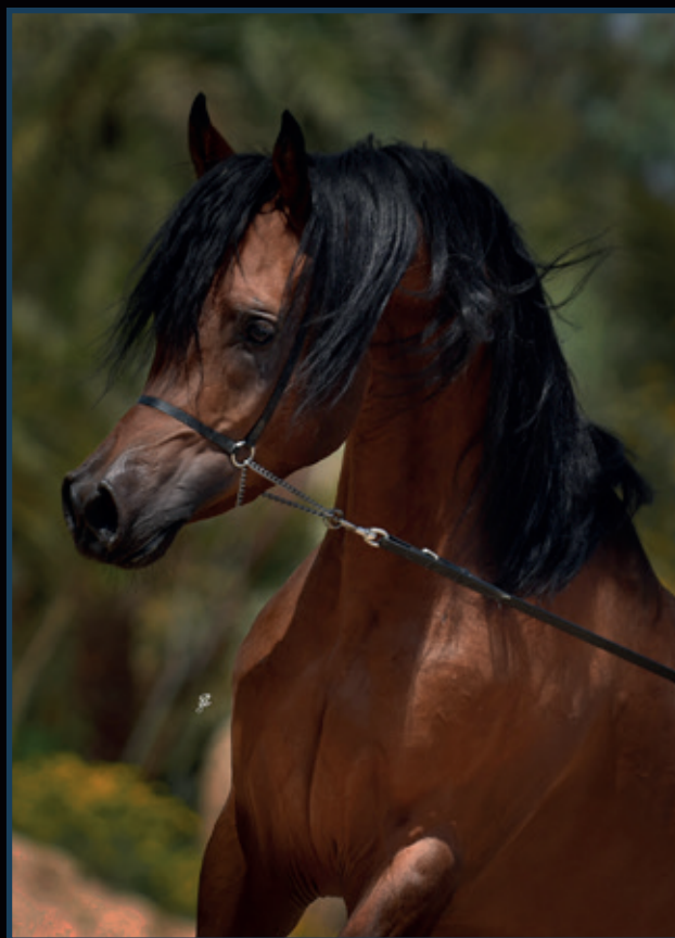
Ahmar Eladiyat (NK Nabhan x Amal El Adiyat)

AA: It is very difficult for me to answer this question. Because it is a matter of taste. Taste is not exclusive or determined by region or geographical location. It is a very