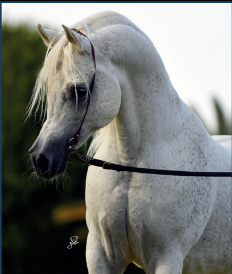
NK Qaswarah (NK Hafid Jamil x NK Nariman)