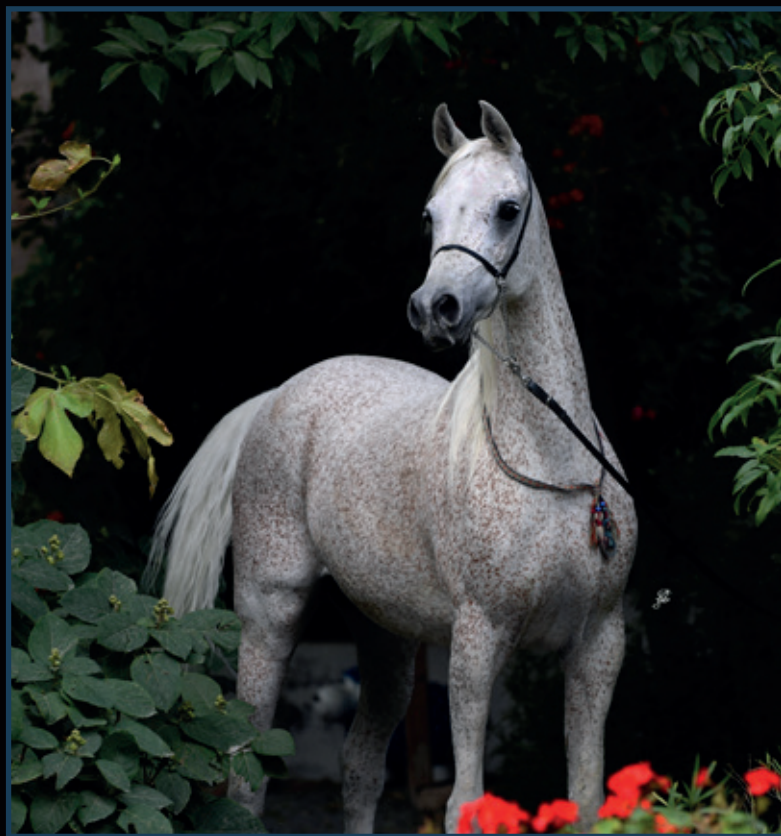
Zabia Eladiyat (NK Jamal El Dine x Zubaida El Adiyat)

Arabian horses away from any artificial atmosphere. That includes photographing privately in farms or in certain natural environments, as this not only allows the horses to be in their more natural states, but also helps me to create complete works of art.