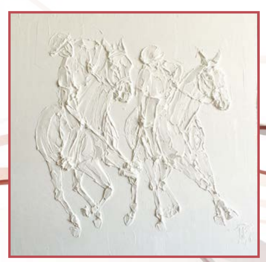
Polo 60cm x 60cm sculpted titanium white oil paint on canvas 2017