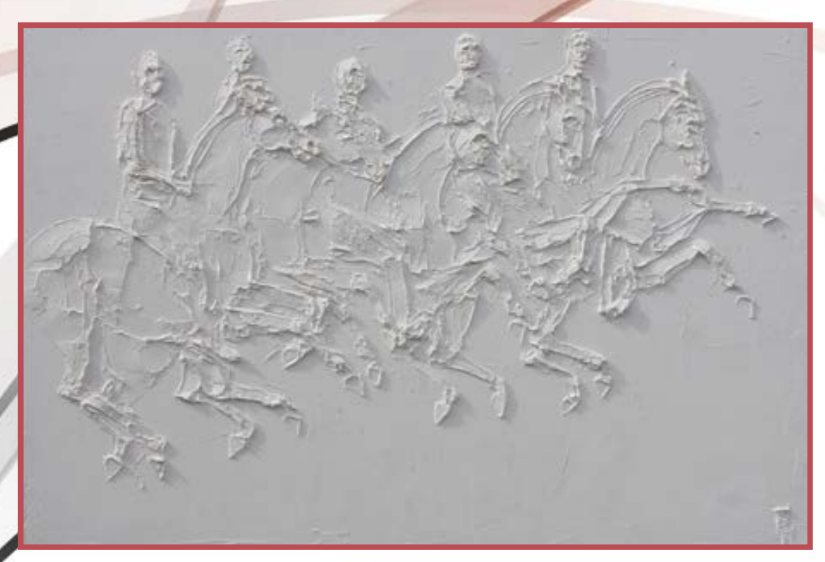
Warriors 80cm \times 100cm sculpted titanium white oil paint on canvas 2019