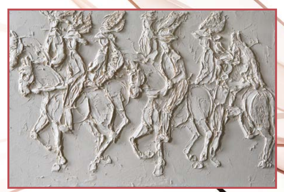
Bourgtheroulde 12in x 24in sculpted oil paint on canvas 2016