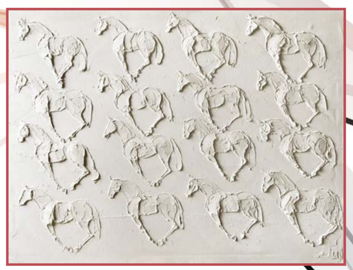
Horses at He-ART 30in x 40in sculpted titanium white oil paint on canvas 2014