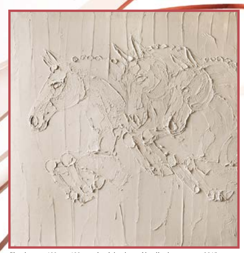
Showjumpers 100cm x 100cm sculpted titanium white oil paint on canvas 2015