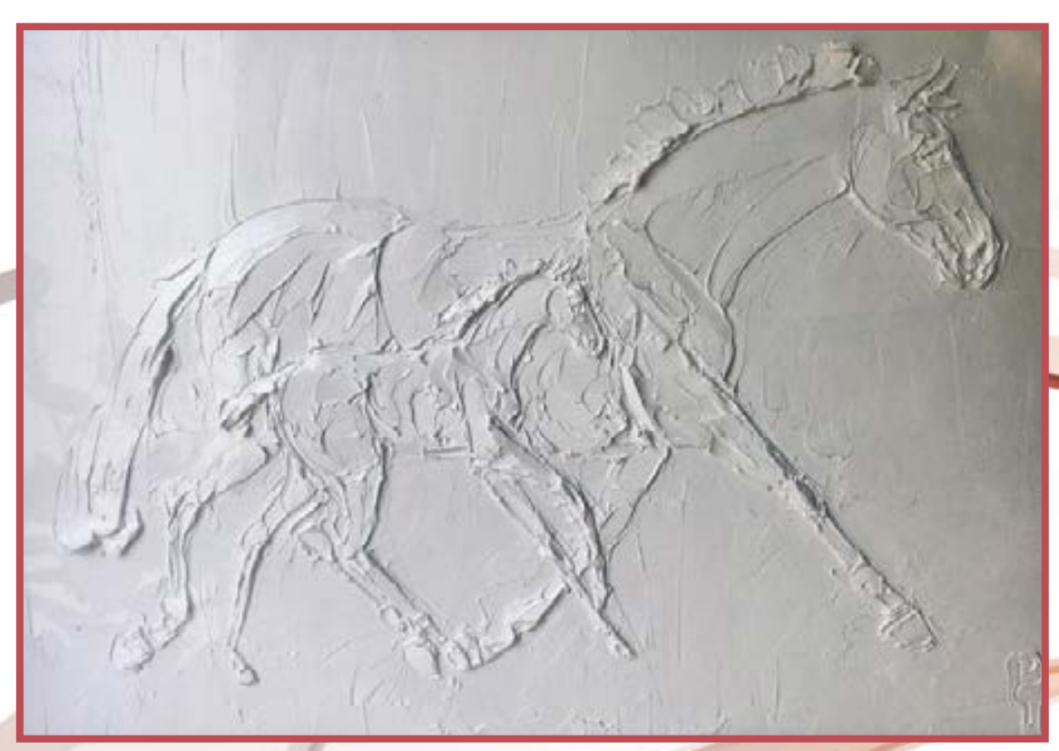
Mare and Foal 24in x 36in Sculpted titanium white oil paint on canvas 2022