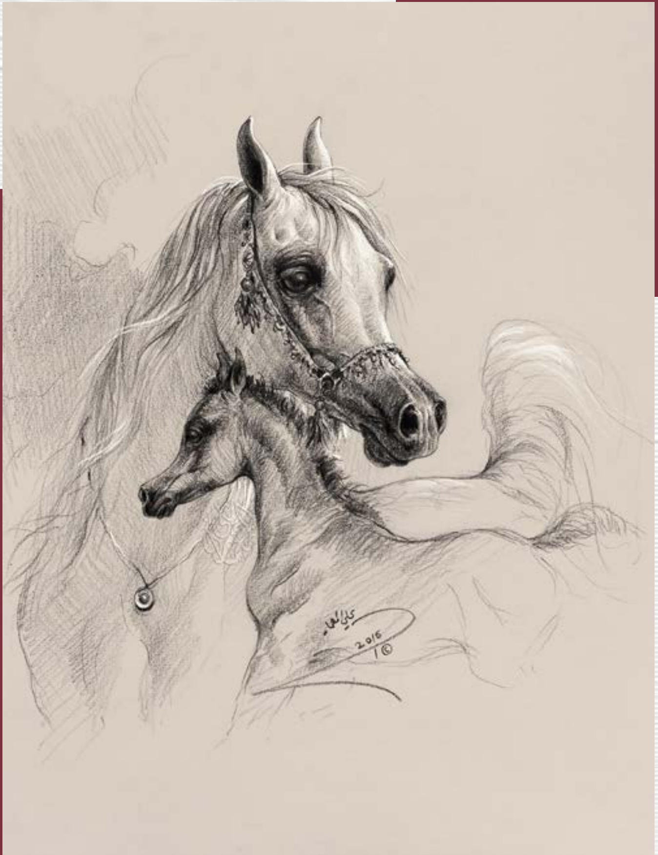
First True Love