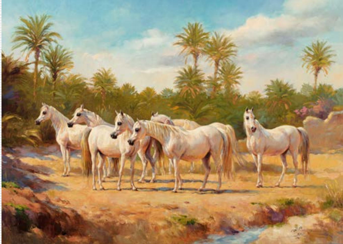
A Tale from Albadeia