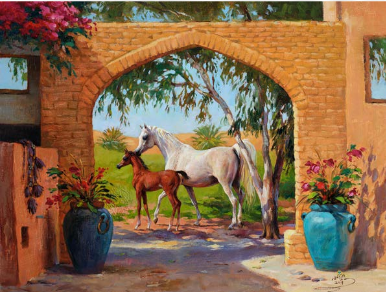
A Tale from Alzobair