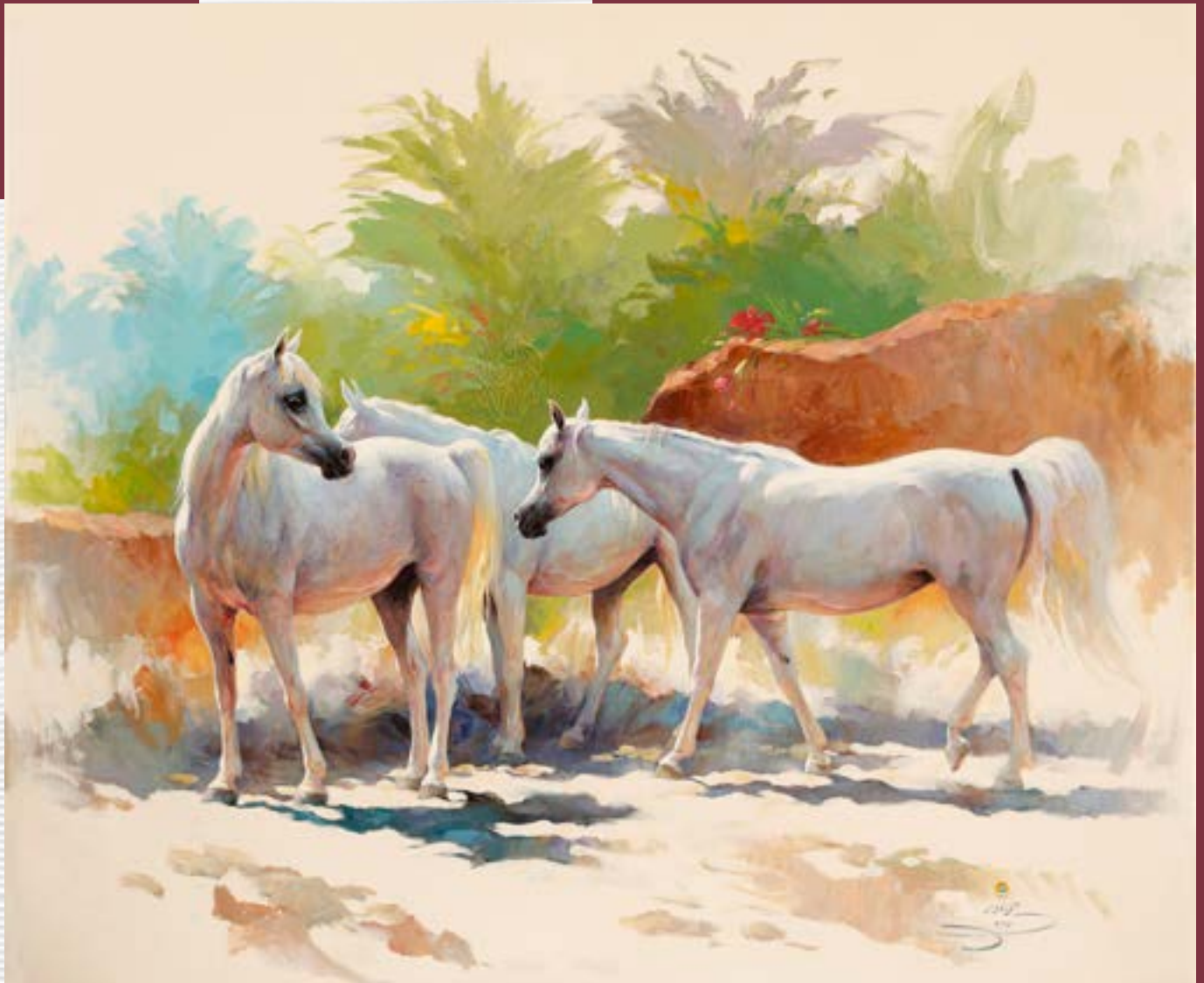
Journey with the sun