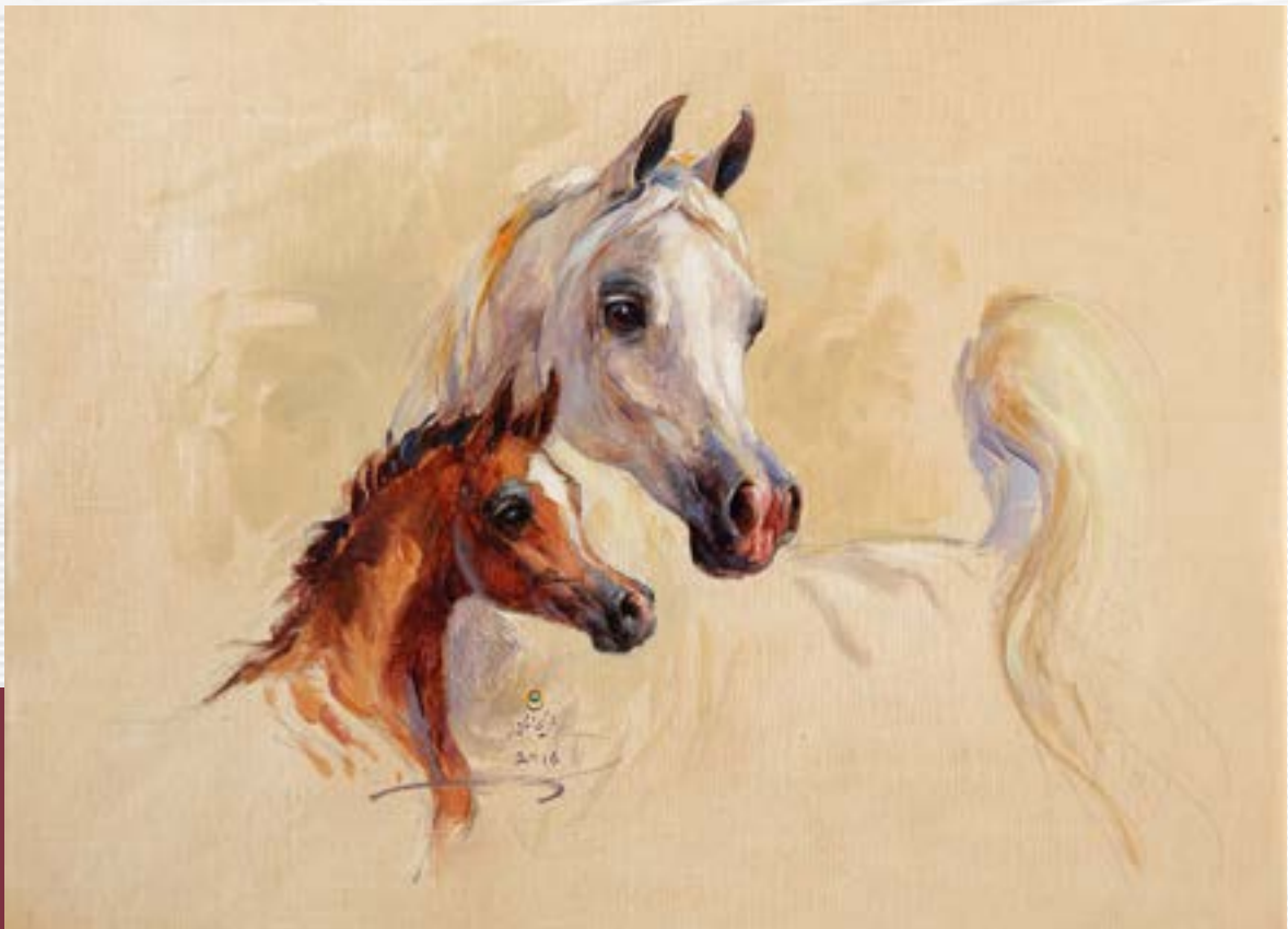
An Unconditional Love