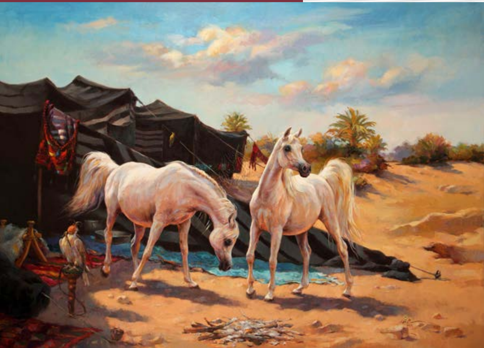
Longing For The Past