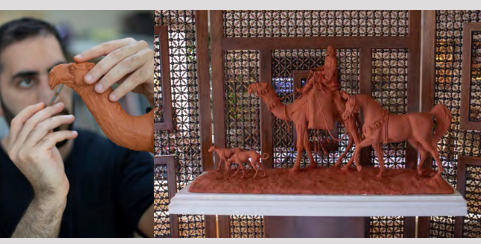
The Savior, terracotta sculpture.