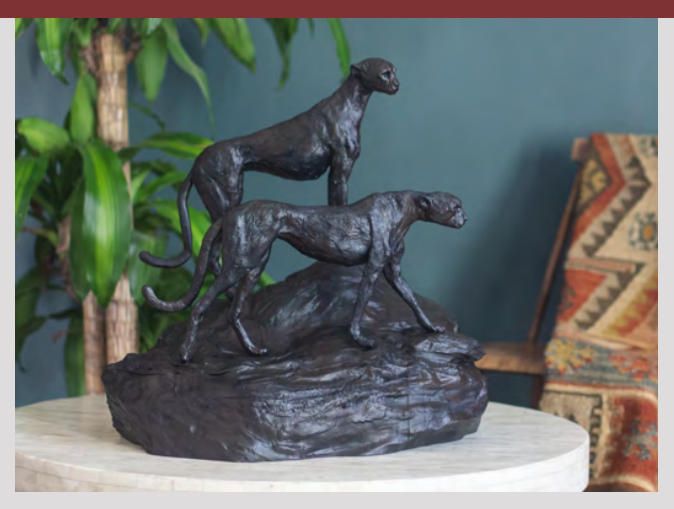
Two cheetahs, bronze.

warm colour underlines its atmosphere. The certain fragility of Terracotta adds to its preciousness. Terracotta ("baked earth") has a long tradition in art. Already in prehistoric art as well as in ancient times, as for example in Chinese pottery or in old Egypt, it was a desirable medium. It is very fascinating to watch a gifted artist like Husain Albanay create a beautiful work of art out of a fairly coarse, porous lump of clay. Then the sculpture is fired until it gets hard.