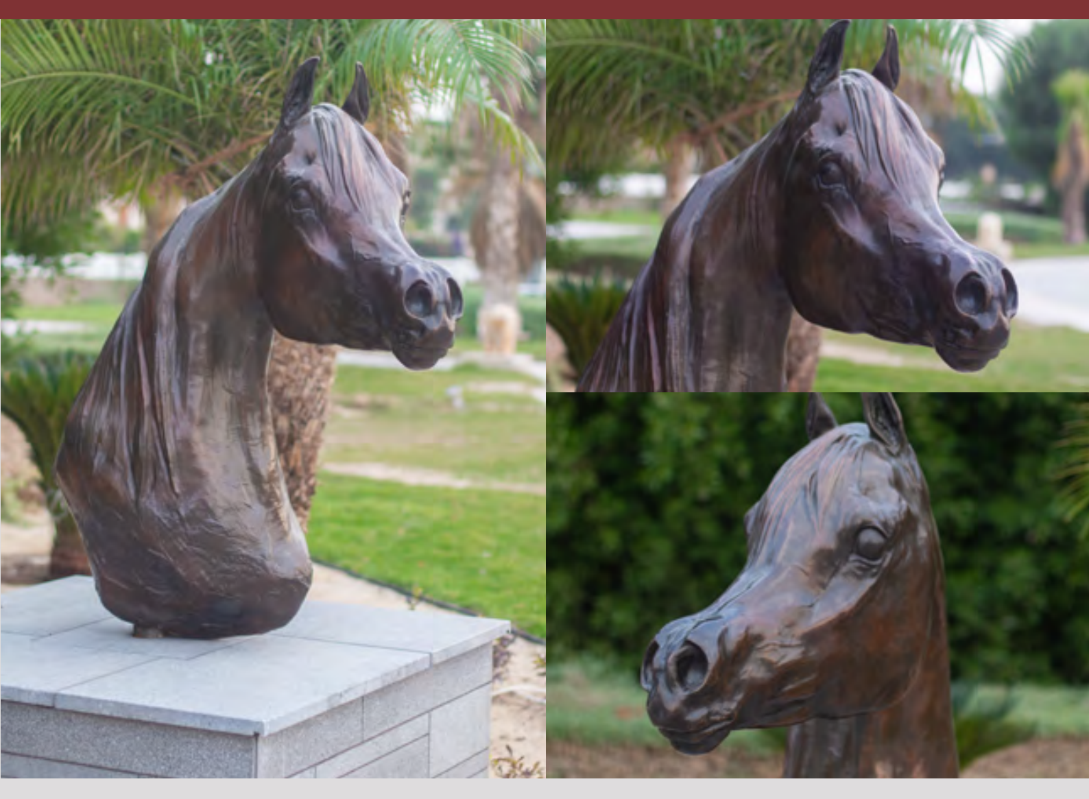
The large-sized bronze statue of M. Najla.