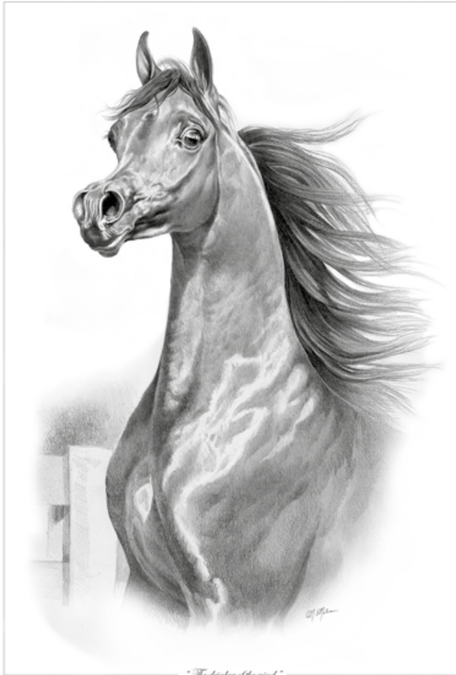
Arabian Trilogy "The drinker of the wind" Pencil - Print Size: H.cm. 70 x L.cm. 50