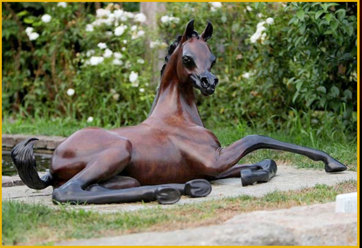
Arabian Trilogy "The drinker of the wind" Pencil - Print Size: H.cm. 70 x L.cm. 50