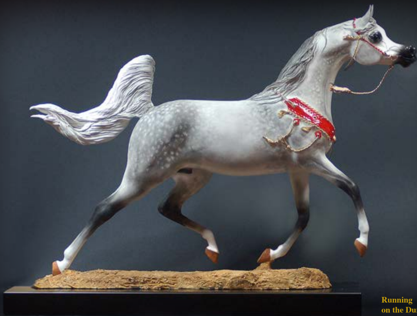
Running on the Dunes