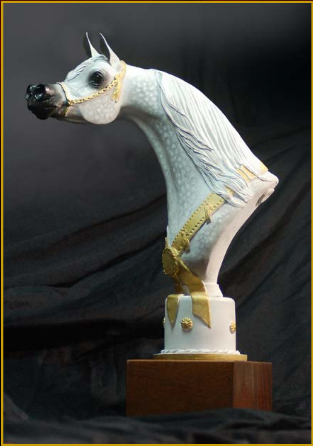
“The Best Head” Resin Trophy - Size: H.cm. 36 x L.cm. 21 x W.cm11