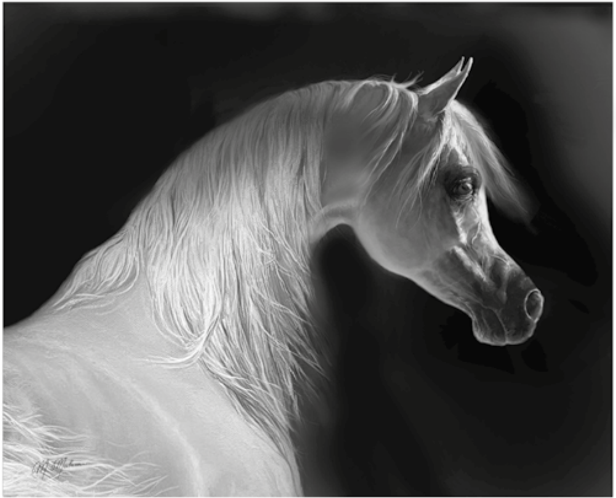
"Stallion in the Shadow"