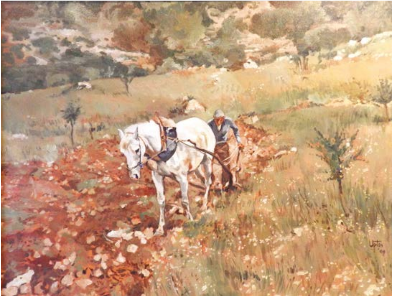
Gazala, found pulling a plough. oils

important to the stud and produced some very good daughters. Some eight years later two more stallions arrived, a gift from Spain, one named Jabao, the other Almozabor. Again, their names were changed, Jabao became Saameh, a bay of the Mokladie strain, the other became Ushaahe, a grey by Ifni of the Duke of Veragua fame.