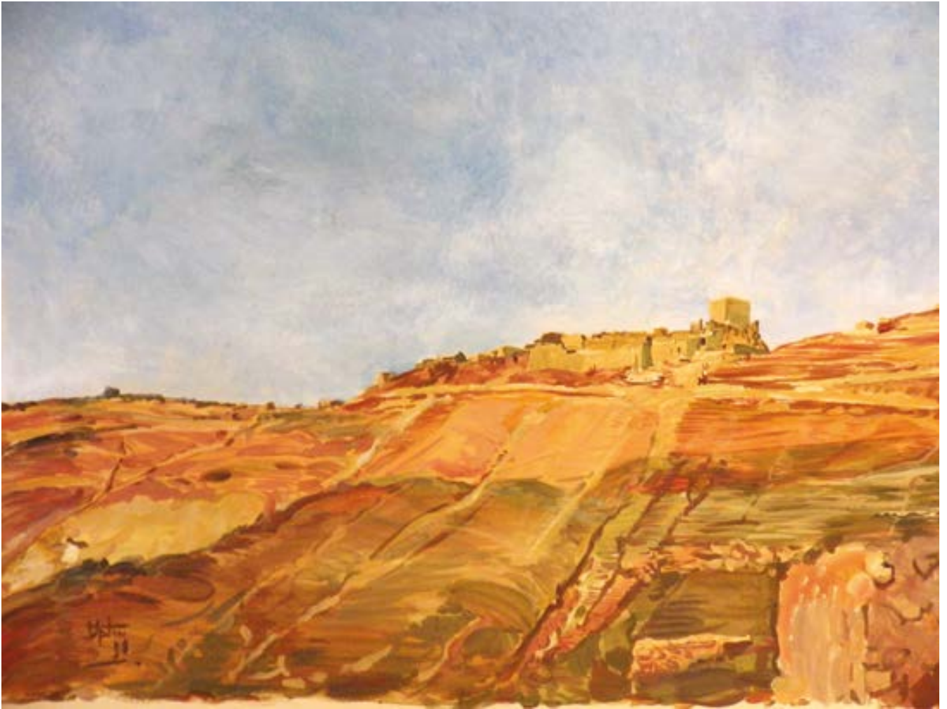
Kerak Castle where the Majali tribe is situated.

called Petra, after a well-known place in the South.