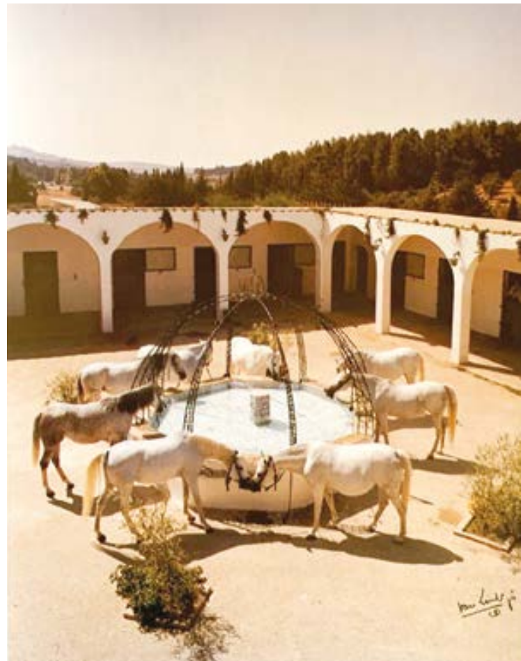
The Royal Stables in Jordan