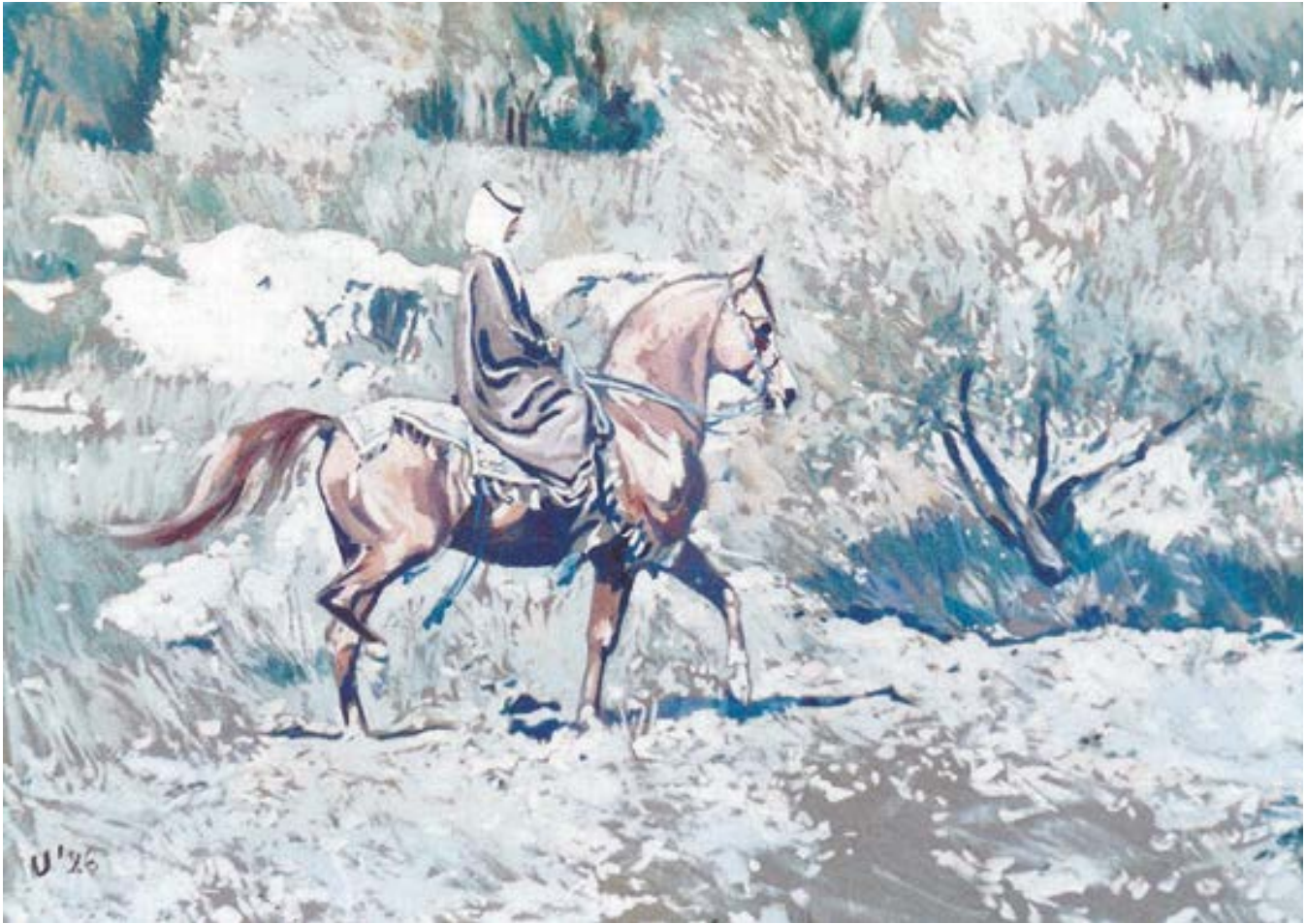
Attar riding - Baharein RJS. w / c

Marathons and Endurance Rides are very popular particularly in Wadi Rum.