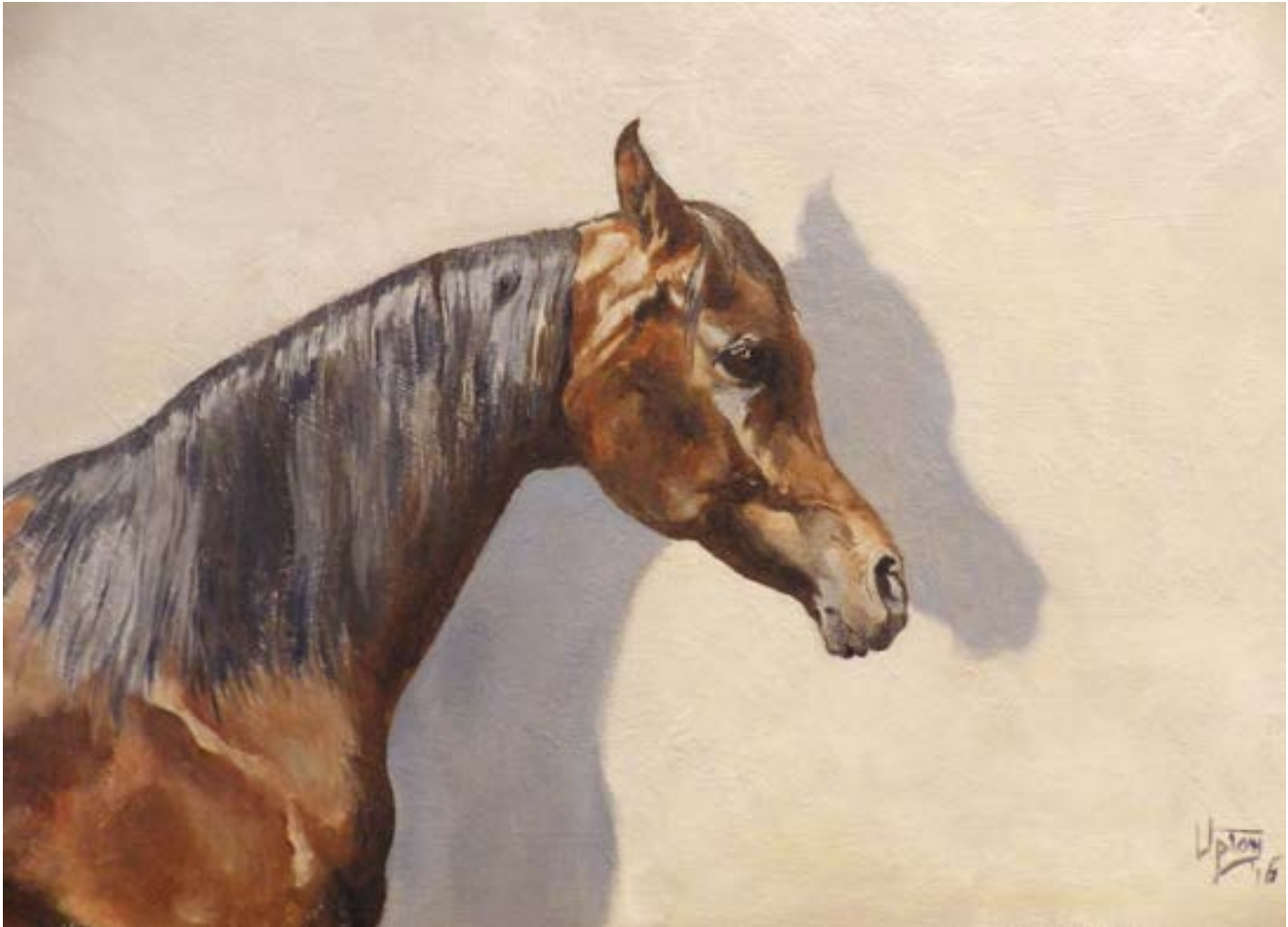
Al Hammama - a mare at the Royal Stud. oils