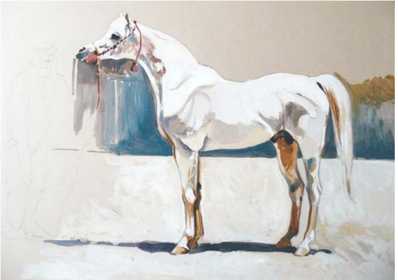
Mehrez - Royal Jordanian Stud. w / c

danger had to get out, so riding the stallions, leading others and with the rest set loose, they got away just in time, climbing 3,000 feet up the mountains, and crossing deep wadis, they reached Amman after a 12-hour ordeal. The precious Arab horses were safe and new stud buildings and paddocks were built at Al-Hummar, north-west of Amman, where I believe we will go tomorrow.