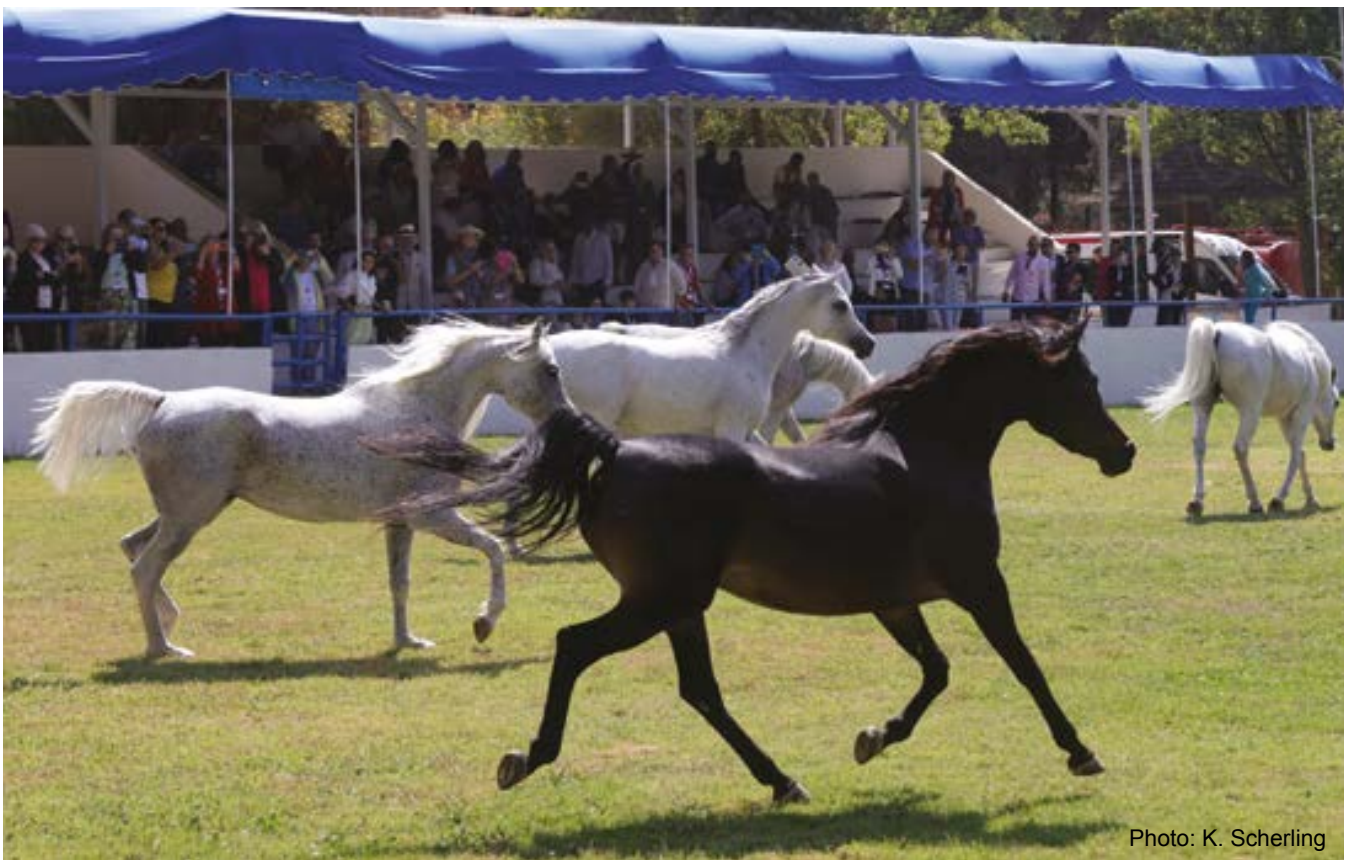
Presentation of the noble mares from the Royal Stables of Jordan