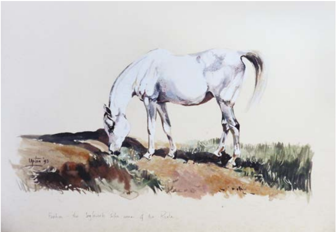
Farha - the last Seglawieh of the Roala tribe.

It was named, "The Arab Horse at Home". And home it is, for many of the horse-breeding tribes lived - and still live - in Jordan. To mention but a few: The Roala, one of the tribes of the Anazeh, is a powerful tribe, long renowned for its Arab horses. At least 183 known Arab horses, and probably as many unknown, were purchased between the 1830's and 1930's by such as Abbas Pasha I, Ali Pasha Sherif, Baron von Fechtig, Homer Davenport and the Blunts. Studs in Weil, Germany, Babolna, Hungary, Poland, Italy, Argentina, Spain and England were to visit the Roala in order to purchase Arab horses.