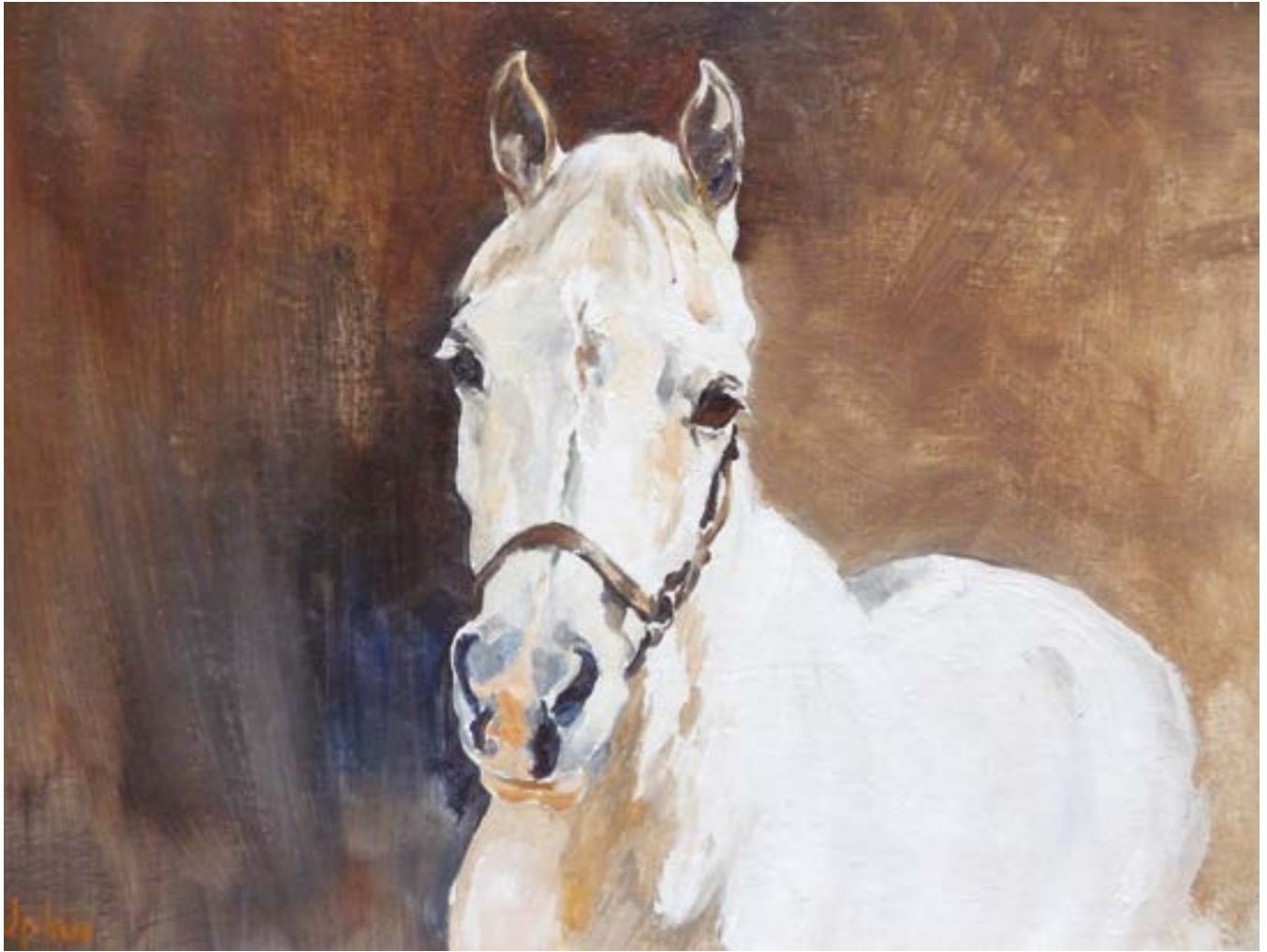
Gazala - a grey mare of the Kehilet el Krush strain, only two generations from the foundation mare. oils

the Bedouin tribes led by Abdullah and Feysul, fighting all the way, reached Damascus, just before the British Army. With them the Arabs brought their camels and horses.