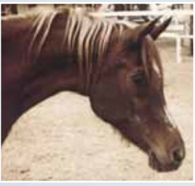
▲ Moniet El Nefous