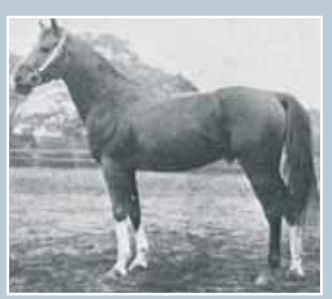
Harb full brother of Hamasa