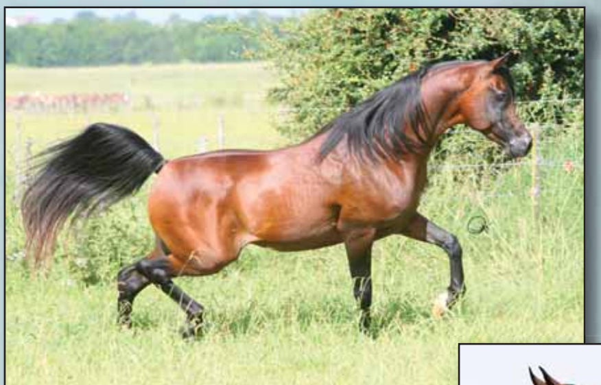
ZT Faa'lq (Anaza El Farid x ZT Jamdusah). Gigi Grasso photo.

Marwan Al Shaqab (Gazal Al Shaqab x Little Liza Fame). Gigi Grasso photo.