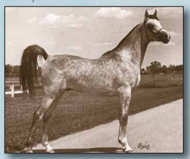
Shaikh Al Badi as a yearling.