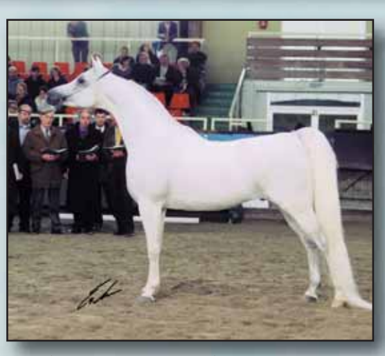
Farres (Anaza El Farid x Shameera).