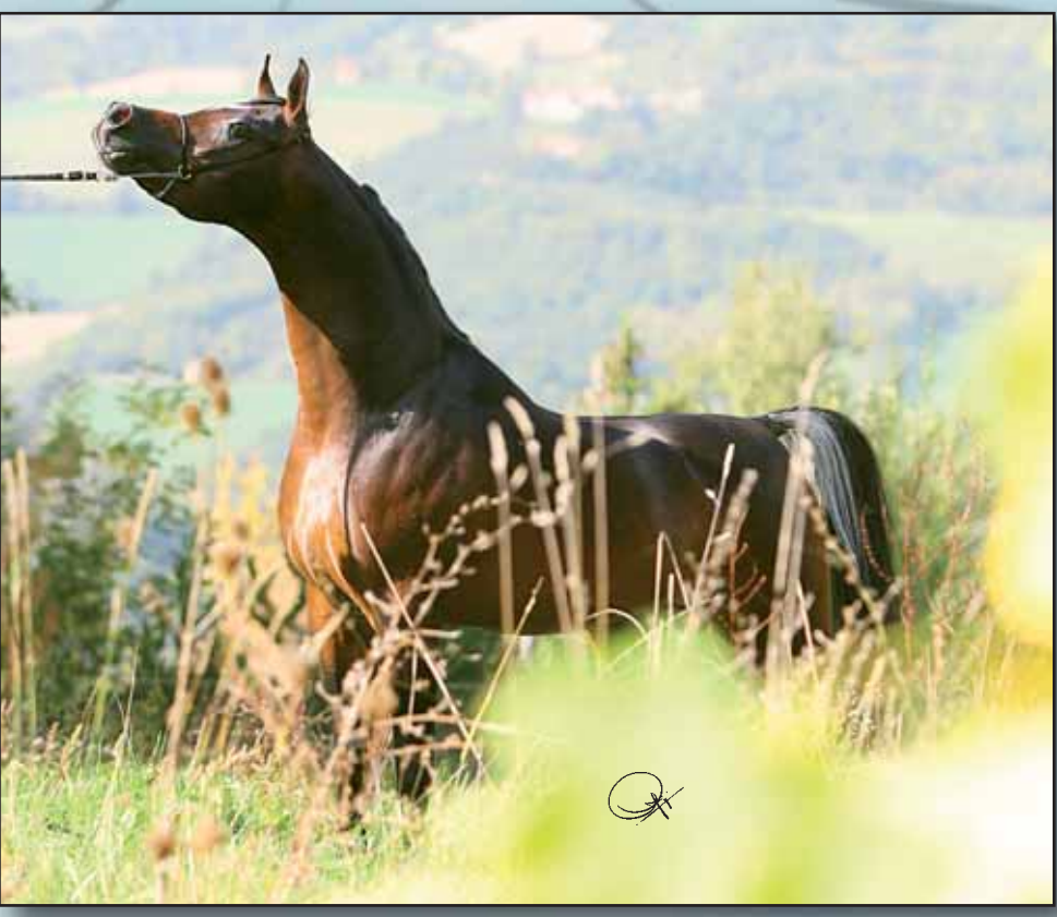
Royal Colours (True Colours x Xtreme Wonder).

as a leading sire of Egyptian Event Champions, and a sire of numerous international champions. He eclipsed his sire, producing currently 829 get to become, as of this year, the all