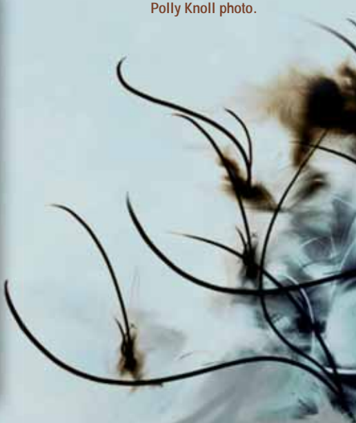
Bint Magidaa (Khofo x Magidaa).