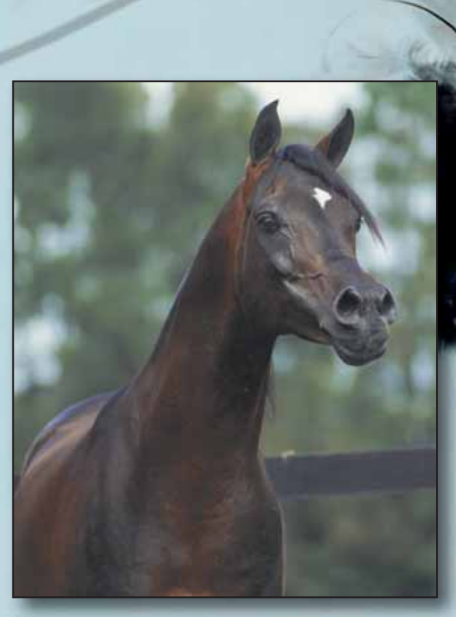
Anaza Bay Shahh (Shaikh Al Badi x Bint Deenaa).

The role of Bint Deenaa in extending the patriarchy of Shaikh Al Badi is not just through her famous sons by Ruminaja Ali already mentioned. Her only foal by Shaikh Al Badi is the absolutely beautiful stallion Anaza Bay Shahh (Shaikh Al Badi x Bint Deenaa). This beautiful dark bay stallion was U.S. National Top Four Futurity stallion and Australian Reserve National Champion, as well as sire of international champions in both halter and performance. He also sired a number of popular and prolific sons, extending the patriarchy. However he is also a fine sire of excellent producing mares.