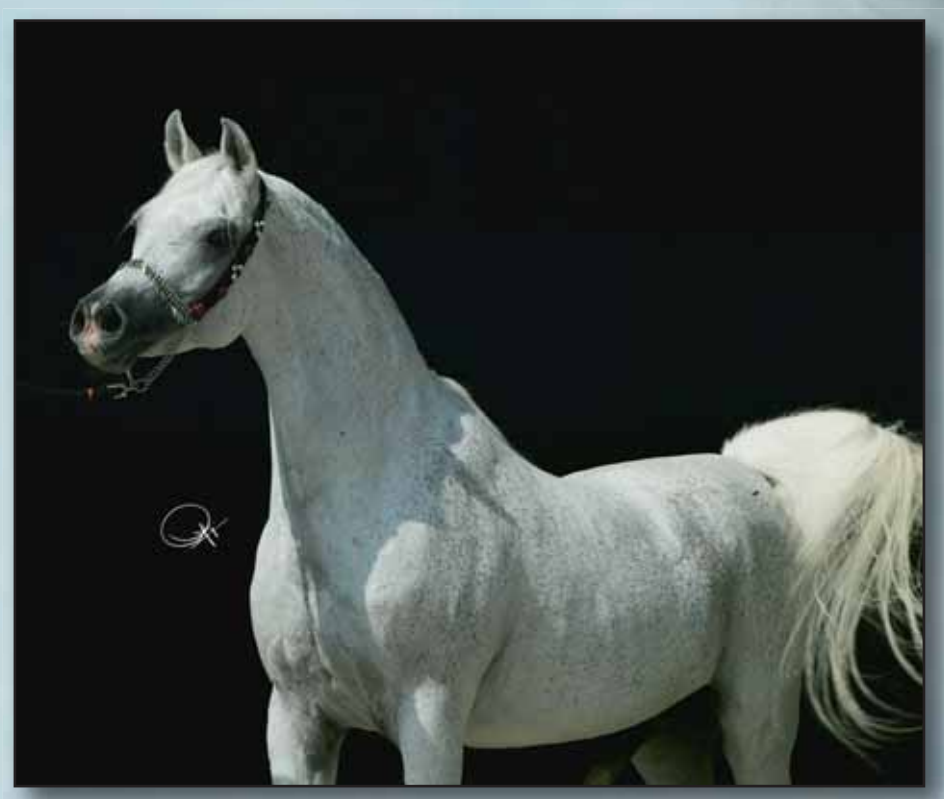
Alidaar (Shaikh Al Badi x Bint Magidaa).

The Shaikh Al Badi - Bint Magidaa story would not be complete without mentioning the final member of this legacy, the stallion Alidaar. Born the same year as the Minstril, Alidaar was much like Ruminaja Ali in his style and appearance, yet he was his own horse. As he matured he was a stunning example of the classic Arabian that led him on an international journey. In 1991 as a seven year old he was exported from the U.S. to France impressing the judges in his first show at Menton with a near perfect score. He then went on to establish himself as an excellent sire. Moving about Europe he gained momentum as a sire of unforgettable "classics" such as the stallions Classic Shadwan (x Shagia Bint Shadwan) and Classic Rayan (x AK Raiyeh) to name a few. The final leg of Alidaar's journey so far is in Qatar where he has had the opportunity to breed some of the world's finest Arabian mares with very impressive results. He has sired well over 200 foals as of last year with more on the way.