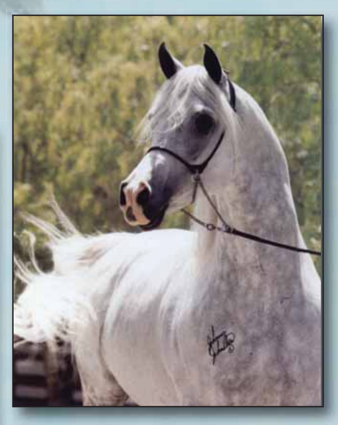
Ruminaja Bahjat (Shaikh Al Badi x Bint Magidaa).

As mentioned before the mating of Shaikh Al Badi to Bint Magidaa was the golden cross. We have seen just how much impact on the breed Ruminaja Ali has, but his other full brothers were also, great horses in their own right and excellent sires. Ruminaja Majed and Ruminaja Fayez, previously mentioned, were good sires of note. Second to Ruminaja Ali in prolificacy was his full brother Ruminaja Bahjat siring 308 foals. He became a phenomenal sire of mares, many of them absolutely beautiful. Among these beauties are: Sonbolahs Music (x SF Bint Sonbohla) exported to Germany, Antiqua Dance (x Talyla) dam of Marquis I and Calypso Dance, Gift of the Nile (x Ansata Nile Gift) and Sche'mon Ami (x ZT Shahmona).