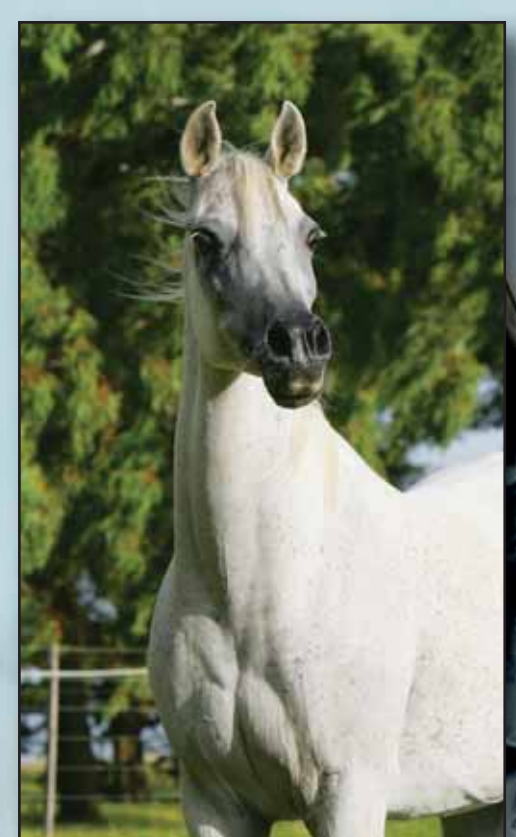
Sche'Mon Ami (Ruminaja Bahjat x ZT Shahmona).

As mentioned before the mating of Shaikh Al Badi to Bint Magidaa was the golden cross. We have seen just how much impact on the breed Ruminaja Ali has, but his other full brothers were also, great horses in their own right and excellent sires. Ruminaja Majed and Ruminaja Fayez, previously mentioned, were good sires of note. Second to Ruminaja Ali in prolificacy was his full brother Ruminaja Bahjat siring 308 foals. He became a phenomenal sire of mares, many of them absolutely beautiful. Among these beauties are: Sonbolahs Music (x SF Bint Sonbohla) exported to Germany, Antiqua Dance (x Talyla) dam of Marquis I and Calypso Dance, Gift of the Nile (x Ansata Nile Gift) and Sche'mon Ami (x ZT Shahmona).