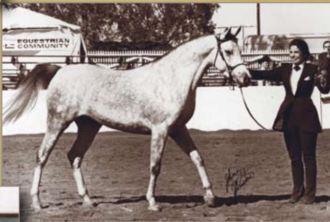
Dalia (Morafic x Romanaa II by Sameh) Many times champion and dam of Imperial Imdal.

Serenity El Bitan (by the Morafic son Khofo x Serenity