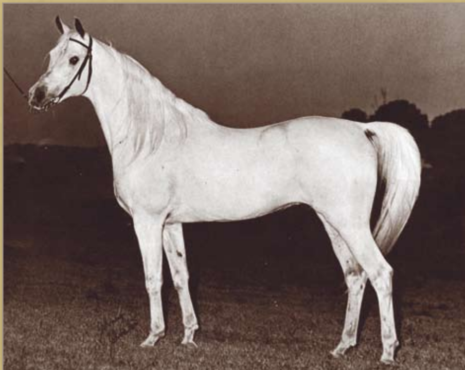
Morafic in his prime at Gleannloch Farms.