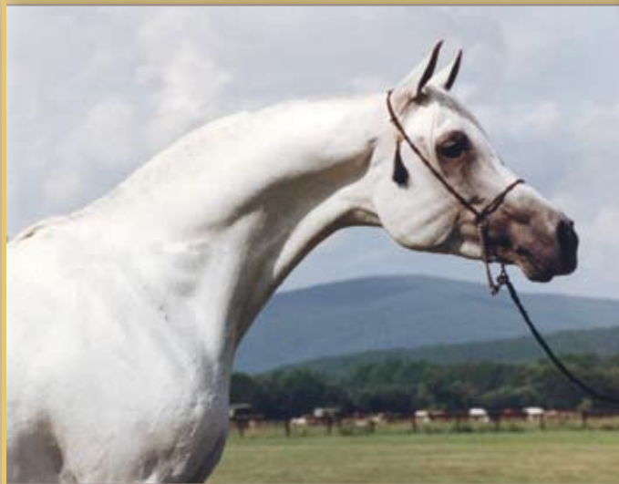
Prince Fa Moniet (TheEgyptianPrince x Fa Moniet by Ibn Moniet El Nefous)

It was only natural that our next visit be to Bentwood Farms in Texas where three sons of Morafic were at stud: Refky (x Rafica by Nazeer), TheEgyptianPrince (x Bint Mona) and Ibn Moniet El Nefous (x Moniet El Nefous). Refky was a tall bold chestnut horse born in Egypt who had a racing career before being imported to the U.S. He