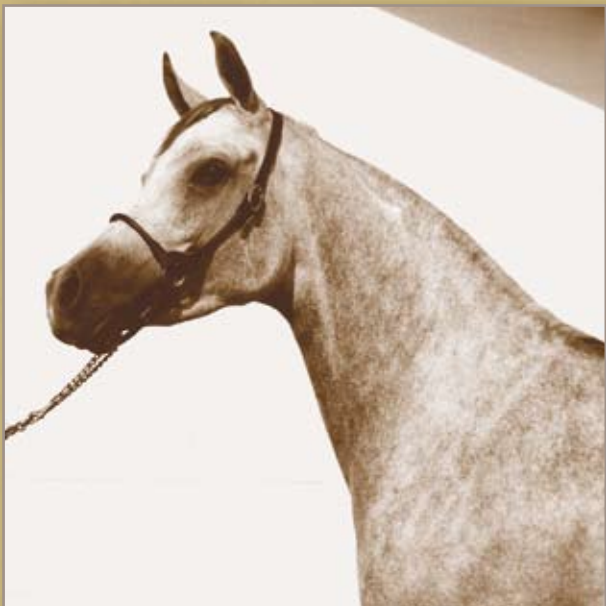
The beautiful Nahlah (Morafic x Mohga by El Sareei) many times U.S. National winner in halter and performance.

great grand dam of Paris World Reserve Champion and Middle Eastern Champion Bint Saida Al Nasser.