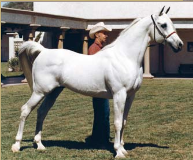
Al Metrabbi (Morafic x Samarra by Morafic) shown here in old age when on lease to Gleannloch

That same year was the second Arabian Horse Fair and it was an even bigger event than the year before. Included in the stallion row were 24 straight Egyptian