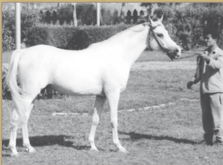
Ghalion (Morafic x Lubna by Sid Abouhom) imported to Hungary for the Babolna Stud. Photo here taken in Egypt prior to his exportation.