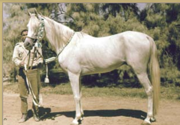
Images of Morafic as a young horse in Egypt.

silhouette was dramatic, resembling the finest desert bred Saluqi dogs, and conveying the look of speed and grace.