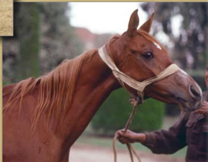
The lovely Farfoura (Morafic x Bint Mona) full sister to The Egyptian Prince, Il Muna and Norra. She was foaled in Egypt prior to her dam being imported with Morafic. She remained a broodmare for the EAO.

Our visit to Gleannloch gave us the opportunity to see several sons of Morafic and numerous daughters. Morafic's replacement since his passing was the stallion Ibn Morafic (x Kahramana by Anter). He was a handsome young stallion with a beautiful head and a lovely eye. There were several chestnut sons of Morafic such as Al Fattah and Zaim both out of Safaa (Sameh x Lubna) and they seemed to more resemble their dam. Zaim was later exported to His Majesty Hassan, King of Morocco. There were lovely daughters of Morafic everywhere. One could not help