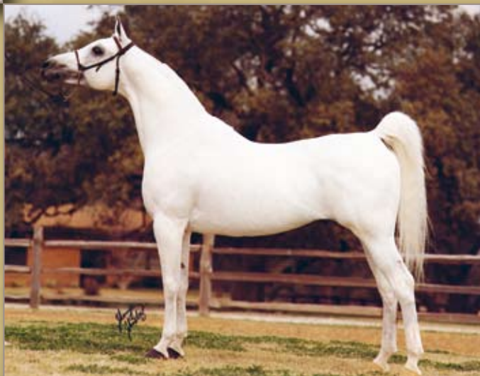
TheEgyptianPrince (Morafic x Bint Mona).

The next few summers were spent visiting the major Egyptian breeding farms in America in search of more Morafic descendants. At the famed Anchor Hill Ranch my wife and I were able to see the magnificent Al Metrabbi (Morafic x Samarra by Morafic). He was a very handsome ivory white imposing sight with an ideal blend of both dry refinement and masculine strength. He displayed great nobility and style but also with an amiable personality. He was very athletic and a great