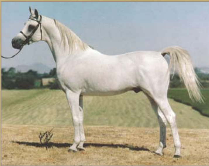
Ibn Moniet El Nefous (Morafic x Moniet El Nefous).