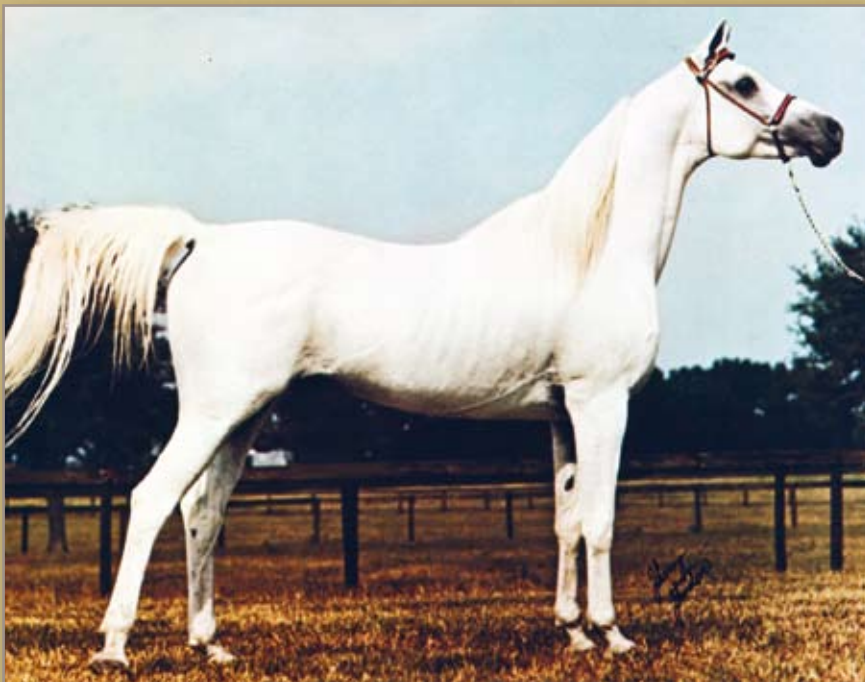
Khofo (Morafic x Nabilahh by Anter) in old age.

choose first to sniff me for a scent. Instead it was all about the eye contact — creature to creature, not man and beast. Those deep dark eyes seemed to radiate the thousand years of the horse of the desert. And then it occurred to me. As I kept looking for Morafic all those years, Khofo reminded me it was something bigger. It was not just Morafic but it was the vision of the noble horse that is supreme and timeless, the gift of Allah that is unequalled. It is what we all look for in the ideal Arabian horse. It was that special, almost indescribable essence that stops us in our tracks. In Khofo's eyes I finally saw Morafic. Without deep souls like Morafic there would be no El Shaklan, no Ali Jamaal, no Marwan Al Shaqab, no Bint Saida Al Nasser, no Ansata Halim Shah. I left Florida that day fulfilled and with a greater appreciation for the heritage of the horse of the desert. □