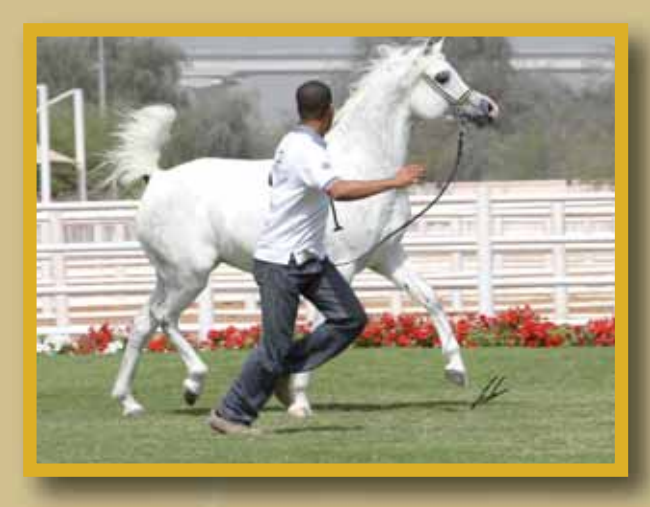
Shadwan's champion daughter Elha El Nile, now owned by Dubai Arabian Stud