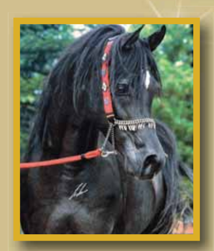
Maheeb (Classic Shadwan x Bint Bint Mahiba by Ansata Halim Shah), one of the most beautiful of all Shadwan sons