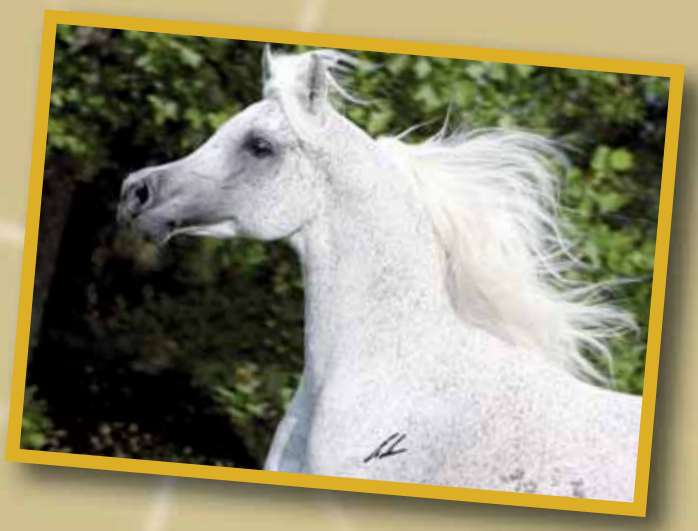
Shadwan's dry and chiselled head