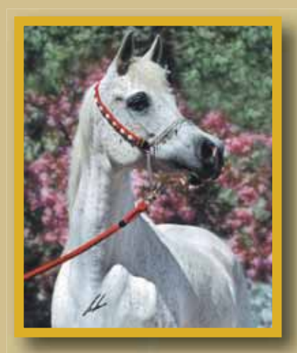
GR Shadwanah (Classic Shadwan x Dalima Shah by Ansata Halim Shah), German Reserve National Champion Filly and Champion Filly of the E.E.E.