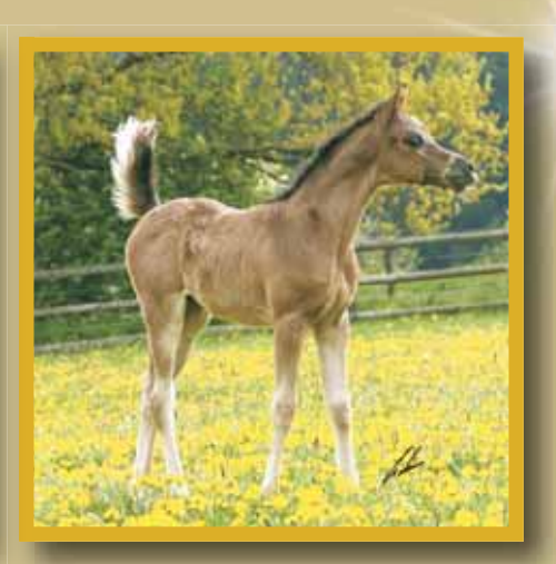
His grand daughter GR Magidaa (Maheeb x GR Marianah)