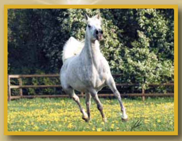
GR Amaretta (Classic Shadwan x Halims Asmara) German National Champion Res. and full-sister to Champion GR Amaretto