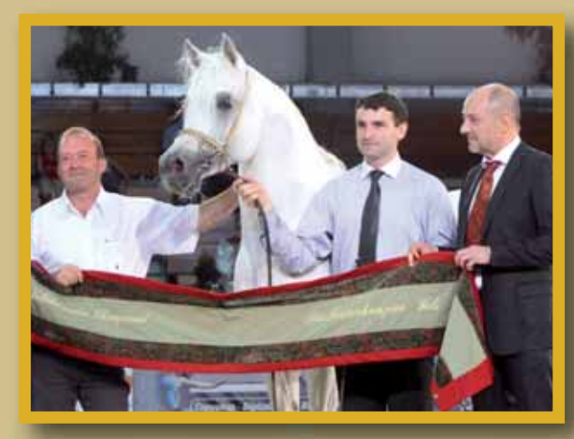
The most decorated son of Classic Shadwan is GR Amaretto (x Halim's Asmara by Ansata Halim Shah), bred and owned by Rothenberg Stud