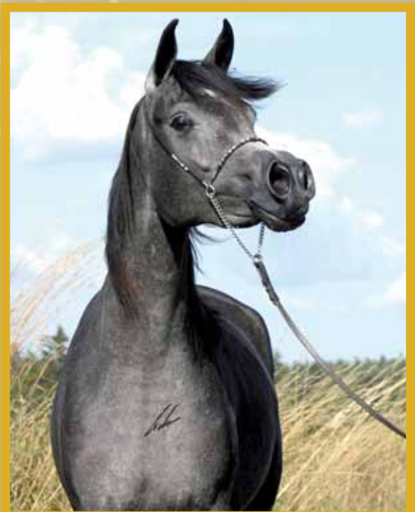
GR Nashidah (Classic Shadwan x Nejdschah) Full-sister to Nasha Bint Shadwan in New-Zealand -Broodmare at Rothenberg Stud (just gave birth to an incredible black filly)