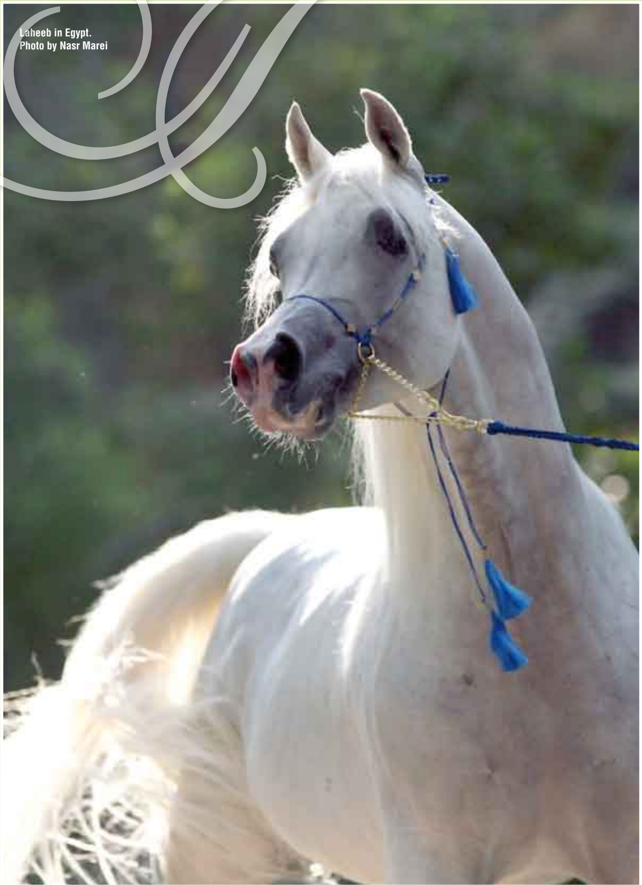
Laheeb in Egypt.