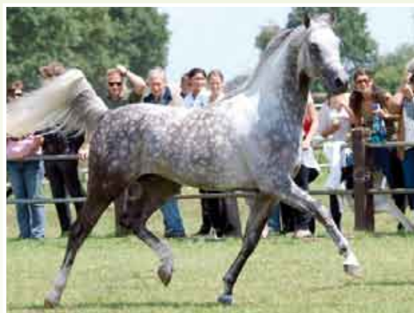
AA Assal.