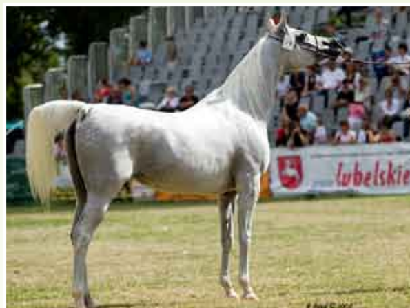
ELLISSARA (out of Ekscella), an ER grey mare bred by Michalow Stud Poland, sold at the 2008 "Pride of Poland" Sale for 240,000 Euro to Saudi Arabia.

to be extremely valuable broodmares, and at the annual Pride of Poland sales, Laheeb daughters have been in great demand and sold for very high prices. These include, among others, the Janow mare Siklawka [Siewka ex