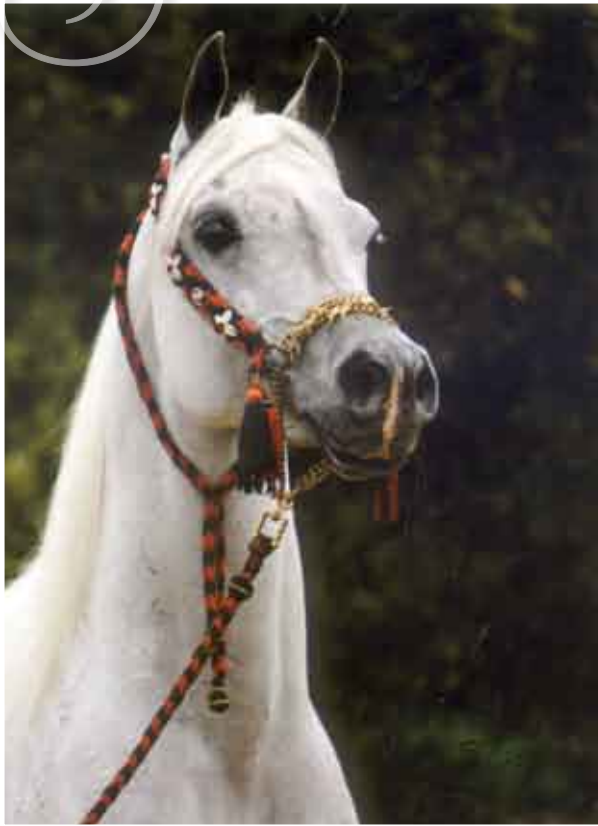
Imperial Imdal

he traces to the stallion Sirecho, an important broodmare sire carrying rare old Egyptian blood.