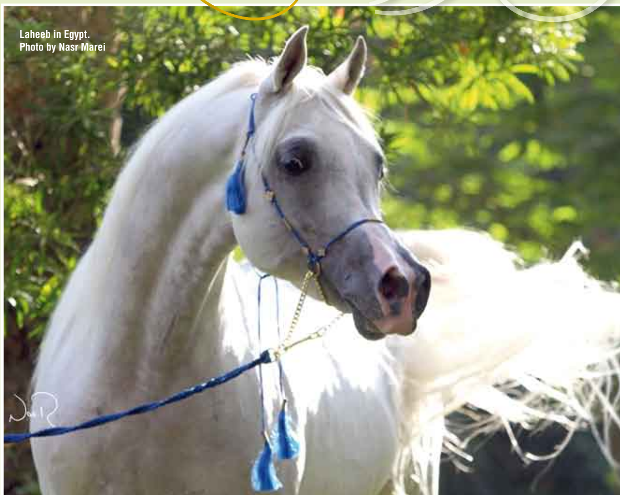
Laheeb in Egypt.