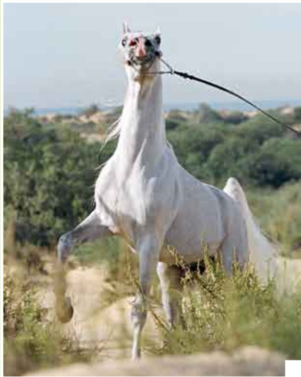
Laheeb in Israel.

titles at the regional Worcester show in South Africa's Western Cape, and he then went on to win Top Five stallion honors at the South African National Championships in April, and the title of Supreme National Champion Stallion of Namibia in September.