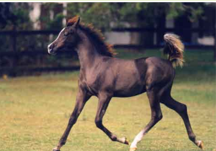
Laheeb in Israel.

surprised to see how well he was doing, even suggesting that perhaps one day he might return to the show ring. Sometime later Laheeb spent a month at Sponle's farm to do the required blood tests and paperwork before shipment back to Israel. Just before Laheeb's departure, on May 2, 2002, Sponle once again told Chen that one day they should consider showing him again. Chen remained doubtful, certain that he was simply being overly optimistic.