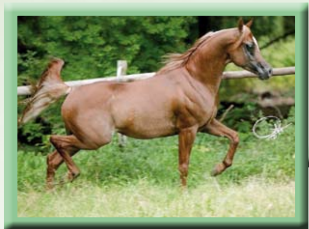
Authentic Kharazi (Maysoun x Kaliya by Al Kidir)