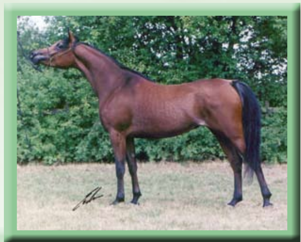
Bint Kahila (Al Kidir x Kahila II)