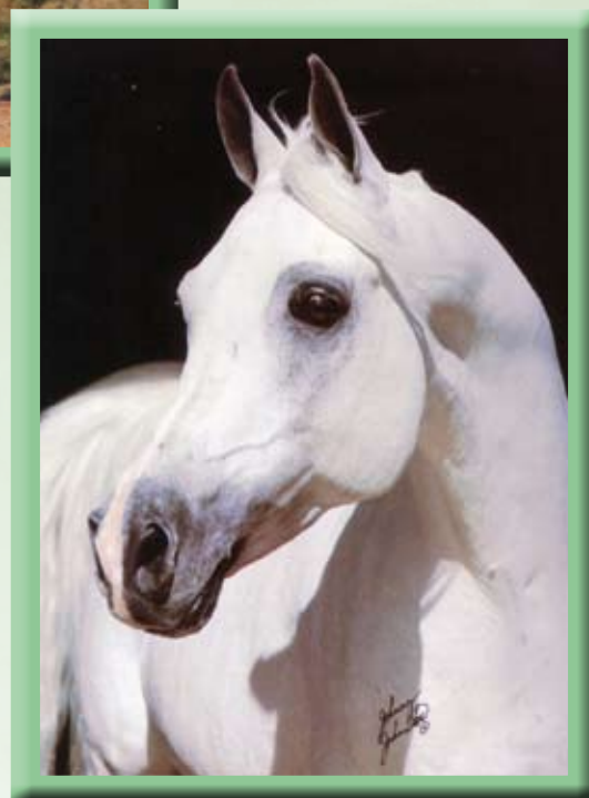
The Egyptian Prince, the sire of Al Kidir