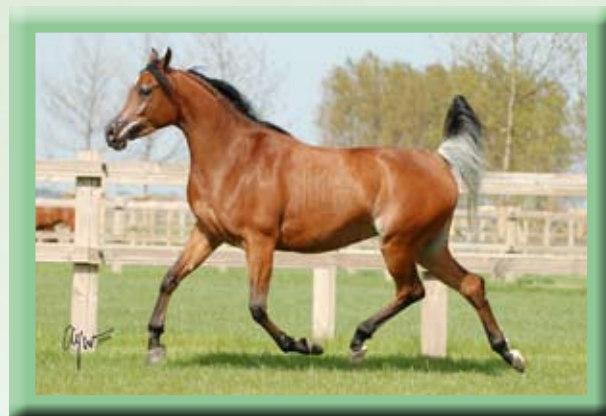
Pyramid Nour El Nil (AlLahah x Bint Kahila)