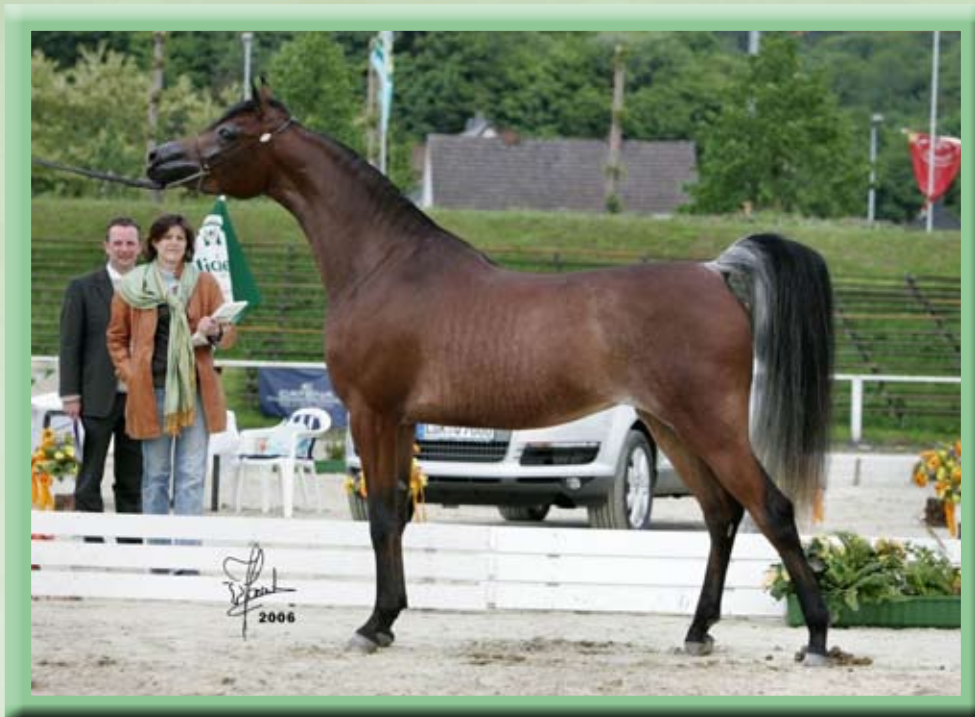
Pyramid Lahara (Al Lahab x Bint Kahila)