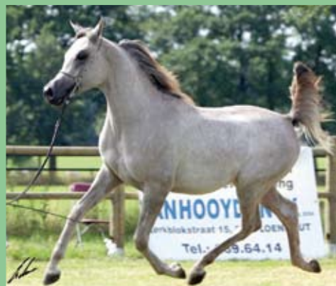
Mahfouz Halim (Al Adeed Al Shaqab x Bint Moufisa by Al Kidir)