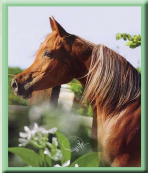
Kaliya (Al Kidir x Kaythara Halima)

Europe for another Al Kidir daughter and finally found Mahasin's younger full sister, Alia El Nile. A small yet ultra refined grey mare with huge black eyes who now grazes Rabab Stud's broodmare band. Alia El Nile is the dam of the bold moving Elha El Nile (by Classic Shadwan) who was Junior Champion Filly at the Egyptian Event in Italy 2006 and is now owned by Dubai Arabian Horse Stud.