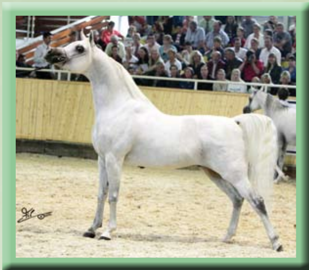
Al Lahab (Laheeb x The Vision HG)