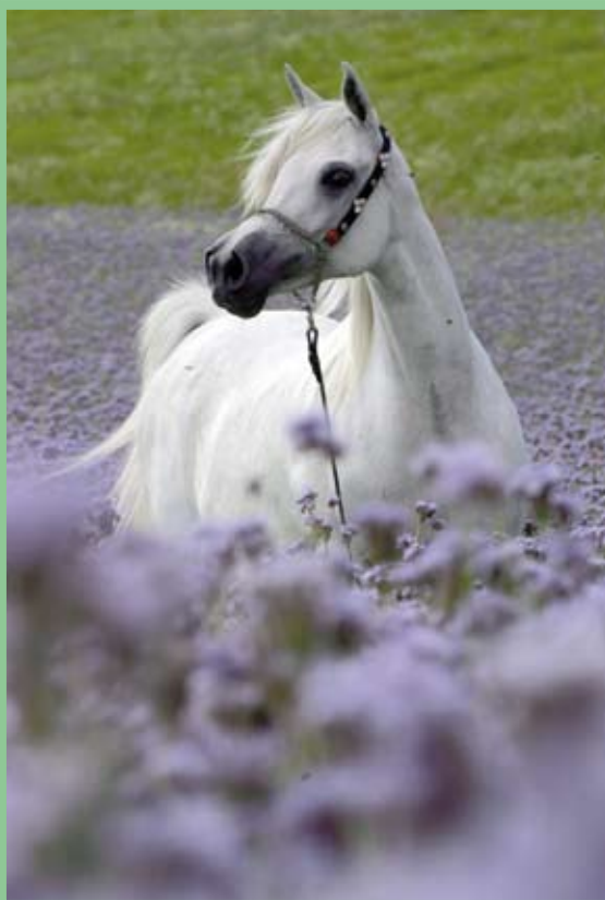
Bint Moufisa (Al Kidir x Moufisa Halima)