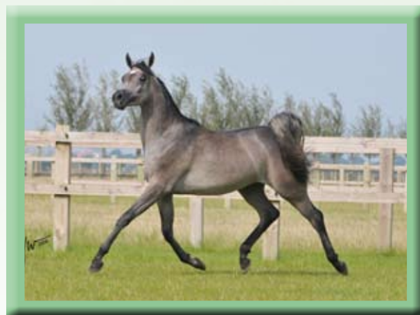
Pyramid Kahileh K (Al Lahab x Bint Kahika)