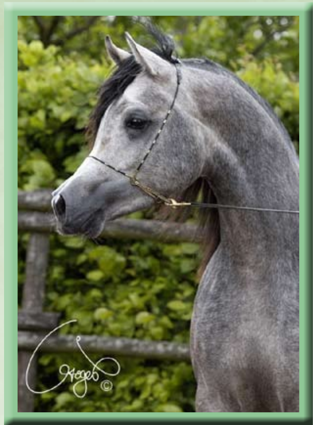
Pyramid Layyan (Al Lahab x Bint Kahila)

Reserve Champion Mare of the 2009 Arabesque Egyptian Event.