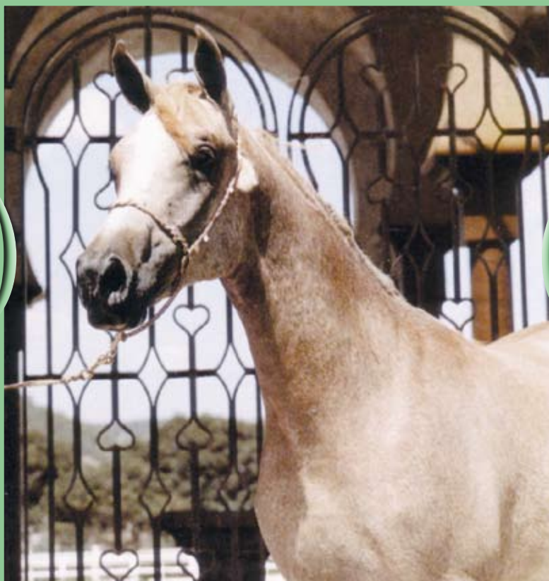
Al Kidir as a yearling at Gleannloch Farms