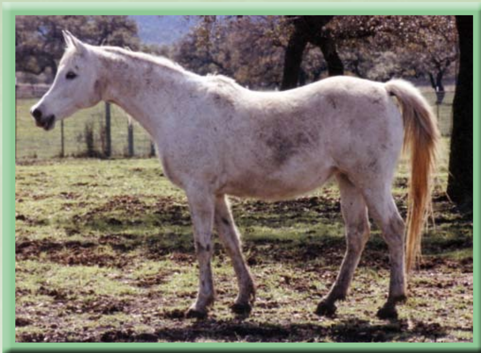
AK Khattaara in the paddock of Gleannloch Farms just after a rainfall dirty but still beautiful