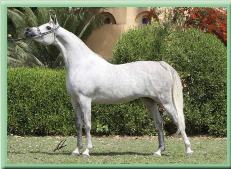
Mahala (Al Lahab x Mahasin by Al Kidir)

horses. He was „too beautiful“ to perform, they said. Well, Al Kidir proved all these „experts“ wrong when he was entered in the harsh German Stallion Performance Test and came off as winner (stallions got tested for 100 days and then had to pass a final assessment, consisting of dressage, hunter jumping and a race). Critics became silent. Over the years he was lightly shown as well but never was in professional show training. However, his quality shone through and the judges named him (among others) Reserve Senior Champion Stallion of the 1988 Asil Cup.