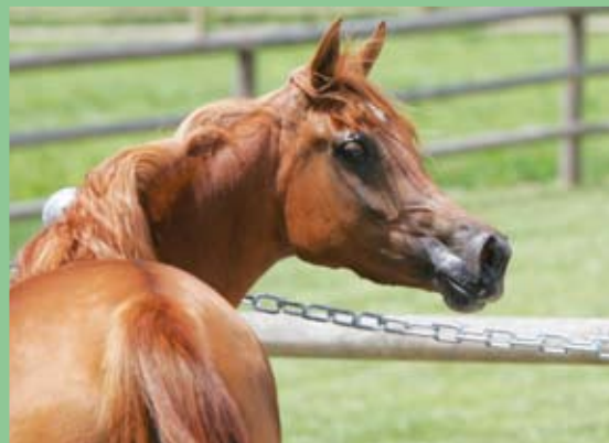
Monisa Halima (Al Kidir x Moufisa Halima)