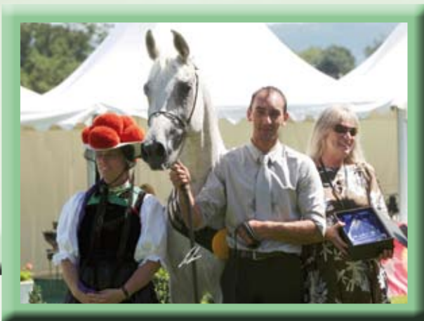
Korashia (Al Kidir x Kaidara)