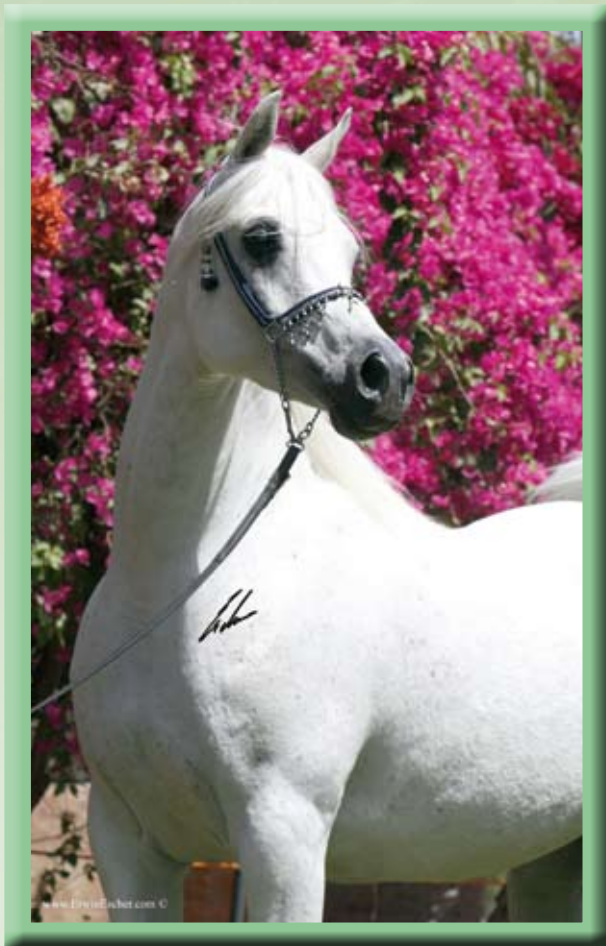
Alia El Nile (Al Kidir x Mahasin)