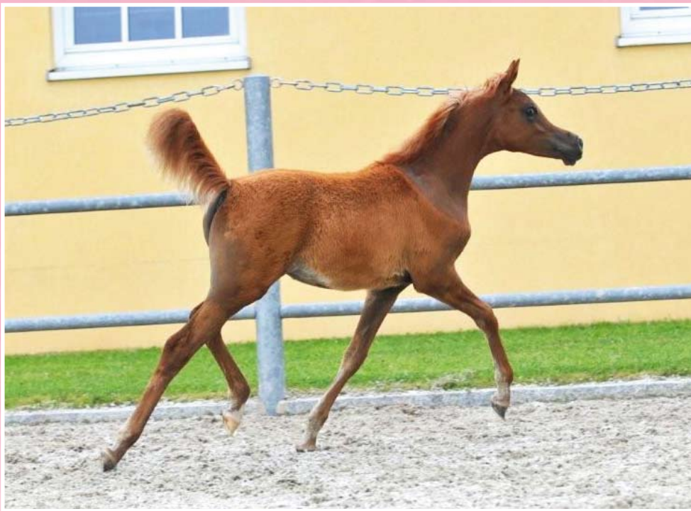
Nile Halima (x Nashua Halima by Al Adeed Al Shaqab)

model. But as they mature and fill out they stay elegant, just like their sire.