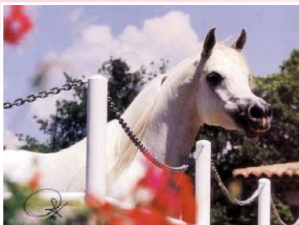
HMT Princess Karima (by PVA Kariim), owner Al Waab Stud, Qatar