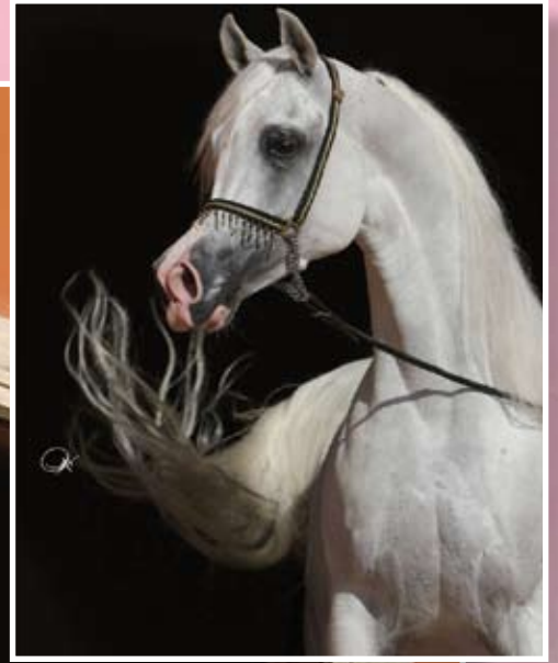
Imperial Baarez (by PVA Kariim) owner El Farida Stud, Egypt