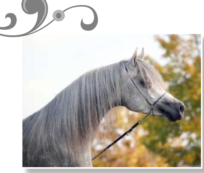
Al Hadiyah AA (Laheeb x The Vision HG)

Hadiyah AA and Al Raheb AA; both are multi-champions in Israel, with Al Hadiyah never defeated in Israel. Recently on lease to Al Movida Arabians in Austria, Al Hadiyah brought home both the 2008 Austrian Nationals and the Asil Club Junior Champion Colt titles. In 2009 he was sold to an Israeli breeder.