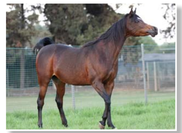
Al Baragai AA (Baahir x The Vision HG)