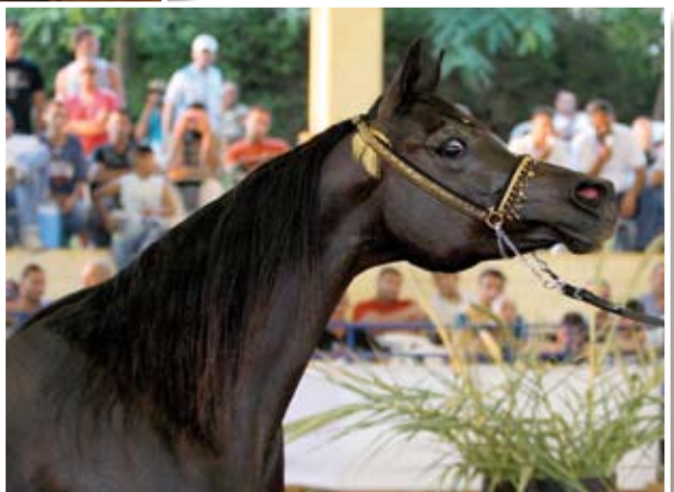
The Vision © Shira Yegar

It is small wonder that when one thinks of The Vision, one think first of extraordinary type and exquisite beauty, for these traits are considered the strongest and most consistent