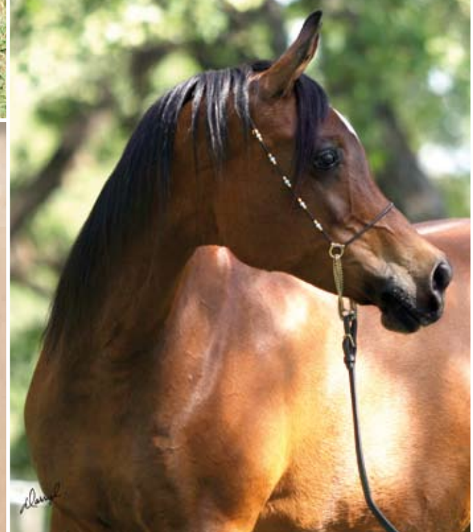
Belle Staar

A Saqlawi Jedrania in strain, the Vision is a member of the influential Zafaarana family, tracing in tailfemale to the famous mare Radia. Her pedigree shows