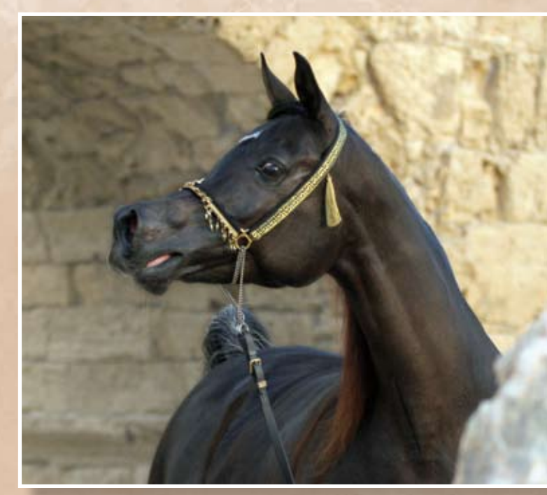
The Vision

BKV and Israeli National Champion Filly, the Egyptianrelated Dafina AA. Al Maraam's most famous daughter is the classic white Latifah AA, (x Imperial Kalatifa), dam of Lutfina AA, this year's Israeli National Gold Medal Filly Foal; she herself won the titles of Filly Foal Champion, National Champion Filly, National Champion Mare and Egyptian Event-Israel Champion Mare in Israel before her lease to Becker Arabians in Europe. During 2009 Latifah