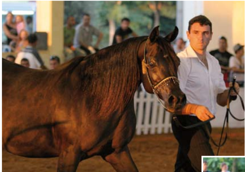
traits carried by the Saqlawi strain. Her pedigree is very rich in Saqlawi blood and The Vision herself is a remarkable example of this strain.