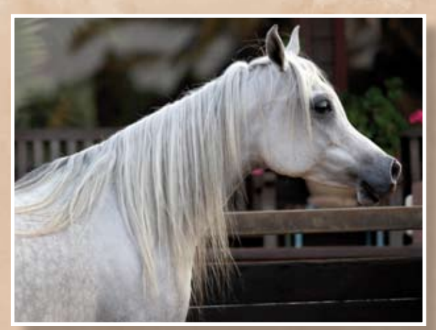
Al Halah AA (Laheeb x The Vision HG)

This successful Vision x Laheeb mating was repeated for the next two years and produced two more world class colts, Al