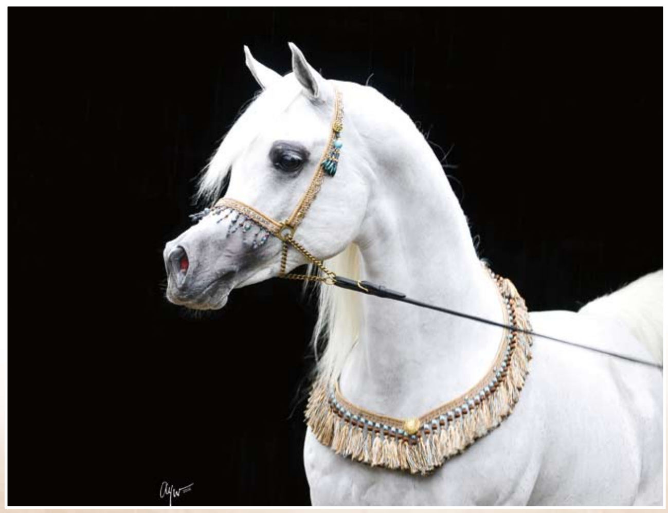
Al Lahab (Laheeb x The Vision HG)

won the Champion Mare titles at both the International B Show at Strohen and the Arabesque Egyptian Cup in Baden-Baden, as well as the Reserve Champion Mare title at the Kauber-Platte International B Show.