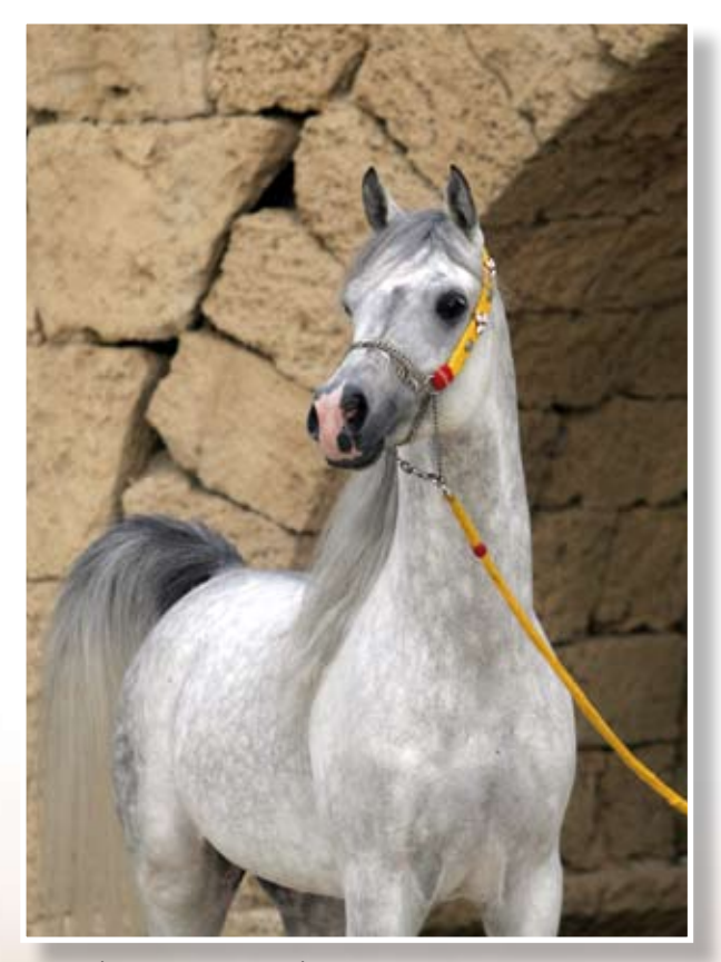
Al Bilal (Al Maraam x Bahiha) Owned by Ajman Stud