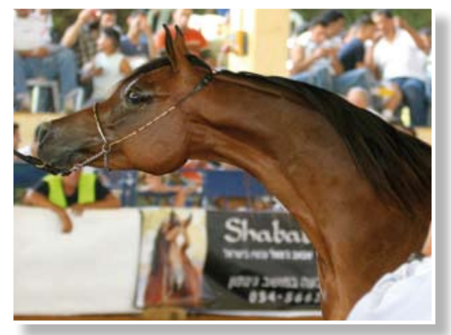
Al Amal AA (Halim Shah I x The Vision HG) owned by La Movida Farm, Austria

Vision's cross with the Babolna stallion Halim Shah I (Ansata Halim Shah x 214 Ibn Galal I) resulted in the elegant bay Al Amal AA, who proved a consistent show winner in Israel and is the dam of both the 2008 Egyptian Event-Israel Junior Champion Filly Ayat AA by Al Ayad, and the 2009 Israeli Reserve Champion Foal Colt and Egyptian Cup Gold Medal Foal Colt Champion, Abyad AA, by Nader al Jamal. She is the first daughter of The Vision ever to be sold, purchased a few months ago by Al Movida Arabians in Austria as foundation mare of their new straight Egyptian program. Al Amal's daughter Ayat AA, a former Reserve Filly Foal Champion and Junior Champion Filly at Israel's Egyptian Event, will be