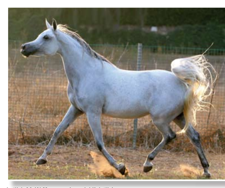
Latifah AA (Al Maraam x Imperial Kalatifa) Bred and owned by Ariela Arabians, on lease to Becker Arabians -Germany