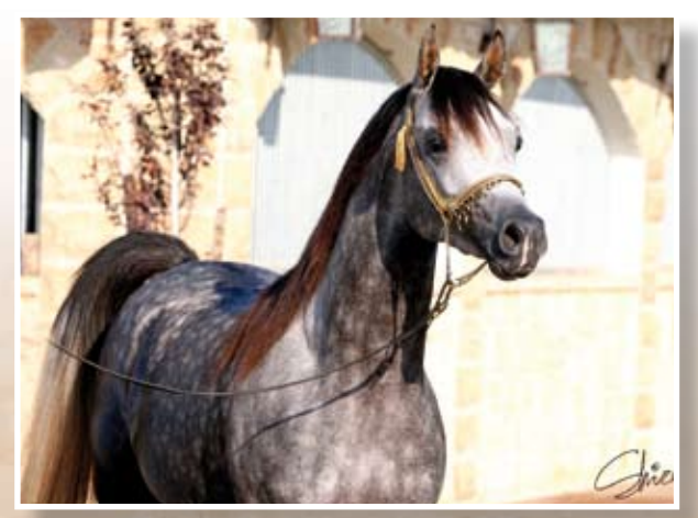
Al Raheb AA (Laheeb x The Vision HG)

•2008 Junior Champion Colt at the Austrian Nationals 2008 Junior Champion at the Asil Cup International, Germany