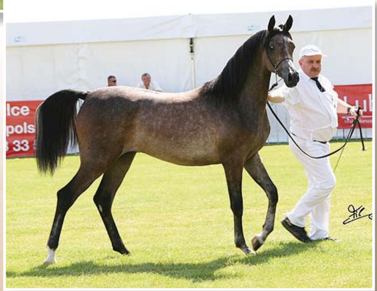
Parmana (Al Maraam x Palmira) ER filly. Bred and owned by Michalow Stud

winners and his daughters excellent broodmares. In Israel, Maraam has maintained his edge as the leading sire and grandsire of show champions both at the National Championship Show and the prestigious Egyptian Event - Israel and Israel Cup over several years. To illustrate this point, the following are just some of the wins of his progeny which took place during the 2008 and 2009 show seasons: AA Al Bashyr (El Thay Beshira) won the title of 2009 Gold Medal National Champion Stallion, after returning from a two-year lease in America. His paternal half-sister, Nawaal AA (x Insha Sha Latifa) won the title of Israeli Reserve National Champion Filly in 2008 and a coveted Bronze Medal Champion Filly title at the Egyptian Cup this year. Maraam's grandson, the multi-champion colt Mouadaar BKV (Al Bilal x *Barakis Whisper) won