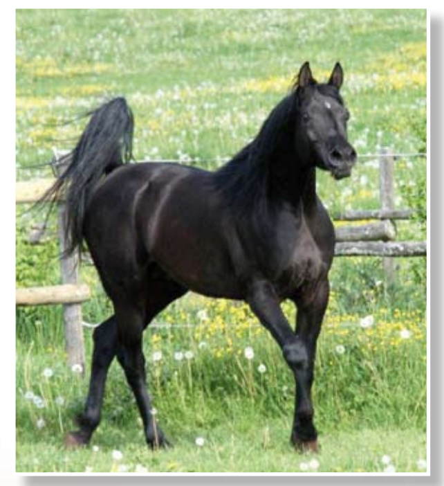
Al Hakim AA (Muhajjal x The Vision HG)

are famous throughout the world. Al Lahab's show ring accomplishments confirmed The Vision's worldwide influence as a broodmare beyond the shadow of a doubt, not just to her owners, but to the entire Arabian industry. Purchased by the Friedmann Family when they saw him in Germany at ten months of age, Al Lahab is today one of the breed's most highly decorated horses, winning the titles of European Junior Champion colt, Egyptian Event Supreme Champion Stallion – USA, twice All Nations Cup Champion Stallion, World Champion Stallion, Paris & Most Classic Head winner, 2006 ECAHO Cup Champion Stallion and 2007 Champion Stallion at the Dubai Gold Cup. He went on to win the Arabesque Egyptian Cup Junior Champion Colt title, also in Germany, and this year was Reserve World Champion Stallion in Paris.