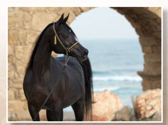
The Vision