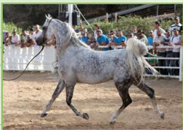
AA Assal.

Looking at him today one might never guess, but at only four years old, Laheeb suffered a tragic accident and was slated to be humanely destroyed. After finishing a second successful breeding season in Poland, the Ariela team decided that it would be a good idea to attempt a freeze of Laheeb's semen. Since the technology was not yet available in Israel, it was arranged to send him to an equine center in Germany while he was still in Europe.