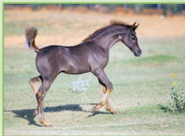
Basmah AA