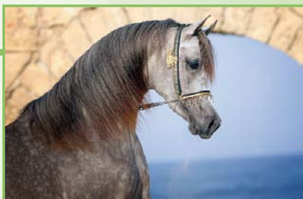
Al Hadiyah AA