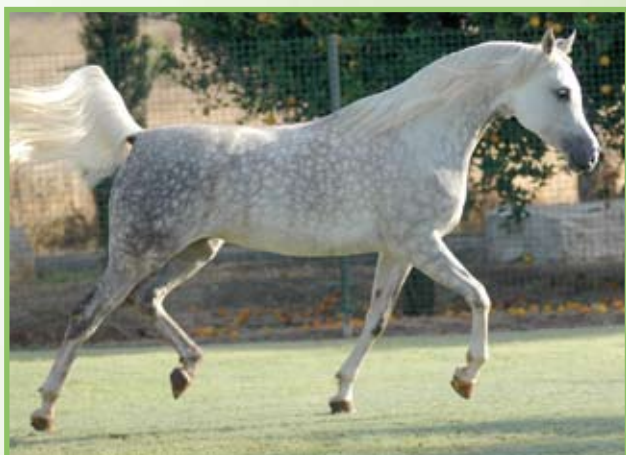
Dumka - Photo by Shira Yegar