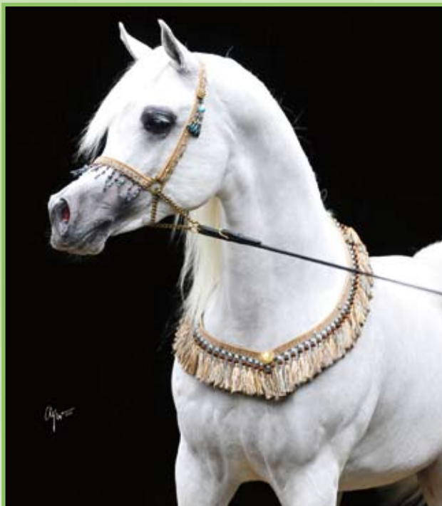
Al Lahab