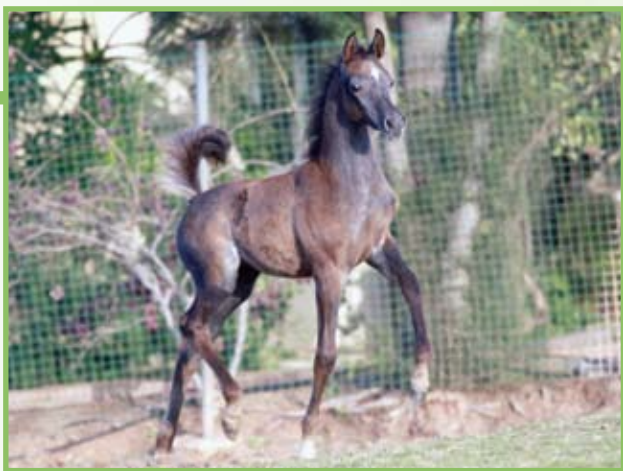
Safiyyah AA

are the most emotional of souls. But we simply couldn't believe that after all we had been through from the time that Laheeb was injured, here we were – once again standing in a show ring – with Laheeb! And Laheeb was there beside us, standing on all four legs – perfectly sound! It was an incredibly emotional, unforgettable moment for us both."