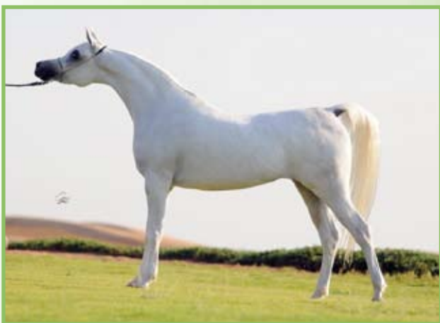
Badawiyeh AA