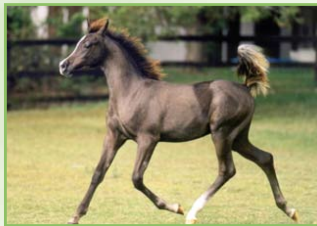
Laheeb in Israel.