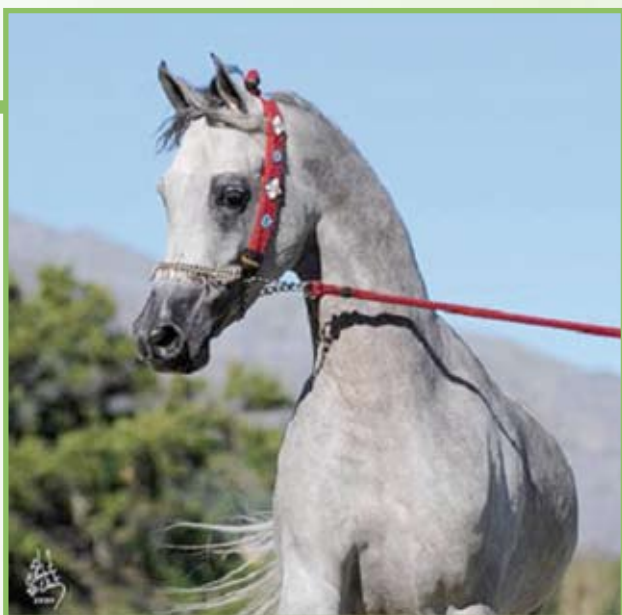
Atiq Haleeb