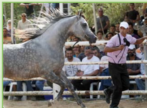
Al Raheb AA