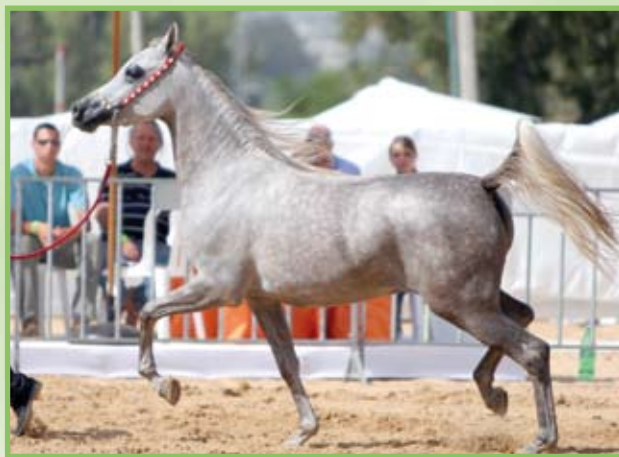
Omniet Al Ayun