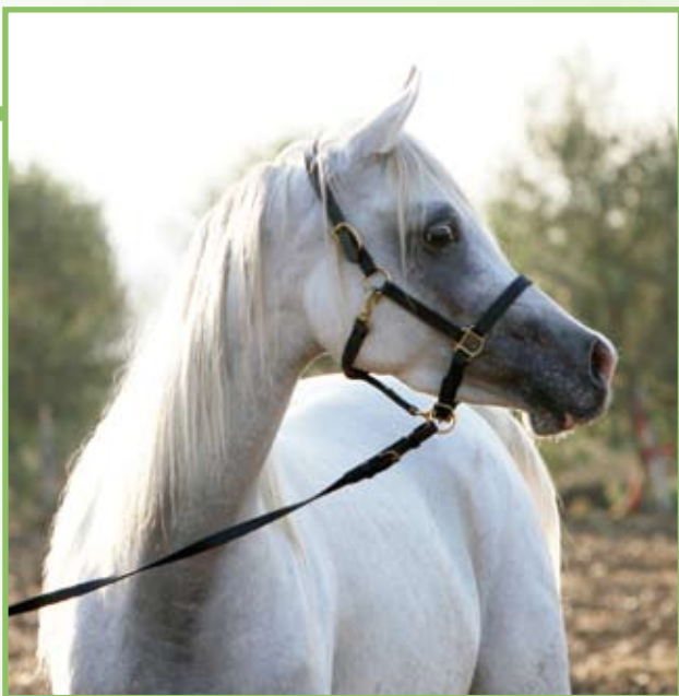
Atiq Ayla - Photo by M. Cohen