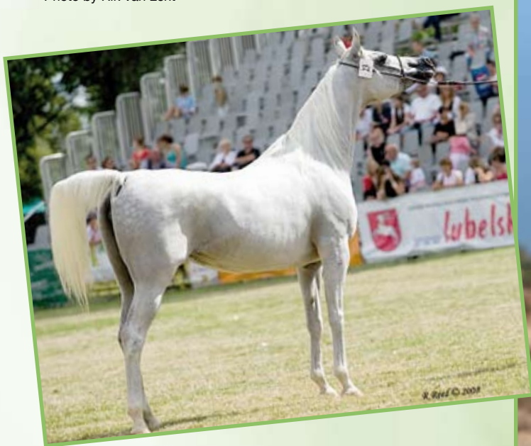
ELLISSARA (out of Ekscella), an ER grey mare bred by Michalow Stud Poland, sold at the 2008 "Pride of Poland" Sale for 240,000 Euro to Saudi Arabia.