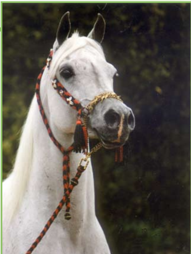
Imperial Imdal