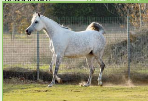
Baraaqa AA