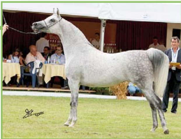
Wieza Babel