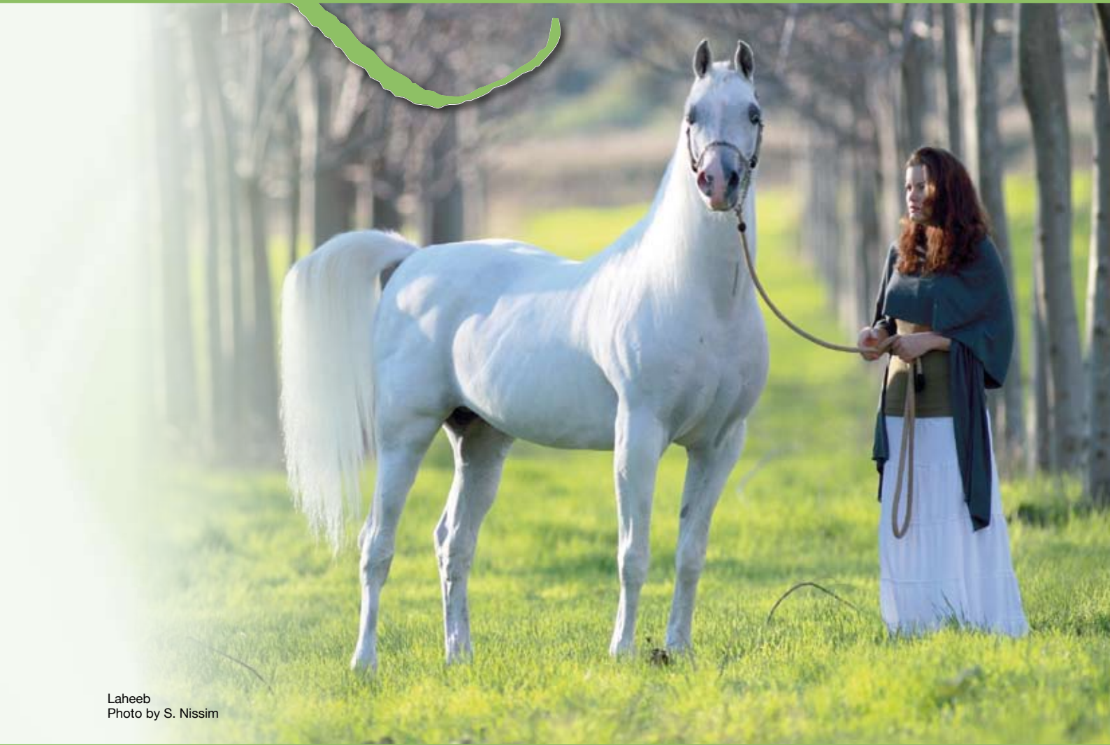
Laheeb

"Laheeb is a dream horse. He is beautiful, very complete and without defects. His disposition is unbelievable. I have never seen a stallion as gentle and as peaceful as Laheeb, all without losing a bit of any of the traits that you want in a stallion. He is tremendously charismatic and always the perfect gentleman."