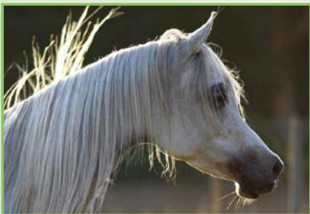
Al Halah AA