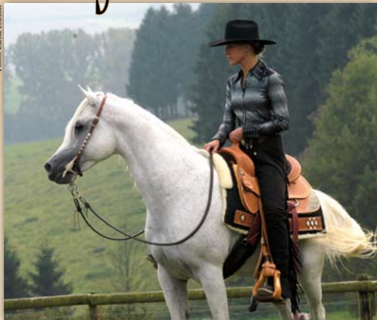
ADAWI - (Maysoun x Ameenab II), stallion Awarded a gold medal at the annual German Stallion Show