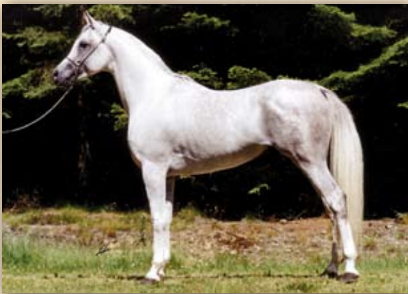
MAYSOUN - four years old

victory for this ultra-refined son of Maysoun. The Reserve Senior Champion Stallion of the prestigious Egyptian Event Europe in Belgium was the beautiful Maysoun grandson Kamal (who also won the "most beautiful head" class) and Maysoun's very classic granddaughter Authentic Monisa shone as the Senior Champion Mare at the German Nationals.