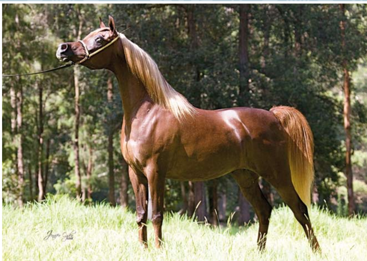
Simeon Sehavi (Asfour x Simeon Sheba)