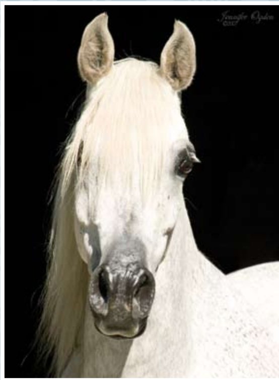
Seimeon Setavi, granddaughter of Asfour dam of Simeon Sahron