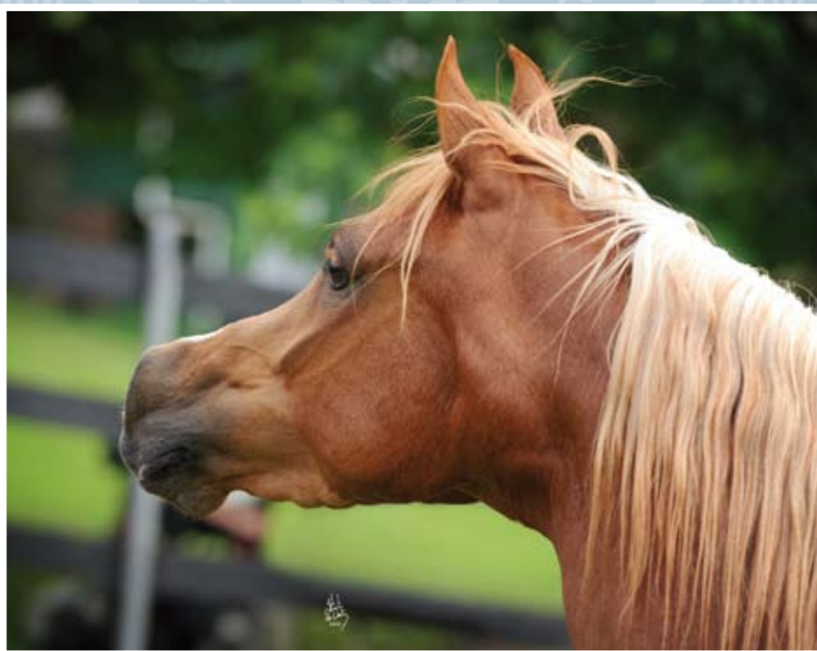
Simeon Salaeh (Asfour x Simeon Sibolet)