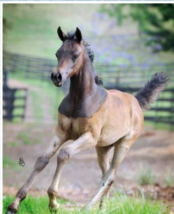
2012 Colt by Simeon Shifran x Simeon Sanaa