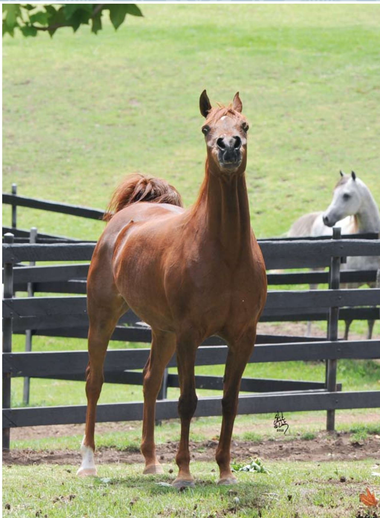
Simeon Sibolet (Asfour x Ramses Tinah)