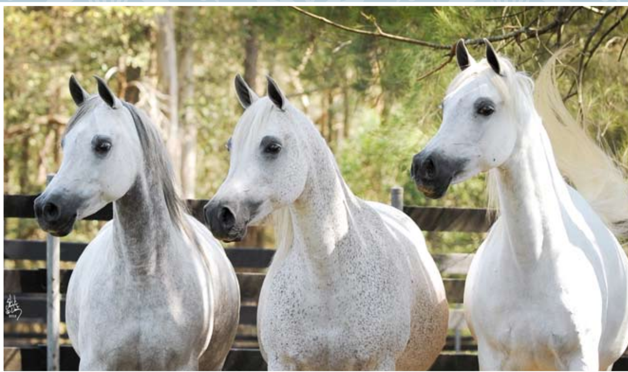
Simeon Saada (Asfour x Simeon Safanad) with daughters Simeon Sepharad (by Asfour) and Simeon Saadia (by Imperial Madaar)