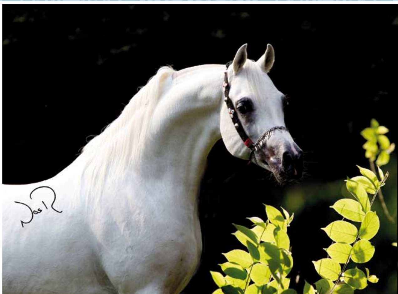
Simeon Sharav (Asfour x Simeon Shuala)