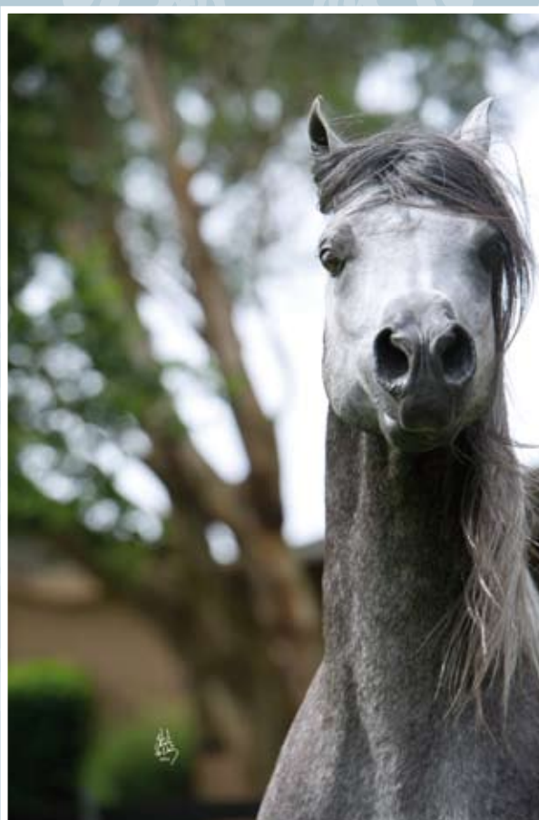
Simeon Shifran (Asfour x Simeon Shavit)