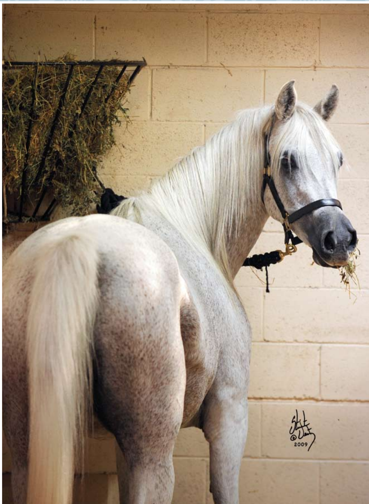
Simeon Saada (Asfour x Simeon Safanad)