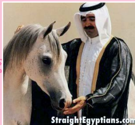
Royal Khalifa Photo: Van Lent