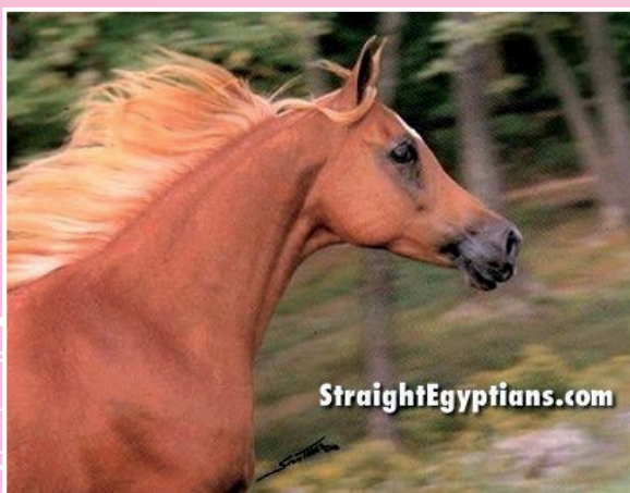
Imperial Phanadah