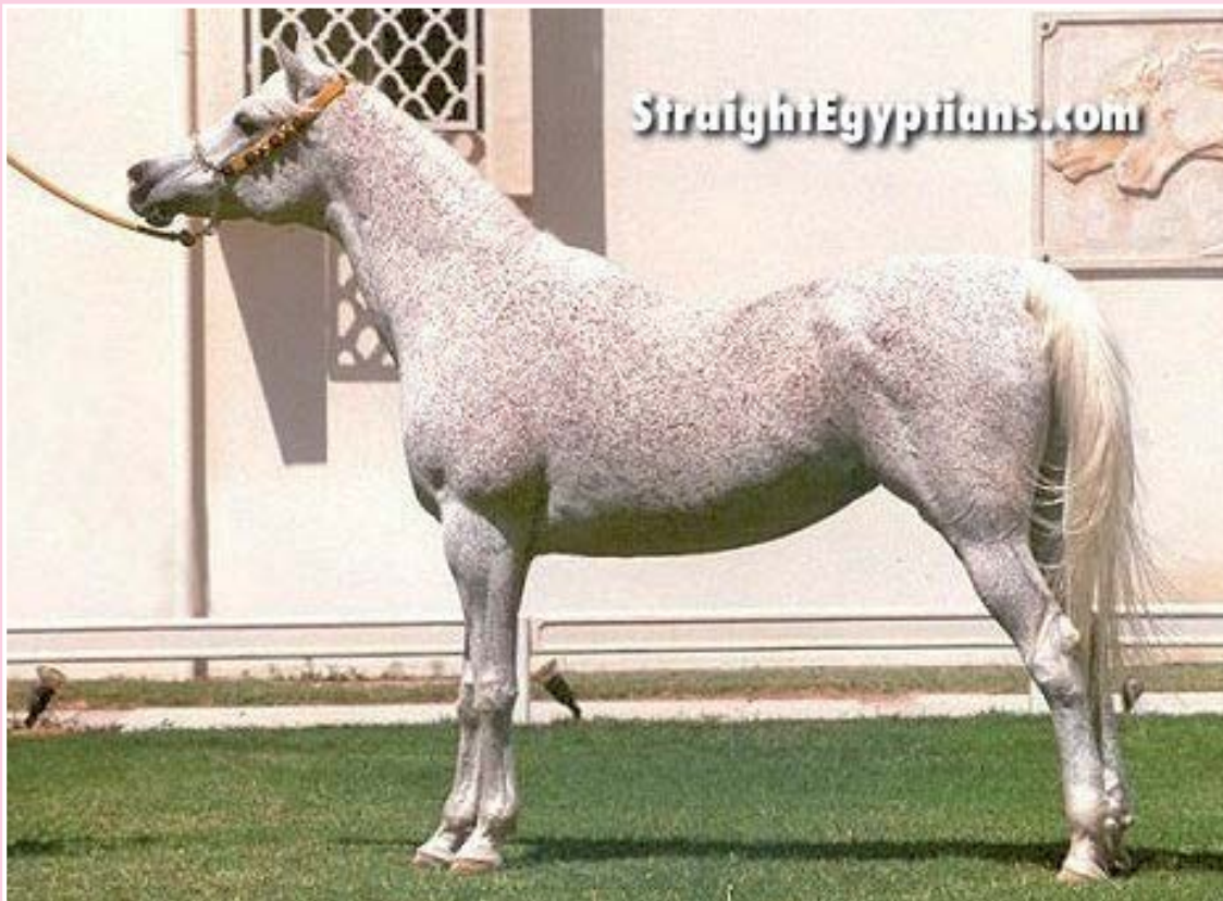
Imperial Phanilah in Qatar