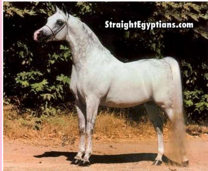
Royal Jalliel