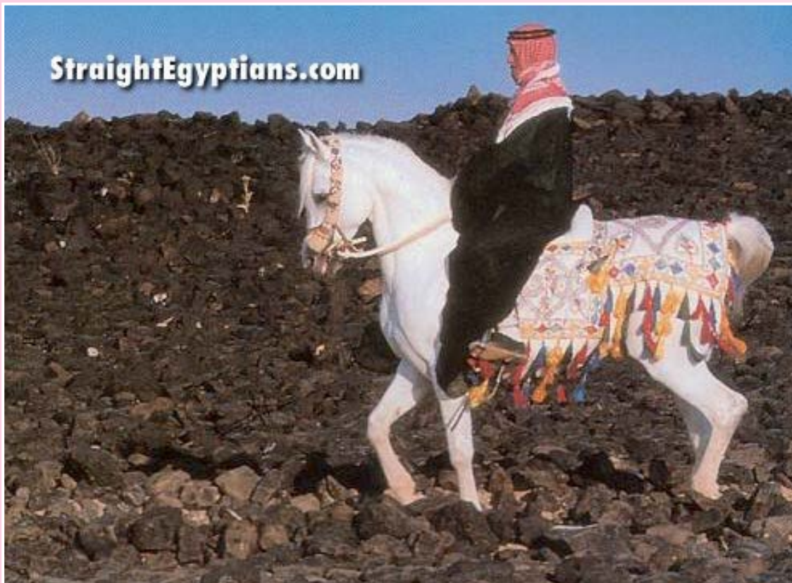
Royal Mikhiel

daughters and one son, the grey Royal Phariel (Royal Jalliel x Royal Pharriel). He resembles Pharraah very much and one should keep him in mind. He certainly still needs time to mature but then one should have a look at him again!