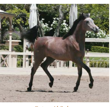
Orion Al Saba