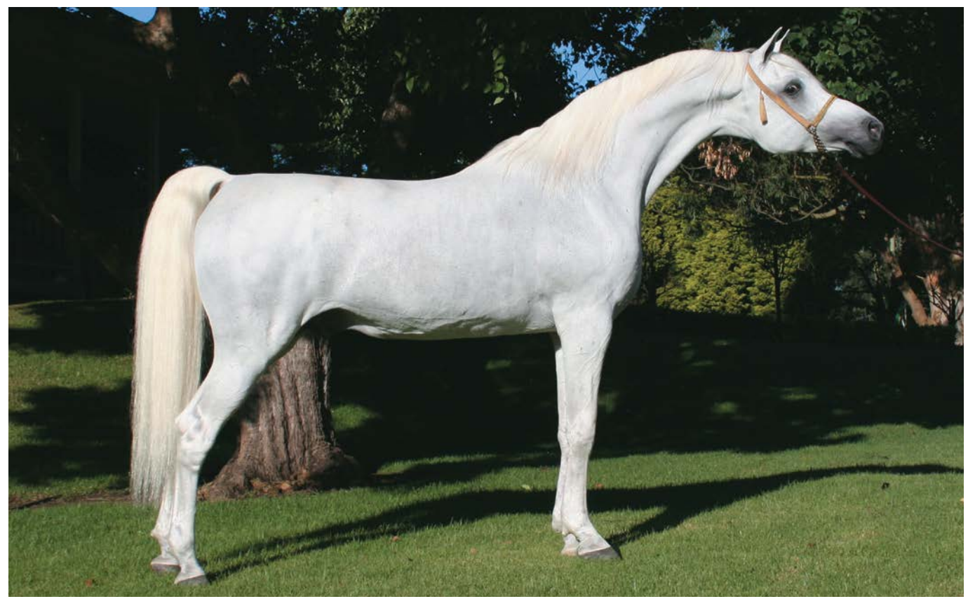
Orashan pictured at 26 years of age