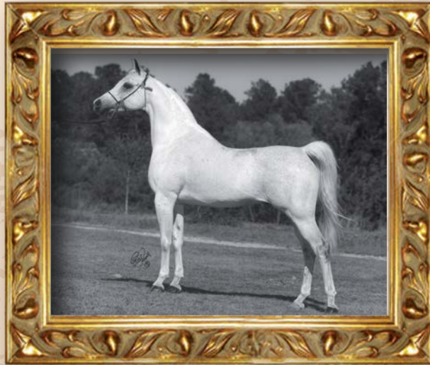
the classic Ansata Abu Nazeer (Ansata Ibn Halima x Ansata Bint Zaafarana).

a classic mare with beautiful action owned by American actress Jennifer O'Neill. Nahid's son Mazin was imported to the U.S. by Lancer's Arabians as a young horse. I saw him shortly after importation and I was struck by his classic type and very fine skin and cle- an bone. He was later exported to Morocco. Nahid's other daughter Kalthoom was sired by the ethereal Farazdac, sire of Ikhnatoon, and she remained a good broodmare at the EAO.