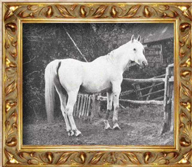
The "broken legged mare" Bint Helwa, female line of Zaafarana.

Sherif's stock the Blunts had taken particular interest in the Saqlawi Jidrans of Ali Pasha and wanted very much to have the lovely Bint Helwa among others. She arrived at Sheykh Obeyd with her filly Ghazala (x Ibn Sherara). Later on Bint Helwa would be shipped to Crabbet in England to be a brood mare for that stud. Shortly after being at Crabbet, there was a running incident where a group of mares rushed through a fence area and Bint Helwa broke her front legs. A special sling was created and she was saved. She was always referred to thereafter as the "broken legged mare." Photos show her to be a very beautiful mare even with her wrapped front legs. Looking at the photos, I cannot help but be reminded of the legend of the old crippled Saqlawi mare for which Abbas Pasha paid a fortune.