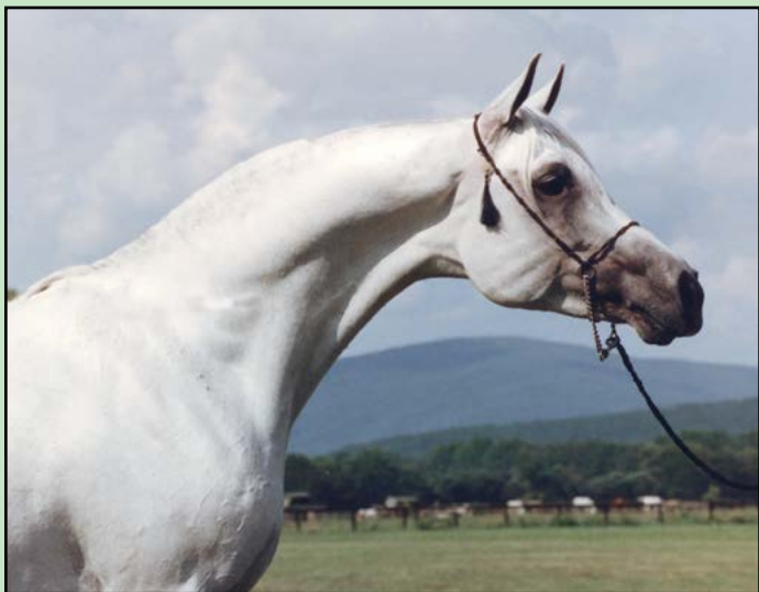
Prince Fa Moniet (TheEgyptianPrince x Fa Moniet by Ibn Moniet El Nefous)

Refky was a tall bold chestnut horse born in Egypt who had a racing career before being imported to the U.S. He was a maternal half brother to the EAO sire Mohawed (x Alaa El Din). TheEgyptianPrince was a full brother in blood to Ansata Shah Zaman. He was smaller horse, quite refined with a handsome noble expression and nicely shaped head with small muzzle. There was style and agility to his movement. Perhaps TheEgyptianPrince's most internationally renowned son is Prince Fa Moniet, sire of many excellent Ansata bred mares as well as the important sires AK Shah Munifeh (x AK Munifeh), Ansata Iemhotep (x Ansata Nefara) and Ansata Sinan (x Ansata Nefara). In his lifetime TheEgyptianPrince was to prove a very popular sire producing 826 foals. He also may have been the longest living Morafic son living to age 28. The chief sire at Bentwood was Ibn Moniet El Nefous, the result of breeding Morafic to his granddam making him 62.5% Moniet El Nefous blood, the highest in any Egyptian. He was imported to the