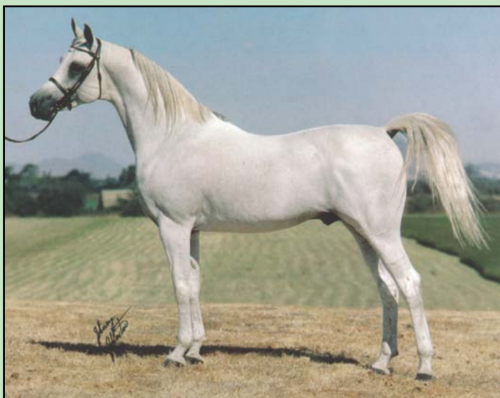
Ibn Moniet El Nefous (Morafic x Moniet El Nefous).