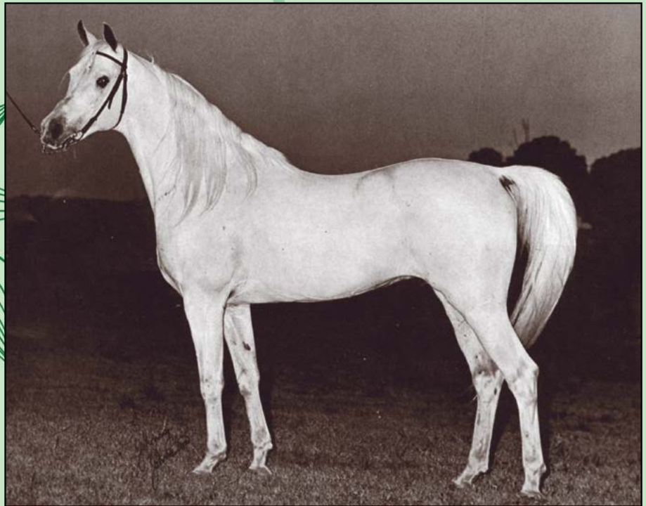
Morafic in his prime at Gleannloch Farms.

mind ed me it was something bigger. It was not just Morafic but it was the vision of the noble horse that is supreme and timeless, the gift of Allah that is unequalled. It is what we all look for in the ideal Arabian horse. It was that special, almost indescribable essence that stops us in our tracks. In Khofo's