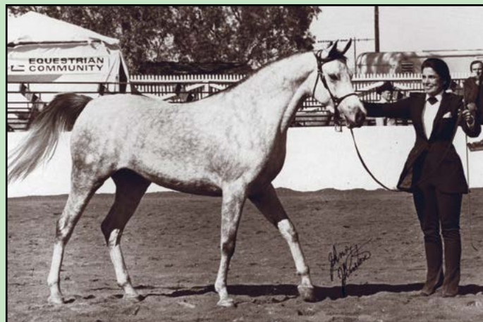
Dalia (Morafic x Romanaa II by Sameh) Many times champion and dam of Imperial Imdal.

Morafic's grandson Sakr had again returned to the stallion row at the Fair. Again he was a crowd favorite as a brilliant performer in the show portion of the Fair. His son, Nabel was also in the stallion row. The young Nabel was to later