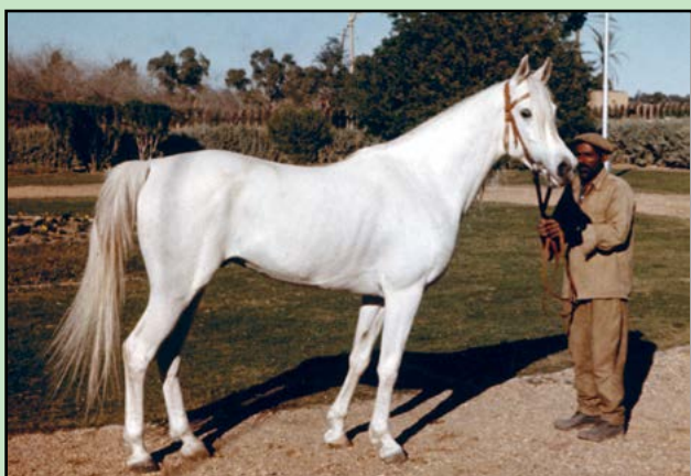
Images of Morafic as a young horse in Egypt.