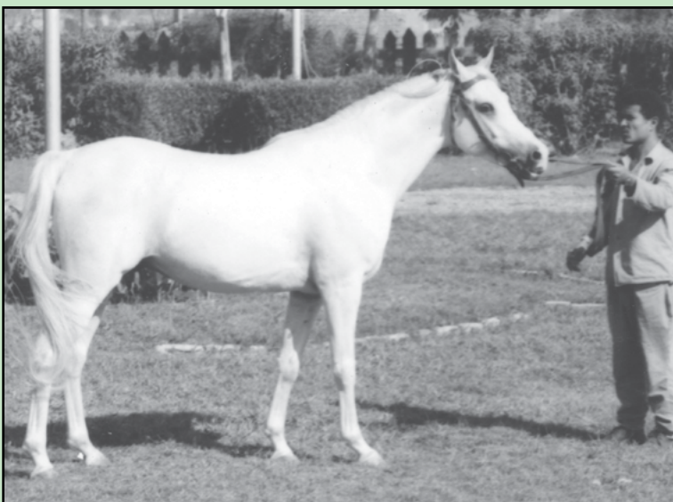
Ghalion (Morafic x Lubna by Sid Abouhom) imported to Hungary for the Babolna Stud. Photo here taken in Egypt prior to his exportation.