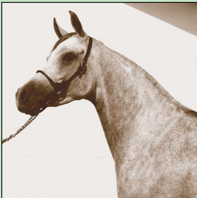
The beautiful Nahlah (Morafic x Mohga by El Sareei) many times U.S. National winner in halter and performance.

That same year was the second Arabian Horse Fair and it was an even bigger event than the year before. Included in the stallion row were 24 straight Egyptian stallions among which were seven Morafic sons and four grandsons: Ansata El Emir (Morafic x Ansata Sabiha by Ansata Ibn Halima)