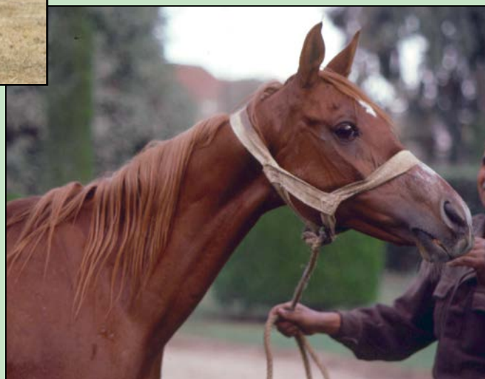
The lovely Farfoura (Morafic x Bint Mona) full sister to TheEgyptianPrince, Il Muna and Norra. She was foaled in Egypt prior to her dam being imported with Morafic. She remained a broodmare for the EAO.