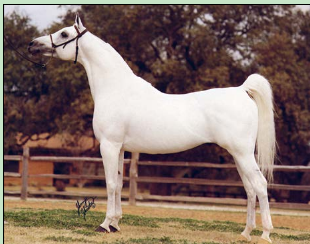
TheEgyptianPrince (Morafic x Bint Mona).

It was only natural that our next visit be to Bentwood Farms in Texas where three sons of Morafic were at stud: Refky (x Rafica by Nazeer), TheEgyptianPrince (x Bint Mona) and Ibn Moniet El Nefous (x Moniet El Nefous).